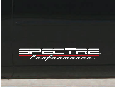
For dark vehicles