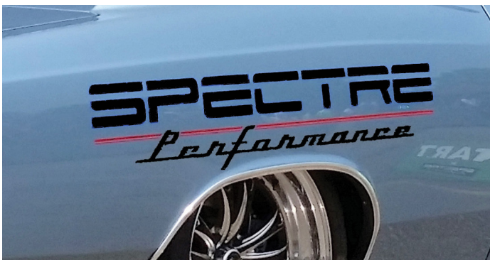
Examples in use

Stroke must be 20% of the height of the logo to ensure visibility