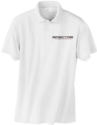
For light apparel

When using the Spectre® logo on apparel, always follow the rules listed on the previous pages.