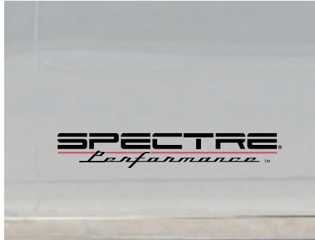
For light vehicles