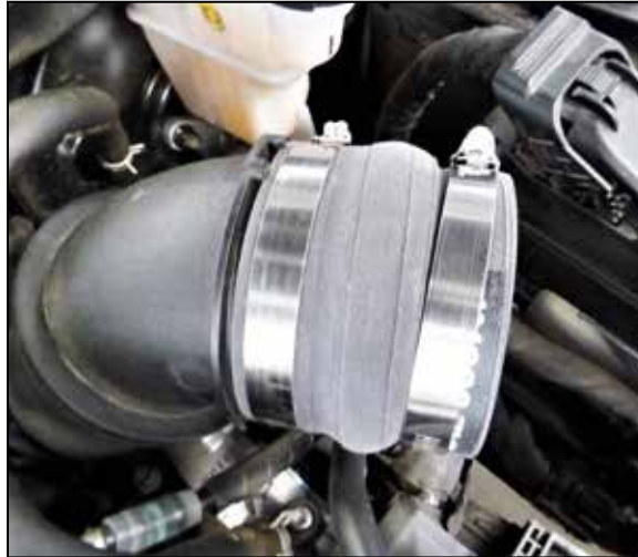
12. Install the provided hump coupler onto the turbo inlet and secure with the provided hose clamp.