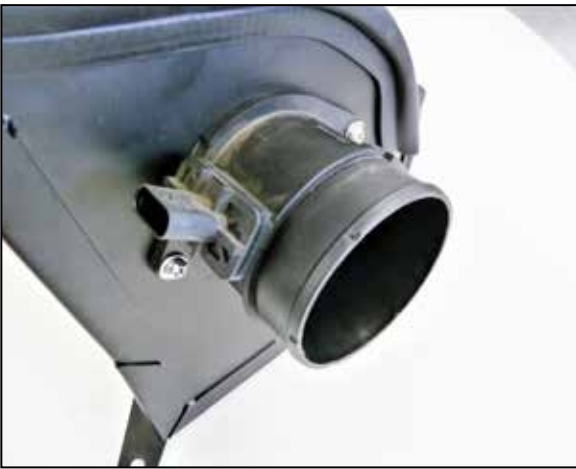
9. Using the provided hardware attach the mass air sensor to the heat shield as shown.