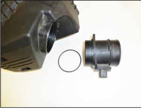
7. Remove the mass air filter from the factory air filter housing and then remove the O-ring seal from the sensor.