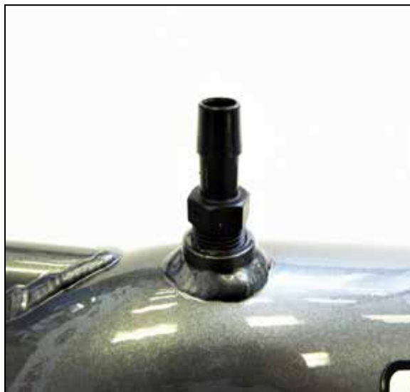
14. Install the provided vent fitting into the K&N intake tube as shown.