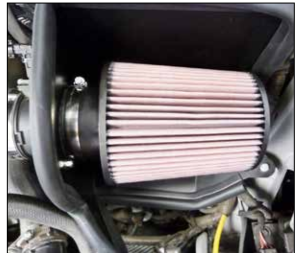
18. Install the air filter onto the mass air sensor and secure with the provided hose clamp.