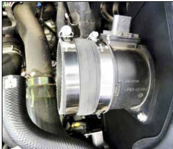
13. Install the provided straight coupler onto the mass air sensor and secure with the provided hose clamp.