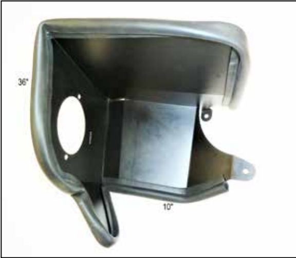
8. Cut the provided edge trim into sections of 10" and 36" and then install the edge trim onto the heat shield as shown.