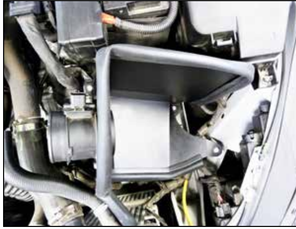
11. Install the heat shield assembly into the vehicle so the mounting stud inserts into the mounting grommet, then secure with the provided hardware.