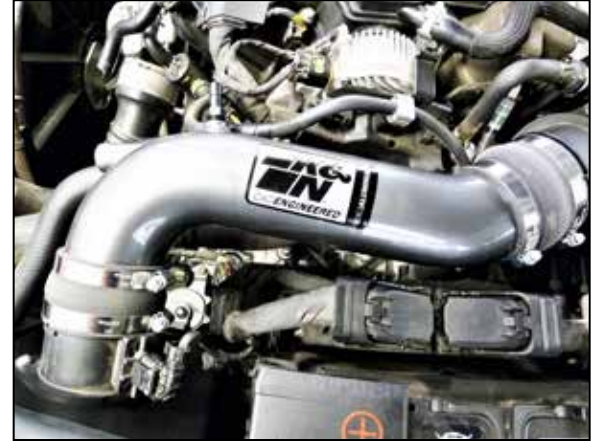
15. Install the intake tube into the hump coupler and then into the straight coupler, adjust for best fit and then secure with the provided hose clamps.