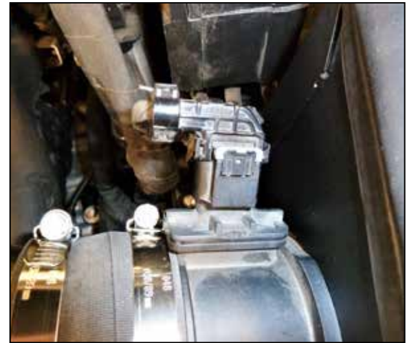
17. Reconnect the mass air sensor electrical connection.