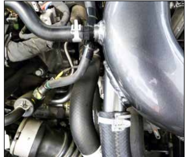
16. Connect the BOV hose and the vent line and secure with the provided spring clamp.