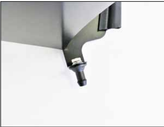
10. Install the mounting stud to the heat shield as shown.