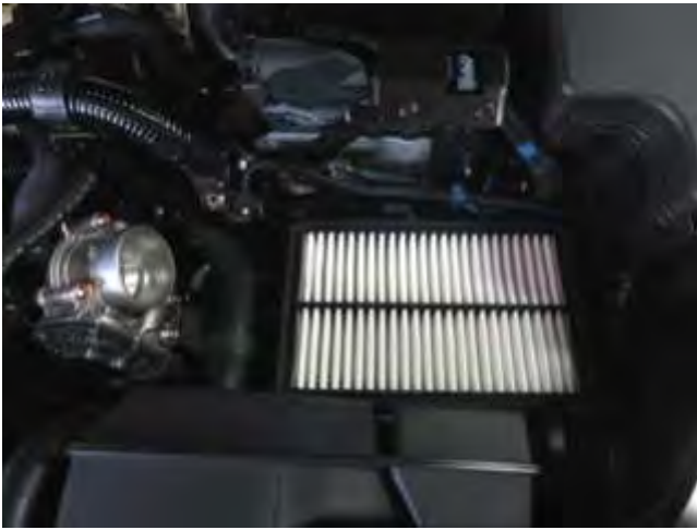
g. Remove the air box lid along with the air inlet hose.