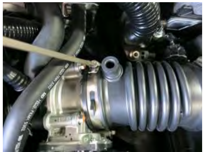
d. Loosen hose clamp securing coupler to throttle body.