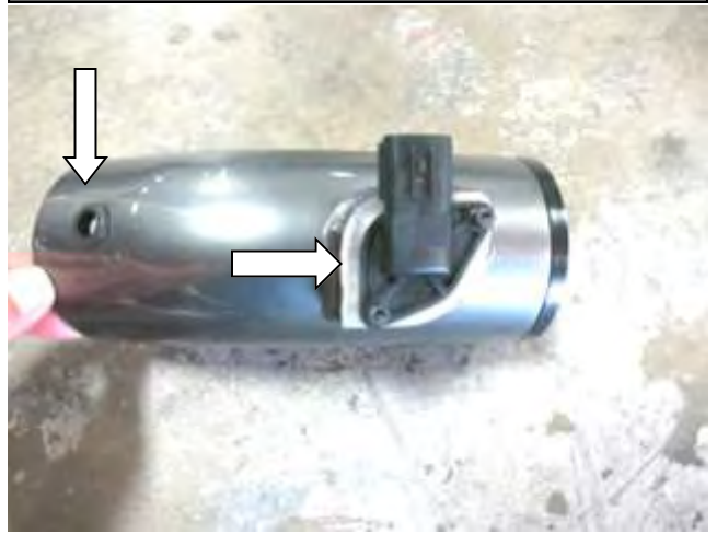
h. Install MAF sensor and rubber grommet into the AEM intake tube as shown.