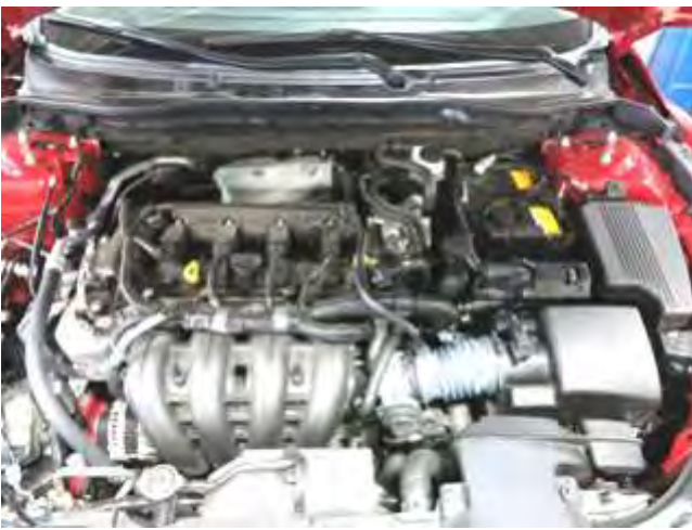
a. Remove engine cover by gently pulling it up and away from the top of the engine.