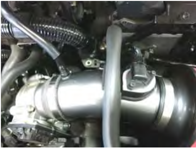
l. Install the breather hose into the coupler and reconnect the MAF sensor wiring.