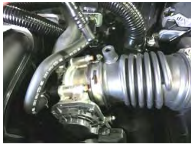
b. Remove breather hose from factory coupler.