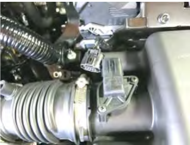
c. Unplug MAF sensor harness.