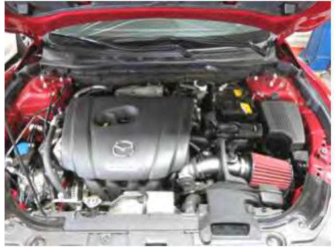
p. Finished installation of AEM Intake System.