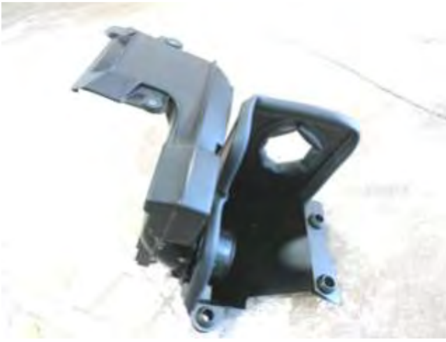
e. Install edge trim around the intake tube pass through hole and around the AEM heat shield then install the air scoop into the AEM heat shield assembly.