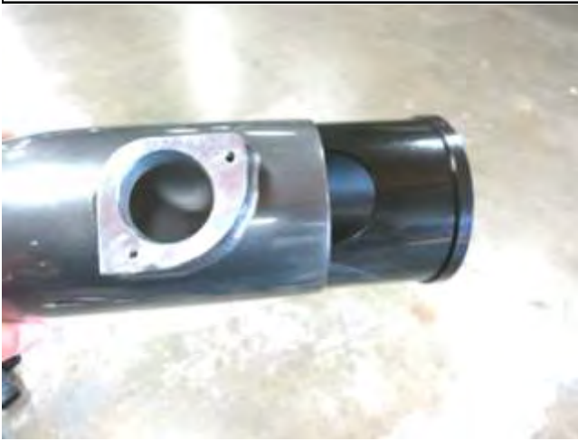
g. Install the supplied MAF sleeve into the AEM intake tube and line up the opening to the MAF adaptor.