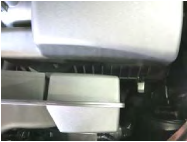
f. Unclip air box lid from lower air box.