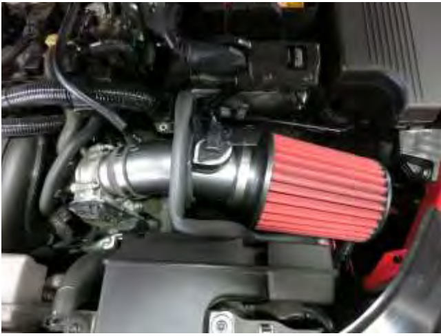
m. Check for clearance around the filter, heat shield and intake tube then tighten all hose clamps. Reinstall the engine cover.