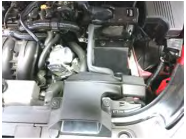
f. Install the AEM heat shield assembly into the engine compartment by lining up the three rubber grommets and secure with factory M6 bolts.