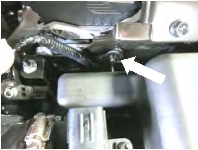
e. Use needle nose pliers to unclip wire harness from air box.