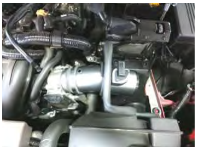
j. Install the AEM intake tube through the heat shield to the throttle body coupler as shown.