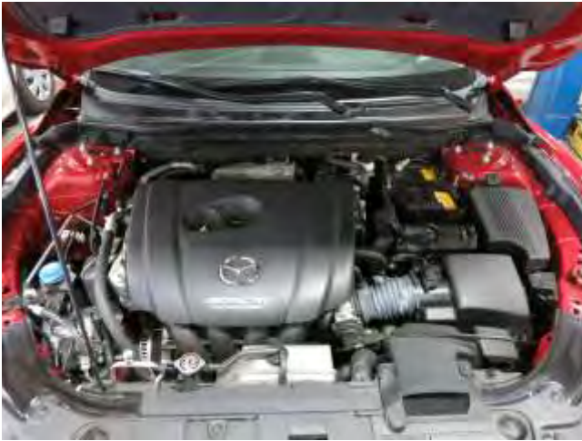
o. Factory air induction system.