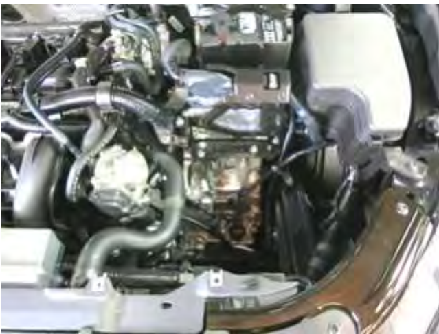
i. Gently remove factory lower air box and factory cold air inlet scoop.