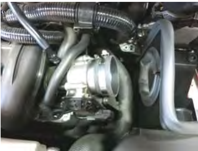
i. Install provided coupler with hose clamps onto throttle body. Do not tighten hose clamps at this point.