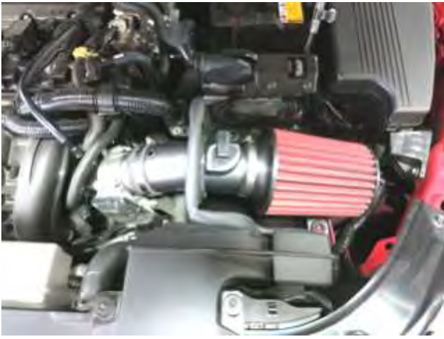
k. Install the AEM filter onto the intake tube.