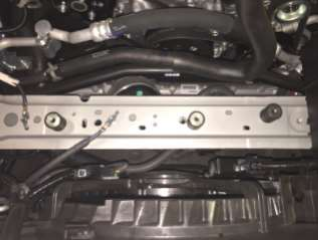
a. Install the supplied rubber isolator mounts into the engine compartment as shown.