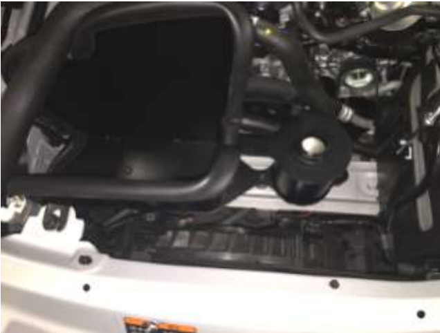
c. Install the complete heat shield assembly into the engine compartment as shown and secure with supplied hardware.