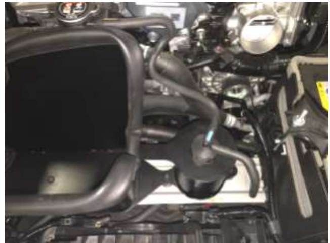
d. Transfer the coolant from the factory tank into the AEM reservoir and seal with factory cap. The capacity of the AEM reservoir is different from the factory reservoir but it does not affect the functionality.