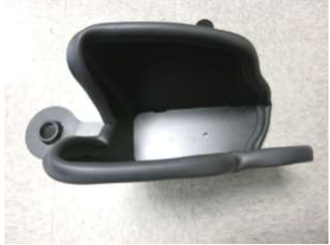
b. Install the supplied rubber edge trim onto the AEM heat shield assembly as shown.