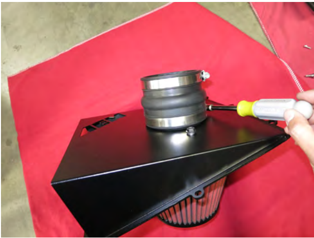
e. Install the hump hose (08657) and fasten it to the adapter using the hose clamp. Slide hose clamp onto the other end.