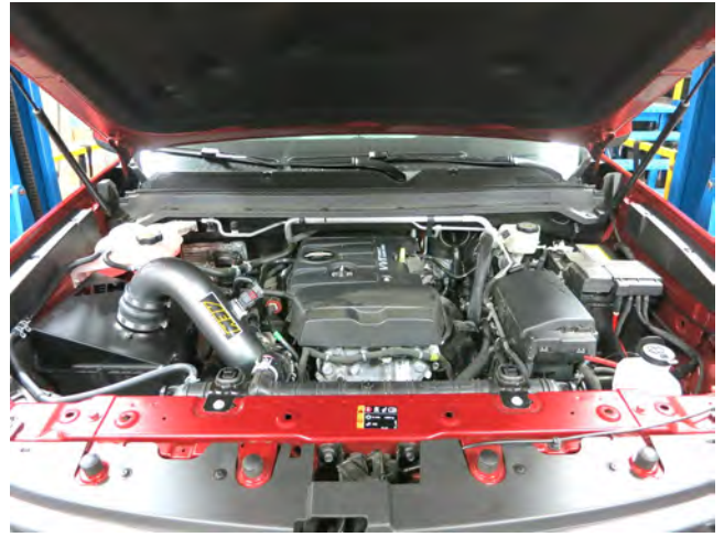
l. Finished installation of AEM Intake System.