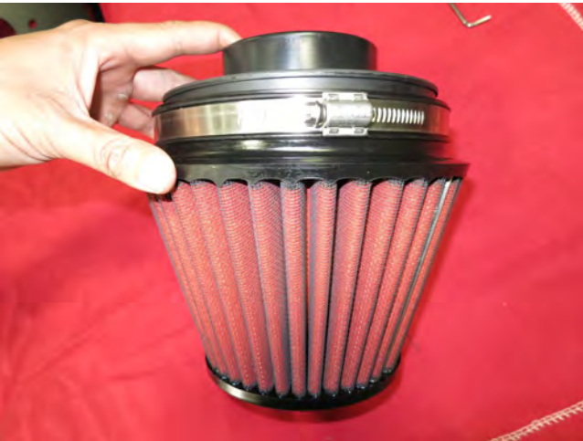
c. Insert the filter adapter into the filter and fasten with the hose clamp provided.