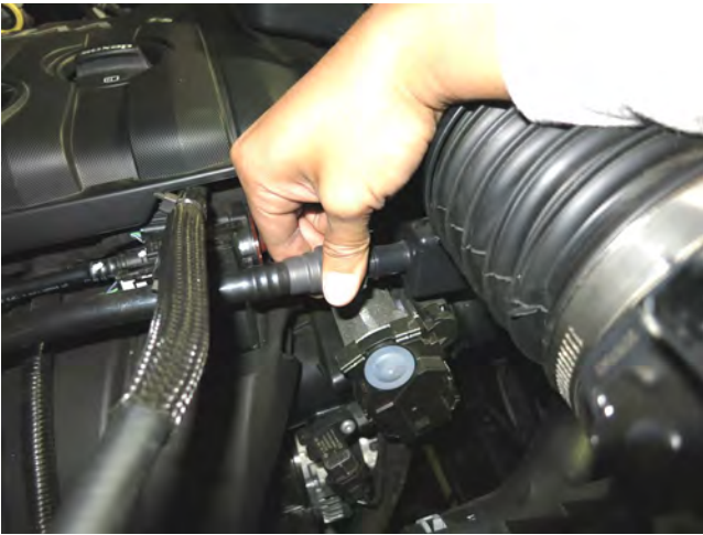
e. Disconnect the breather hose located at the rear of the stock intake tube.