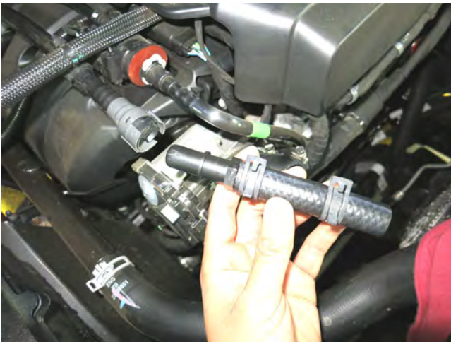
g. Assemble the hose with the spring clamps and quick disconnect nipple provided.