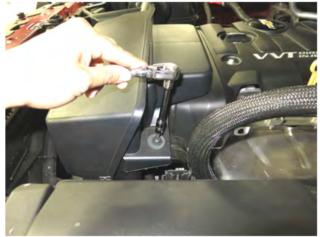
b. Use a T30 Torx bit to remove the indicated bolt on the upper intake resonator.