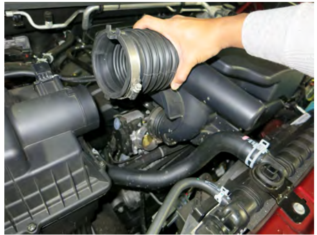
f. Slide the couplers off the airbox lid and throttle to remove the upper resonator assembly.