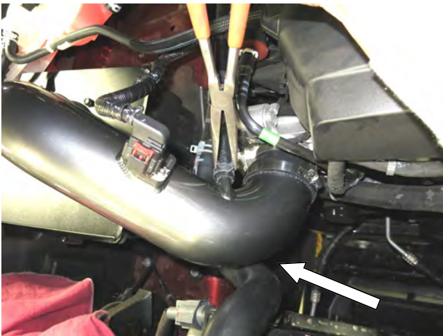
i. Use pliers to slide the spring clamp over the welded nipple. Reconnect the MAF harness to the sensor. Check for clearance with coolant hose and tighten hose clamps.