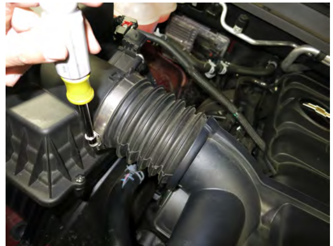
d. Loosen the hose clamp securing the bellow coupler to the airbox lid.