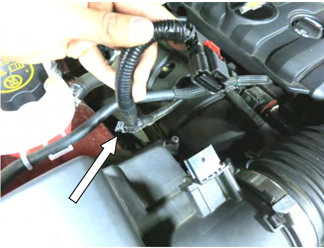
a. Disconnect the wire harness from the MAF sensor. Carefully pry off the wire mounting clip from the airbox lid.