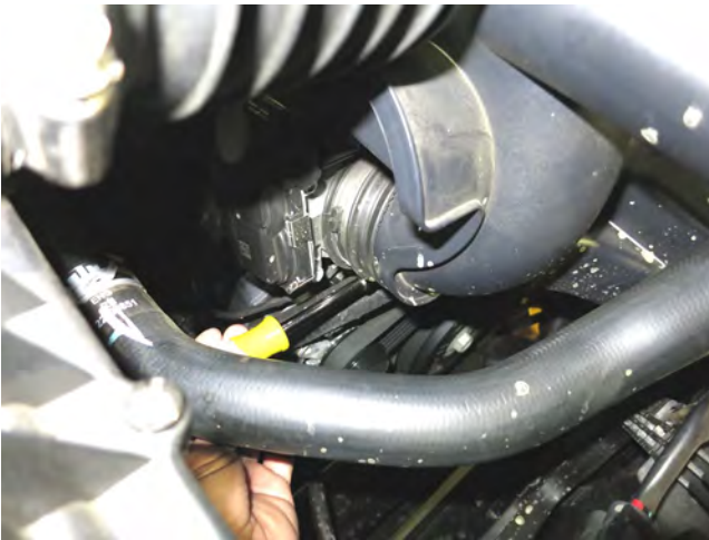
c. Loosen the hose clamp securing the upper resonator to the throttle body.