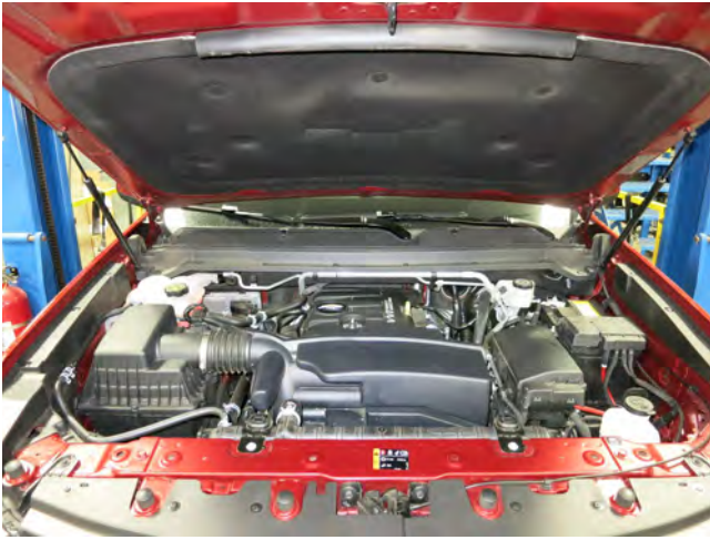
k. Factory air induction system.