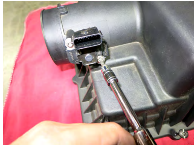
h. Use a T20 Torx bit to remove the MAF sensor from the airbox lid.