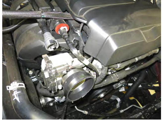
b. Install the coupler (084034) and hose clamps onto the throttle body.