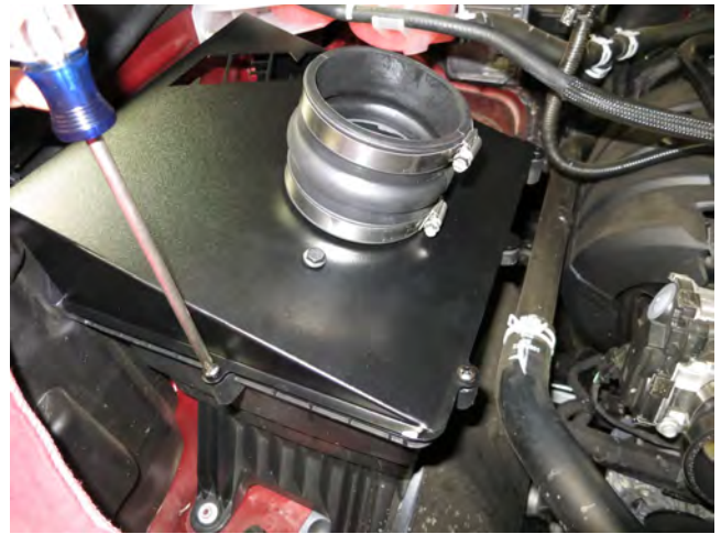
f. Fasten the heat shield to the stock lower airbox using the 4 screws provided.