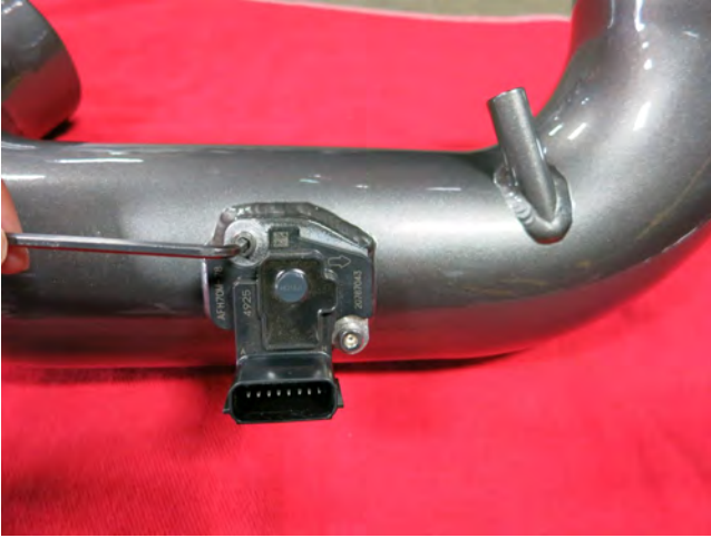
a. Use the provided bolts to install the MAF sensor into the AEM tube.