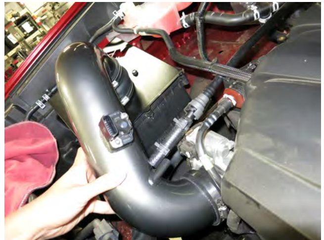
h. Connect the hose assembly and install the AEM tube as shown.