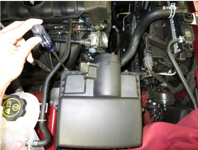
g. Use a Phillips screwdriver to remove the 4 screws securing the airbox lid to its base.