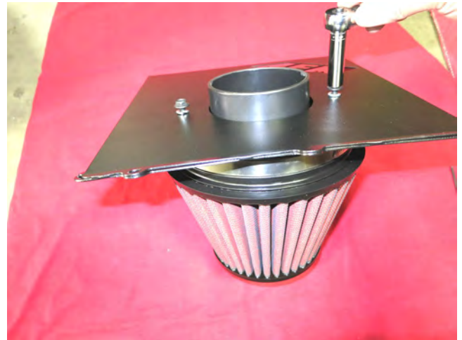
d. Fasten the adapter to the heat shield using the crush washers and m6 bolts provided.