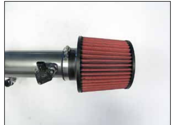
19. Install the AEM® air filter onto the intake tube and secure with the provided hardware.