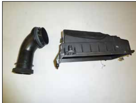
14. Remove the factory fresh air intake duct from the factory air filter housing.