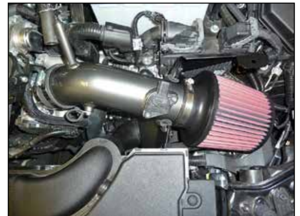
21. Install the intake tube assembly into the coupler at the throttle body and adjust for best fit.