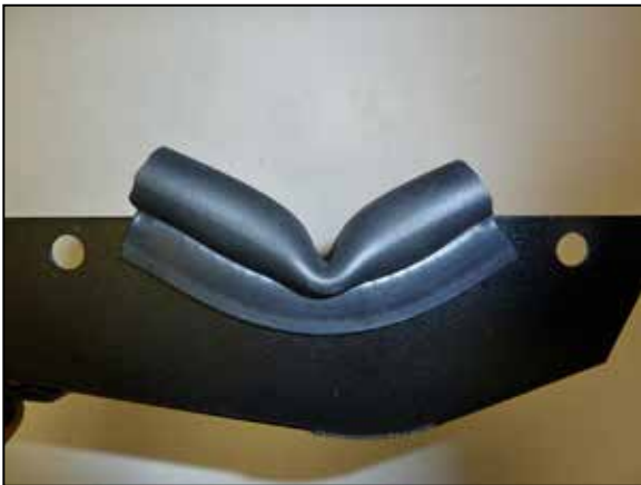
11. Install the 3.5\" edge trim onto the bottom of the heat shield lid as shown.