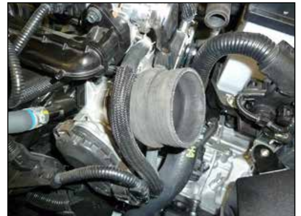
20. Install the provided coupler (084036) onto the throttle body and secure with the provided hose clamp.