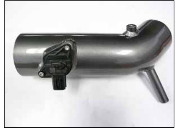
17. Remove the mass air sensor from the factory air filter housing and then install it into the AEM® intake tube and secure with the hardware provided.