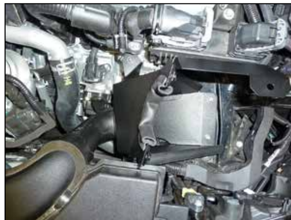
16. Install the heat shield assembly and align the fresh air intake duct. Secure the assembly with the provided hardware.