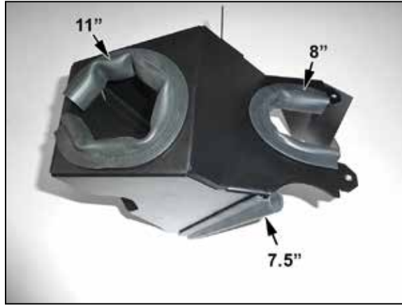
12. Install the 7.5\", 8\" and 11\" edge trim onto the heat shield as shown.