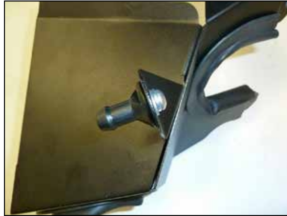
13. Install the mounting stud onto the heat shield using the provided hardware as shown.