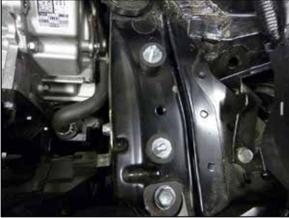
8. Install the two provided rubber mounted studs into the frame at the factory air filter housing mounting locations.