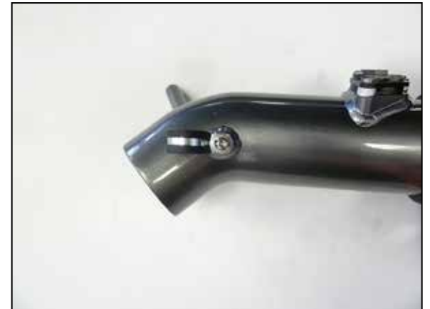
18. Install the provided loop clamp onto the AEM® intake tube and secure with the provided hardware.