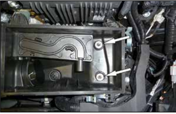
7. Remove the two bolts that secure the lower air filter housing and then remove the housing from the vehicle.