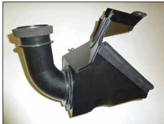
15. Install the fresh air intake duct into the hole of the heat shield as shown.