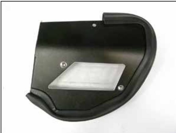
10. Install the AEM® window and 18.5\" edge trim onto the heat shield lid as shown.