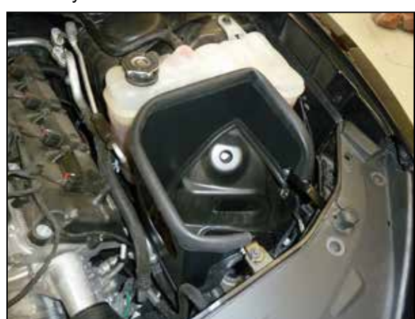
12. Install the heat shield and secure with the provided hardware.