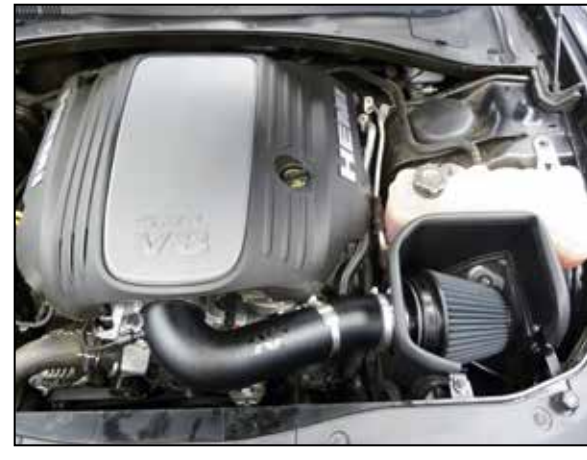
29. Reconnect the vehicle's negative battery cable. Double check to make sure everything is tight and properly positioned before starting the vehicle.

30. It will be necessary for all K&N® high flow intake systems to be checked periodically for realignment, clearance and tightening of all connections. Failure to follow the above instructions or proper maintenance may void warranty.