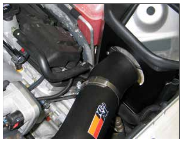
23. On 6.1L equipped models, Connect the factory CCV hose to the 90-degree fitting installed into the intake tube and then connect the open end to the port on the valve cover.