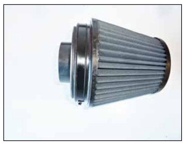
24. Install the filter adapter into the K&N filter and secure with the provided hose clamp.