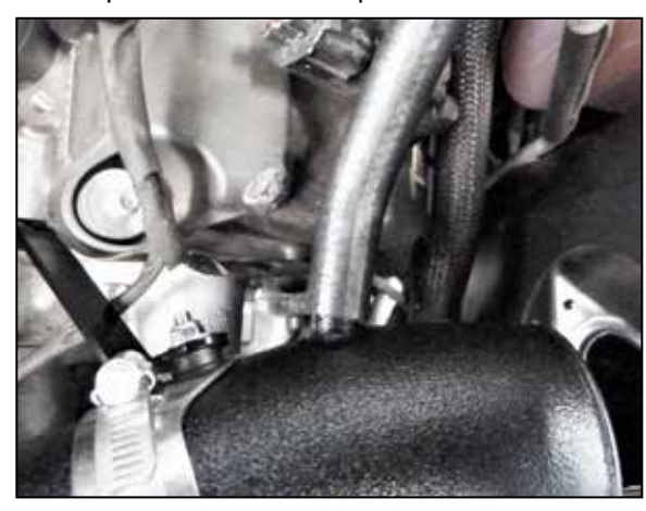
22. On 5.7L equipped models, install the provided CCV hose onto the valve cover vent port and then connect to the K&N intake tube port.