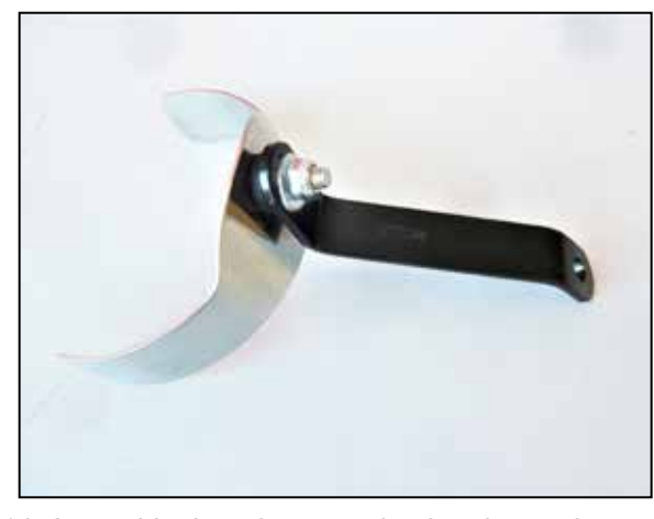
14. Assemble the tube mounting bracket and saddle as shown using the provided hardware.