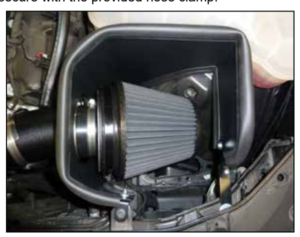
26. Install the filter assembly onto the intake tube and secure with the provided hose clamp.