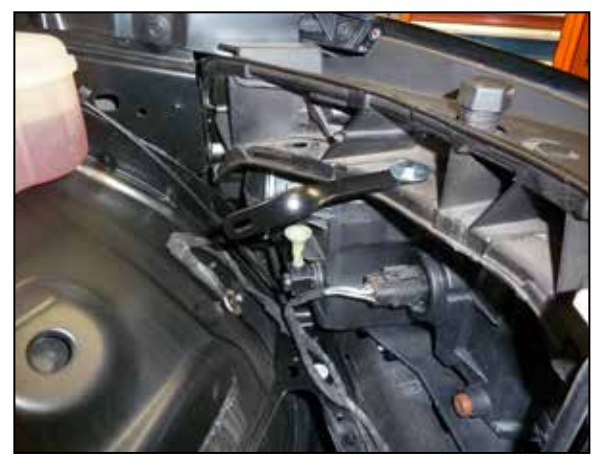
9. Install the heat shield mounting bracket onto the core support using the provided hardware.