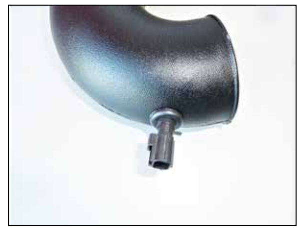
17. Remove the IAT sensor from the factory intake system. Remove the O-ring from the sensor and then install it into the K&N intake tube using the provided grommet.