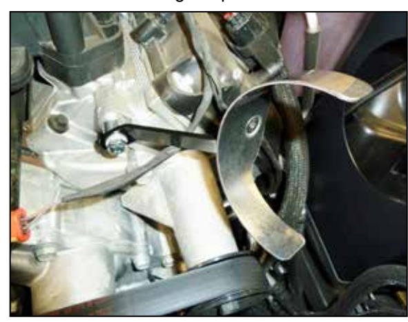
15. Install the tube mounting bracket assembly using the provided hardware and spacer.