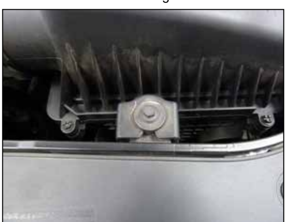
7. Remove the bolt that secures the air filter housing to the core support.