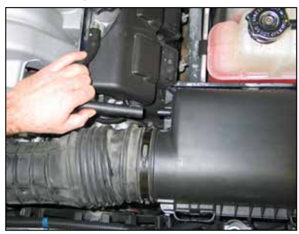
6. On 6.1L equipped models, disconnect the CCV hose from the air filter housing.