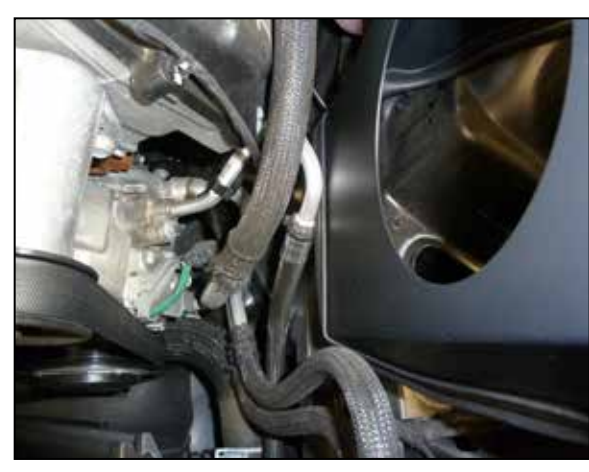
13. Due to vehicle manufacturer tolerances, The A/C lines on some vehicles may need to be repositioned slightly so that they do not contact the heat shield. To adjust, grab the A/C line in the aluminum section and carefully apply pressure in the desired direction until clearance is obtained.