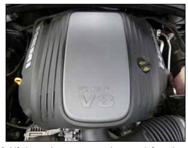
2. Lift the engine cover up and remove it from the

NOTE: Disconnecting the negative battery cable erases pre-programmed electronic memories. Write down all memory settings before disconnecting the negative battery cable. Some radios will require an anti-theft code to be entered after the battery is reconnected. The anti-theft code is typically supplied with your owner's manual. In the event your vehicles anti-theft code cannot be recovered, contact an authorized dealership to obtain your vehicles anti-theft code.