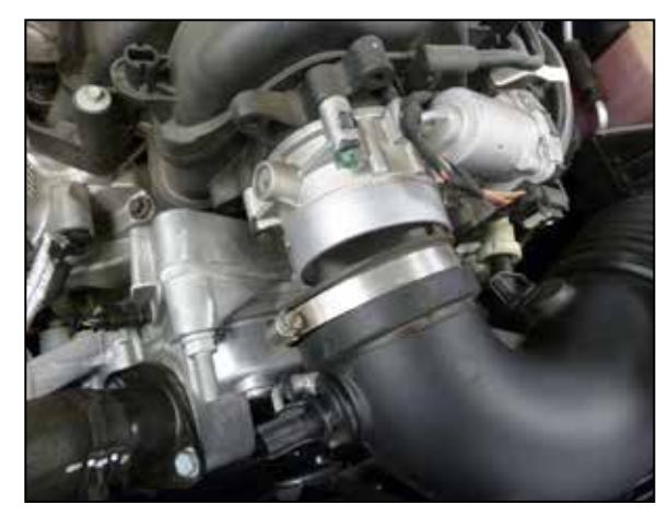
4. Loosen the hose clamp that secures the intake tube to the throttle body and disconnect the tube from the throttle body.