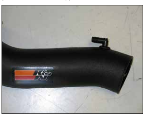
20. Install the provided 90-degree vent fitting and grommet.