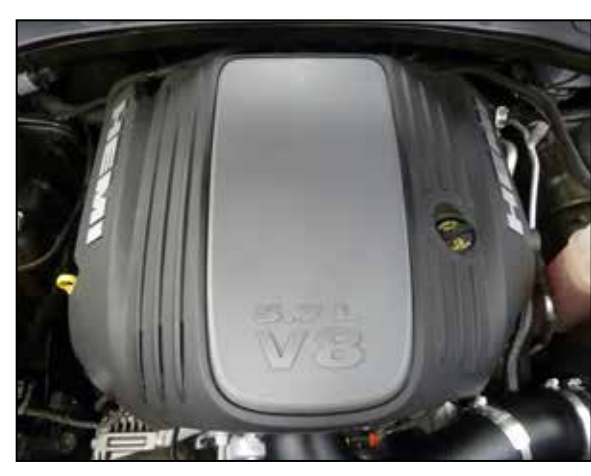
28. Reinstall the engine cover.