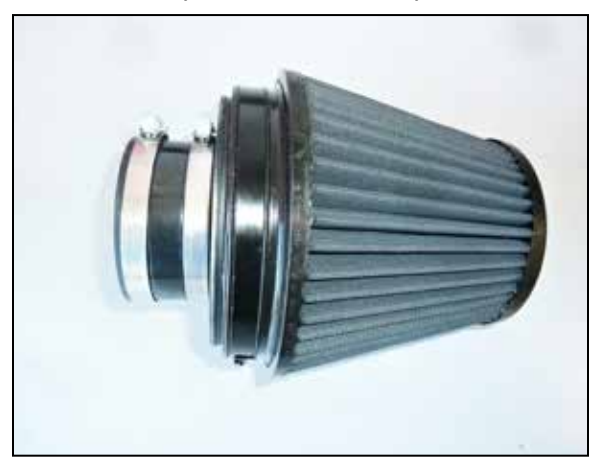
25. Install the coupler onto the filter adapter and secure with the provided hose clamp.