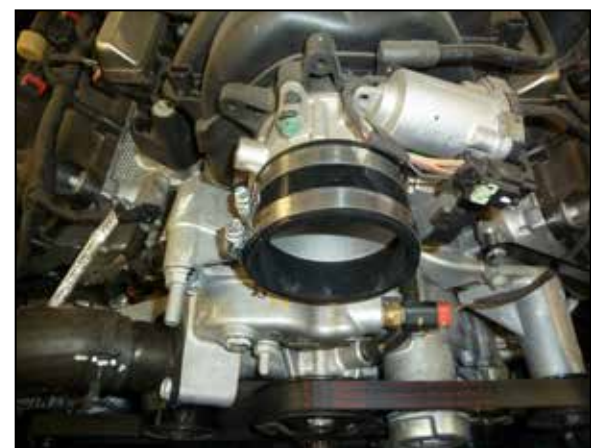
16. Install the provided coupler onto the throttle body and secure with the provided hose clamp.