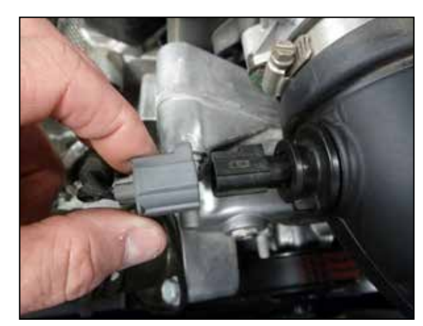
3. Disconnect the IAT sensor electrical connection.