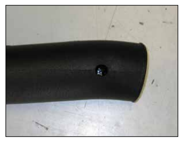
19. Drill out the hole to 3/4"id.