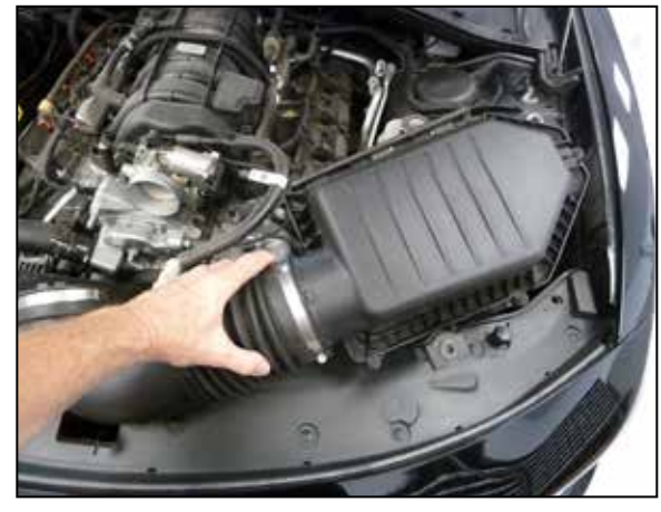
8. Remove the complete intake assembly from the vehicle.