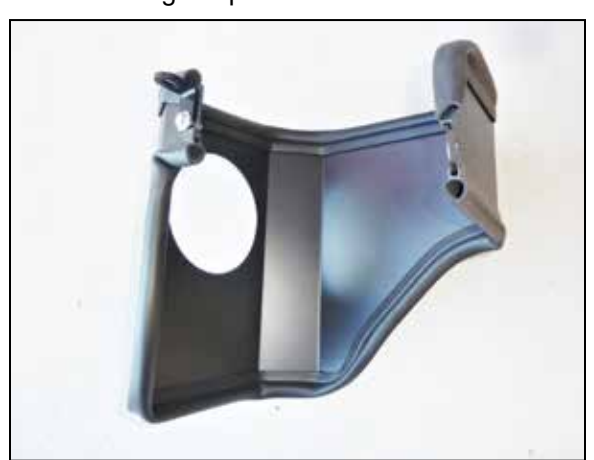
11. Install the edge trim onto the heat shield as shown, some trimming of the edge trim will be necessary.