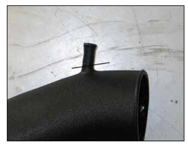
18. On 6.1L equipped models, cut the vent port off the K&N intake tube at the base.