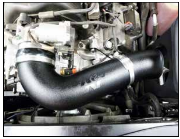
21. Install the intake tube into the coupler at the throttle body and saddle clamp, secure the tube with the provided hose clamps.