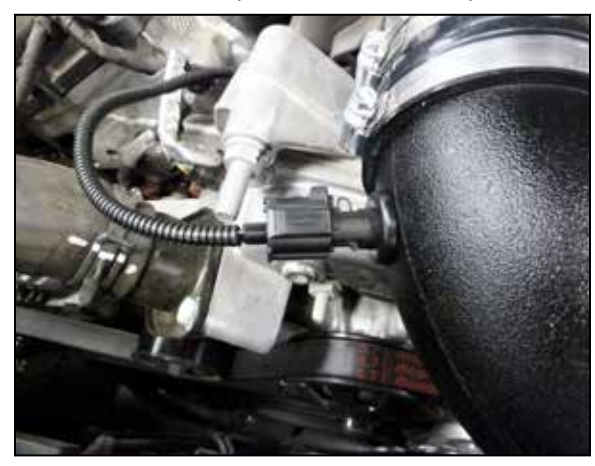
27. Reconnect the IAT sensor electrical connection.