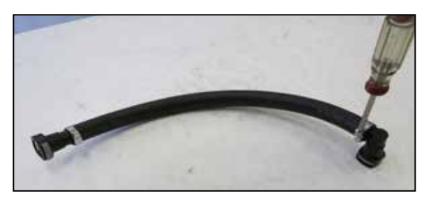
7. Assemble the provided CCV hose assembly using the hose, fittings, and clamps.