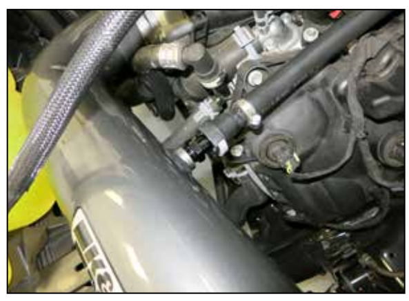
18. Connect the CCV hose to the quick connect fitting installed onto the intake tube.