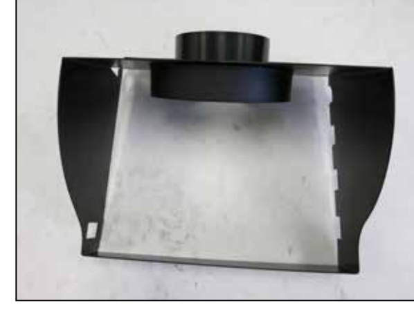
8. Install the provided filter adapter into the heat shield and secure with the provided hardware.