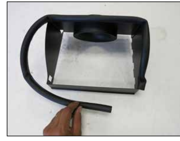
10. Install the bulb edge trim to the top of the heat shield as shown. Some trimming of the edge trim will be necessary.