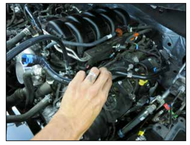
6. Disconnect the CCV line from valve cover.