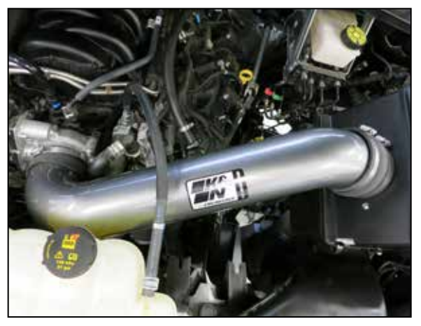
17. Install the Intake tube into the coupler at the throttle body and then into the coupler at the filter adapter, adjust the tube for best fit and secure with the provided hose clamps.

15. Install the provided hump hose onto the filter