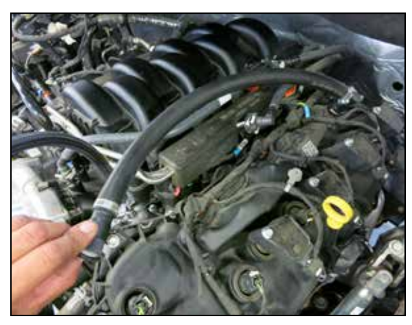
12. Install the CCV assembly onto the engine. NOTE: the 90deg fitting will be attached to the engine.