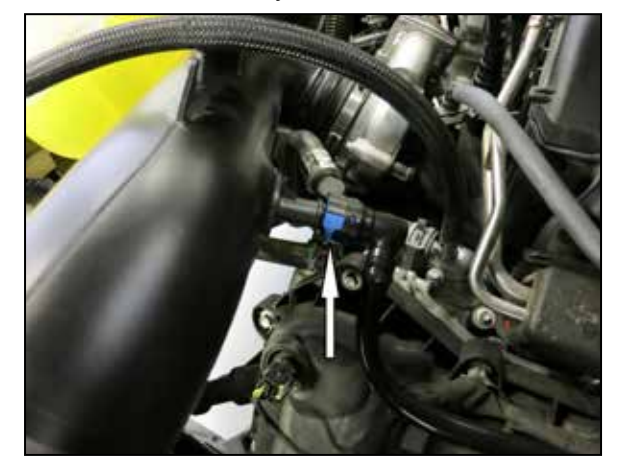
4. Disconnect the CCV from the factory intake tube.