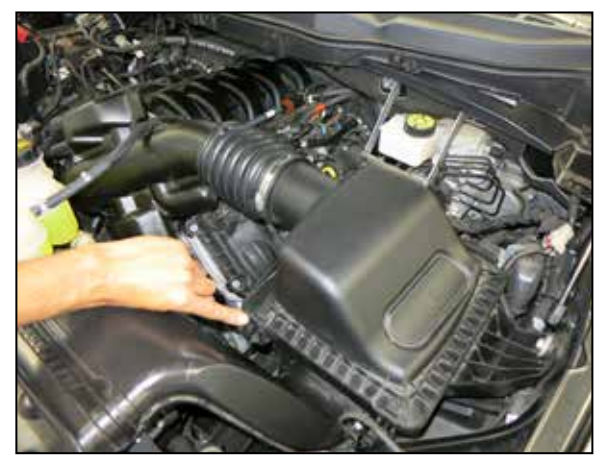
2. Release the two locking tabs that secure the upper air filter housing.