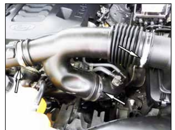
3. Loosen the three hose clamps that secure the factory intake tube and then remove the intake tube from the vehicle.