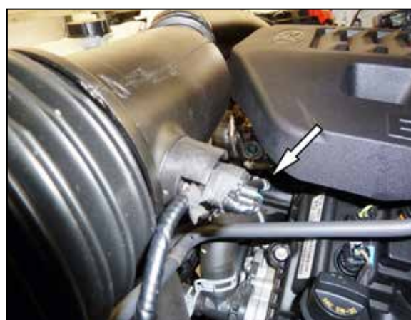
2. Disconnect the IAT sensor electrical connection.

1. Turn off the ignition and disconnect the negative battery cable. NOTE: Disconnecting the negative battery cable erases pre-programmed electronic memories. Write down all memory settings before disconnecting the negative battery cable. Some radios will require an anti-theft code to be entered after the battery is reconnected. The anti-theft code is typically supplied with your owner's manual. In the event your vehicles anti-theft code cannot be recovered, contact an authorized dealership to obtain your vehicles anti-theft code.