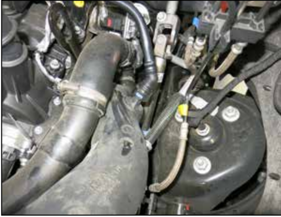
17. Reconnect the CCV hose connection.