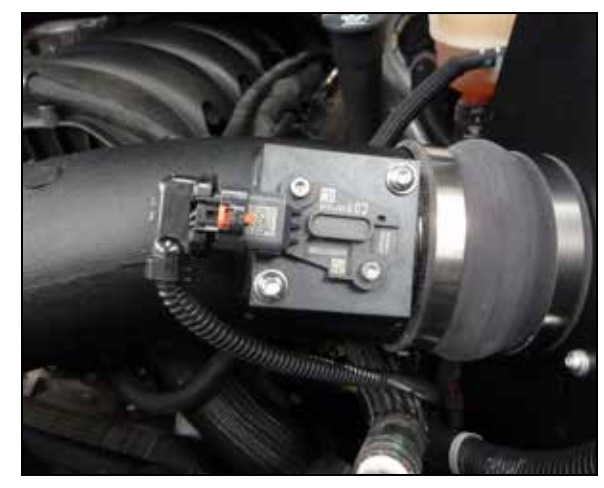
25. Connect the mass air sensor electrical connection.

24. Connect the crank case vent hose assembly to the valve cover port and then to the fitting installed into the intake tube.