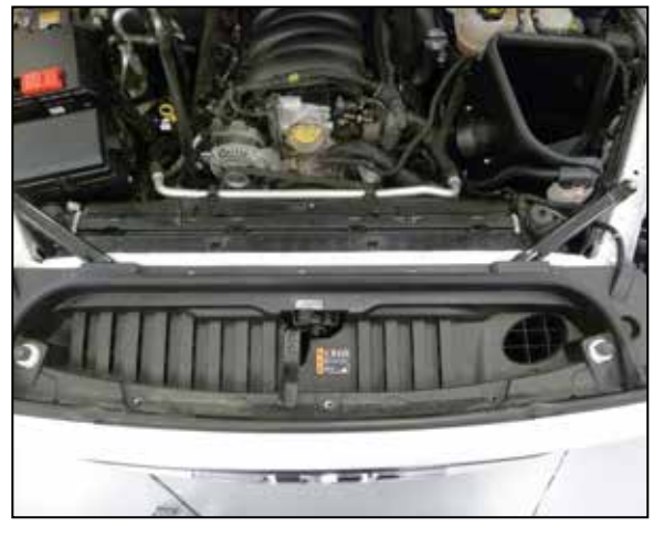
16. Reinstall the radiator valence and secure with the ten factory clips. Reinstall the hood release arm and secure with the factory hardware.