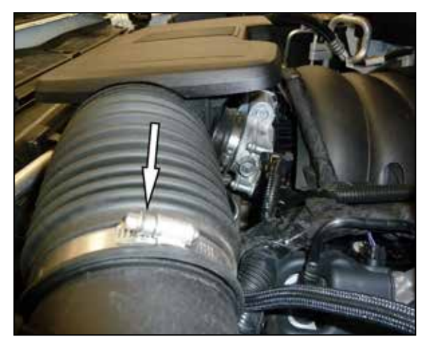
4. Loosen the hose clamps that secures the intake plenum to the air filter housing and to the throttle body. Disconnect the plenum connections at the air filter housing and then rotate the plenum counter clockwise to disengage the keyed mount and separate it from the throttle body. NOTE: The wiring harness anchored to the intake plenum will need to be detached before removing the plenum from the vehicle.