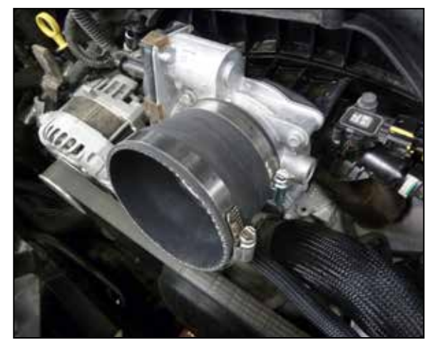
18. Install the provided reducer coupler onto the throttle body and secure with the provided hose clamp. NOTE: On 5.3L equipped vehicles use coupler #08497, on 6.2L vehicles use coupler #084107 .