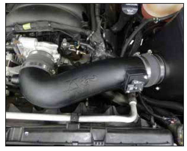
22. Install the intake tube into the coupler at the filter adapter and then into the coupler at the throttle body, adjust the tube for best fit and then secure with the provided hose clamps.