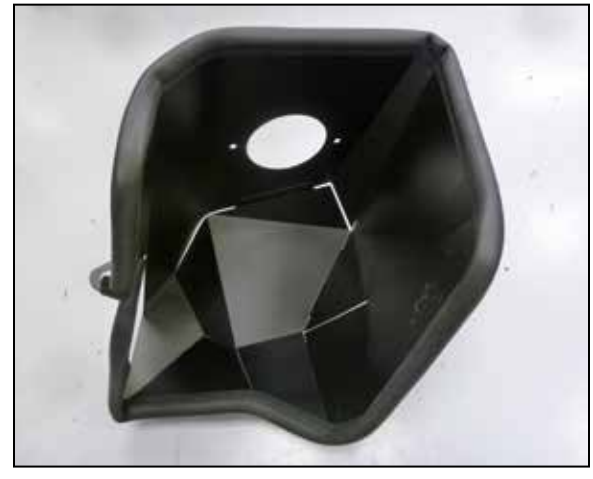
10. Install the provided edge trim onto the heat shield as shown. NOTE: Some trimming of the edge trim will be necessary.

9. Remove the nut that secures the air filter housing. Unhook the wiring harness from the filter housing and then remove the air filter housing from the vehicle. NOTE: Go slow and use caution to remove the housing. It is indexed into two holes in the rear with rubber grommets that can fall off easily and be lost. It is a tight fit but will come out without being forced. This nut will be reused in a later step.