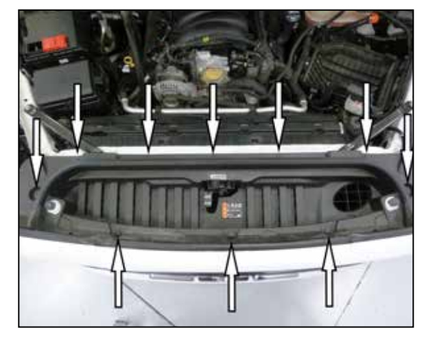
6. Release the ten retaining clips that secure the upper radiator valence and then remove the valence from the vehicle.

5. Remove the two bolts that secure the hood release arm to the hood latch and then remove the arm.