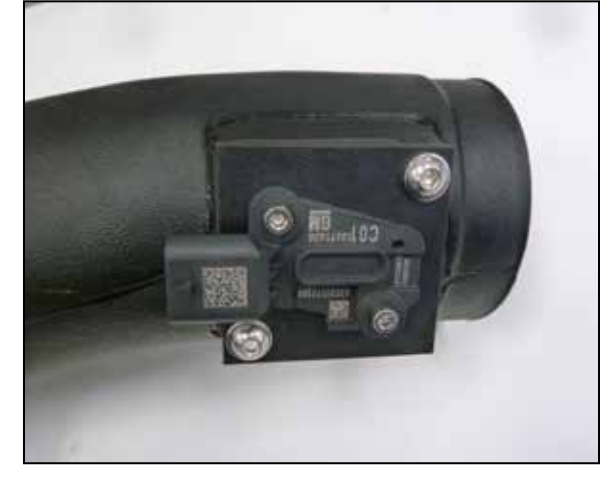
21. Install the mass air sensor into the K&N intake tube and secure with the provided hardware.