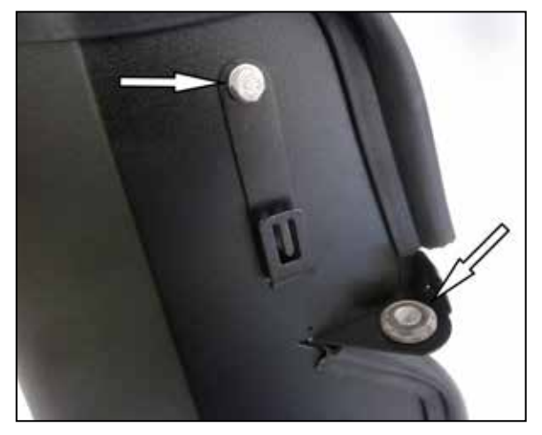
12. Install the provided wiring connector mounting bracket onto the heat shield using the provided hardware. Remove the factory mounting grommet and sleeve from the factory air filter housing and install it into the K&N heat shield as shown.