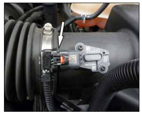
2. Disconnect the mass air sensor electrical connection.

NOTE: Disconnecting the negative battery cable erases pre-programmed electronic memories. Write down all memory settings before disconnecting the negative battery cable. Some radios will require an anti-theft code to be entered after the battery is reconnected. The anti-theft code is typically supplied with your owner's manual. In the event your vehicles anti-theft code cannot be recovered, contact an authorized dealership to obtain your vehicles anti-theft code.