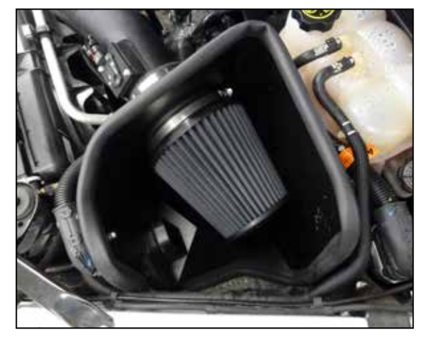
26. Install the K&N air filter onto the adapter and secure with the provided hose clamp.