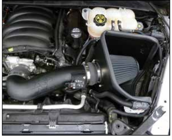
27. Reconnect the vehicle's negative battery cable. Double check to make sure everything is tight and properly positioned before starting the vehicle.

28. It will be necessary for all K&N<sup>®</sup> high flow intake systems to be checked periodically for realignment, clearance and tightening of all connections. Failure to follow the above instructions or proper maintenance may void warranty.