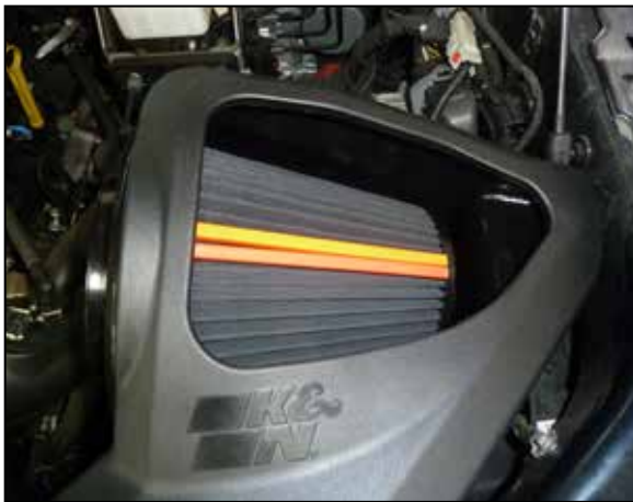
12. Install the K&N air filter into the filter housing until it locks into place.