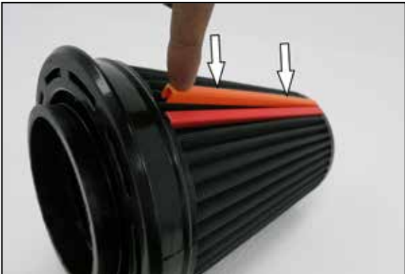
11. Attach the filter clips to the pleats on the air filter align and push down. Driver side filter, place orange clip on top and red on bottom.