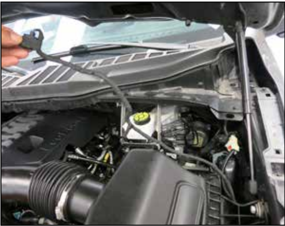
4. Disconnect the IAT sensor electrical connection from the factory tube. Unhook the wiring harness from its mounts.