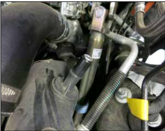
10. Once the insert is slid completely into the fitting reconnect the CCV connection.