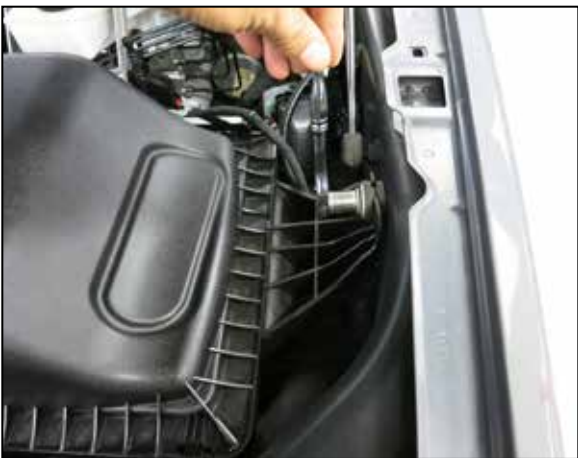
6. Remove the bolt that secures the factory air filter housing to the inner fender and then remove the air filter housing from the vehicle. This bolt will be reused in the next step.