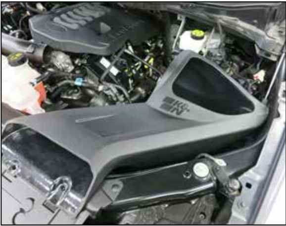
7. Install the K&N air filter housing into the grommets and secure to the inner fender using the mounting bolt from the previous step. Secure the front scoop using provided push clips.