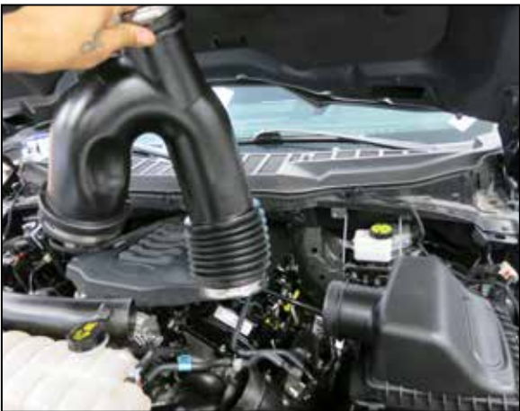
5. Remove the factory intake tube from the vehicle.