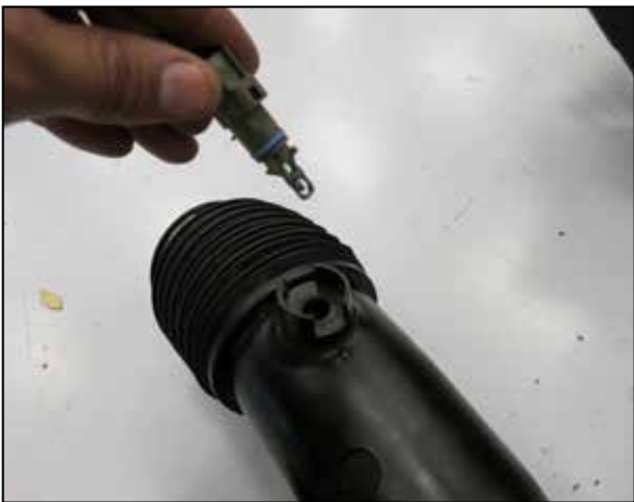
13. Remove the IAT sensor from the factory intake tube.