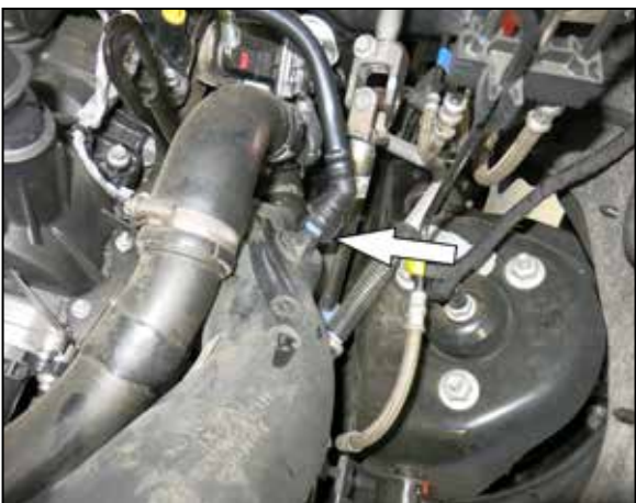
8. On 2021 and earlier 3.5L Ecoboost vehicles, Disconnect the CCV connection shown on the drivers side turbo inlet tube. On later 2022 and later model vehicles skip to step #11.