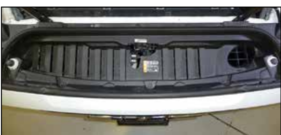
25. Reinstall the radiator valence and secure with the ten factory clips.