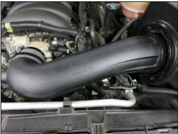
21. Install the intake tube to vehicle and position to air filter and hose on throttle body.