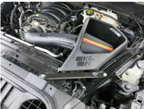
27. Reconnect the vehicle's negative battery cable. Double check to make sure everything is tight and properly positioned before starting the vehicle.

28. K&N AIR FILTER MONITOR LIGHT: Some vehicles are equipped with a "Air Filter Monitor" system that will send a message to the instrument cluster indicating that the air filter needs to be replaced. This system is calibrated for the OEM intake system and air filter and will not be accurate when K&N products are in use. Always refer to WWW.KNFILTERS.COM for K&N air filter service procedures. The "Air Filter Monitor" system must be disabled to prevent the monitor from setting on and causing a factory dealership visit to rest the system. Follow the "Air Filter Monitor" system procedure listed in the factory owners manual.