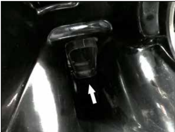
17. Make sure the mount is seated in OEM hole location. Install the oem fresh air intake duct into the K&N airbox.