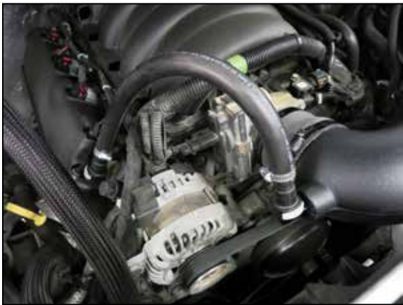
23. Install the crank case hose to the engine and intake tube, make sure you hear the click on the PCV connector.