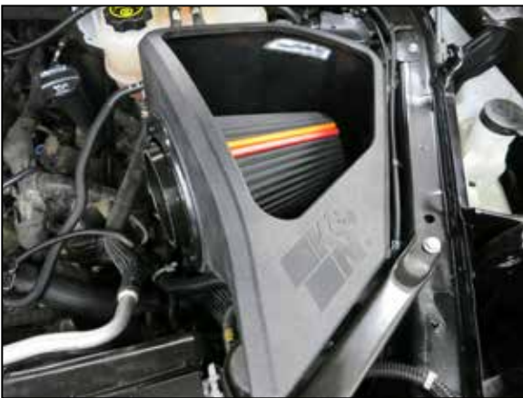
19. Install the air filter into the K&N airbox.