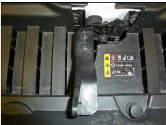
26. Reinstall the hood release arm and secure with the factory hardware.