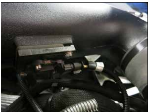
24. Connect the MAF sensor using provided harness extension, and secure harness using cable tie.