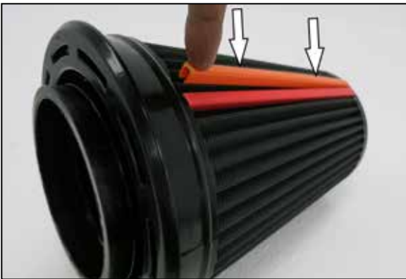
18. Attach the filter clips to the pleats on the air filter align and push down. Driver side filter, place orange clip on top and red on bottom.