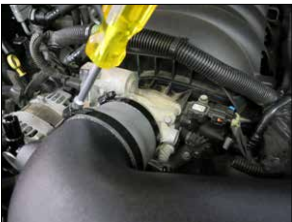
22. Adjust for proper fit, and tighten all clamps.