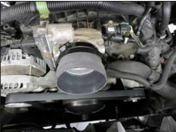
20. Install the 08497 hose to the throttle body with clamps provided for 5.3L models. Install the 084107 hose for the 6.2L models. Tighten clamps using 5/16" socket or nut driver. Note: Do not over tighten clamps.