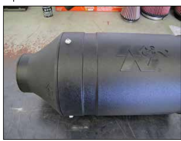
6. Install the canister lid onto the canister and secure with the provided hardware.