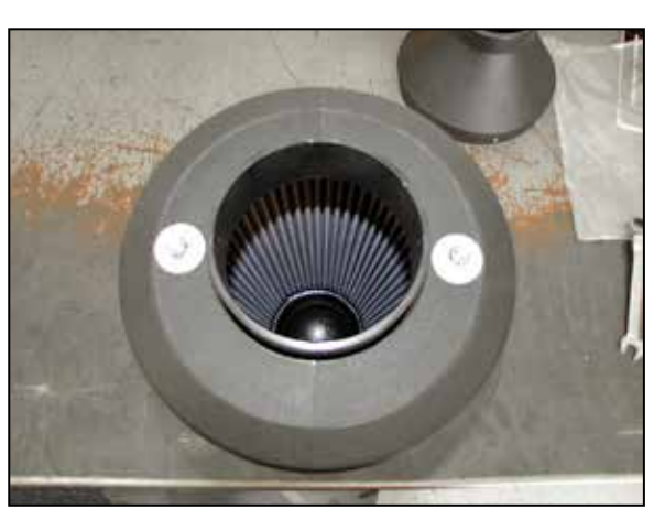
5. Secure the filter assembly to the canister with the provided fender washers and nuts.