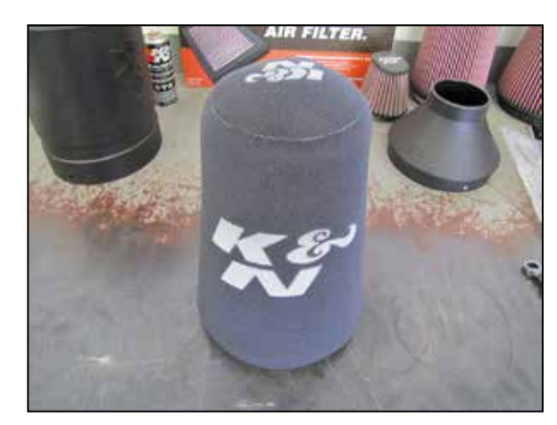
1. Install the Extreme Duty Foam Wrap onto the filter.