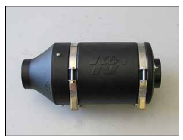
8. Your UNIVERSAL OFF ROAD AIR FILTER is ready to be installed.