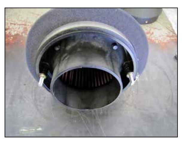
3. Install the two provided 6mm studs into the radius filter adapter as shown.