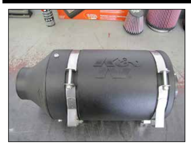
7. Install the saddle clamps onto the canister and secure with the provided hardware.