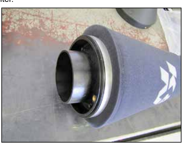
2. Install the radius filter adapter into the air filter and secure with the provided hose clamp.