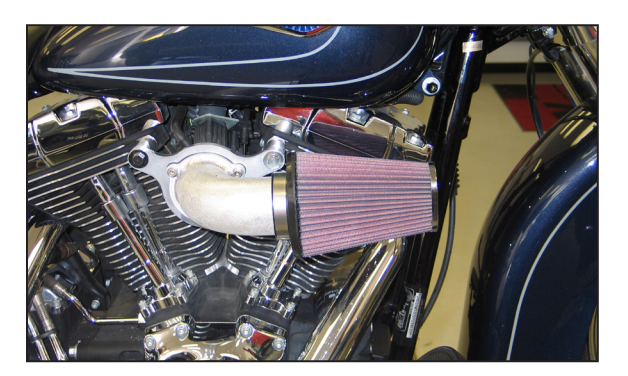
13. Install the K&N<sup>®</sup> air filter onto the intake tube and secure with the provided hose clamp. A black hose clamp is being supplied with kit. This clamp is intended to clamp the filter to the intake tube.

12. Install the K&N<sup>®</sup> intake tube with the gasket and secure with the provided hardware. NOTE: Apply one drop of the provided thread locker onto the provided bolts.