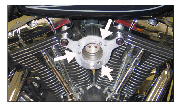
11. Install the provided gasket between the throttle body and back plate and then secure the back plate to the throttle body with the hardware provided. Tighten the crankcase breather bolts. NOTE: Apply one drop of the provided thread locker onto the provided bolts.