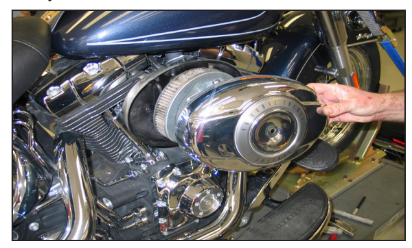
2. Remove the air filter cover retaining bolt and then remove the air filter cover as shown.

1. Turn off the ignition and disconnect the negative battery cable.