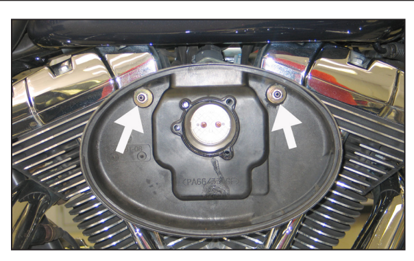
5. Remove the two crankcase breather bolts shown.