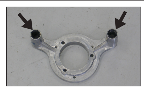
8. Install two of the o rings provided onto the back side of the K&N ^{\mbox{\tiny (8)}} back plate as shown.