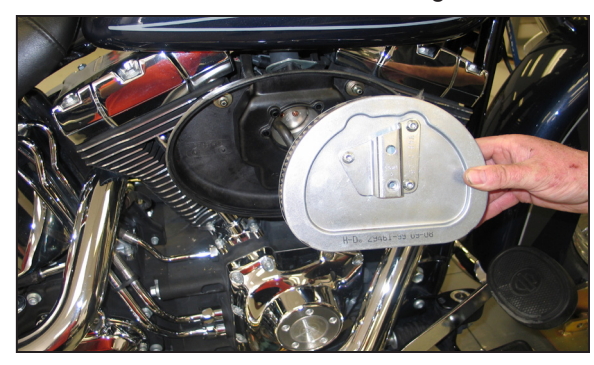
4. Remove the air filter with the breather hoses as shown.

3. Remove the three air filter retaining bolts shown.