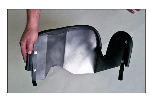
7. Using the provided hardware install the two brackets onto the heat shield as shown.