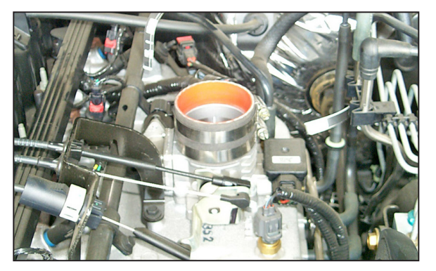
10. Install the provided silicone hose and hose clamps onto the throttle body as shown.