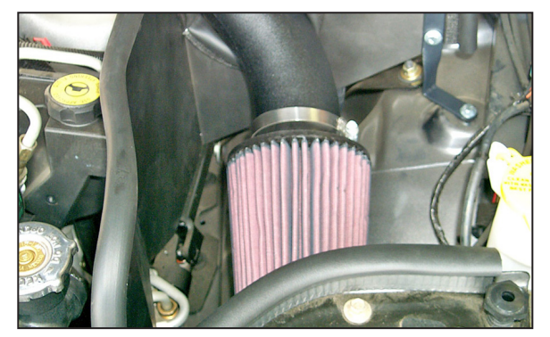
13. Install the K&N<sup>®</sup> Air Filter onto the K&N<sup>®</sup> intake tube and secure with the provided hose clamp. NOTE: Drycharger<sup>®</sup> air filter wrap; part # RC-4700DK is available to purchase separately. To learn more about Drycharger<sup>®</sup> filter wraps or look up color availability please visit http://www.knfilters.com<sup>®</sup>.

12. Connect the provided hose to the vent on the valve cover, then, connect the other end to the vent on the K&N<sup>®</sup> intake tube as shown.