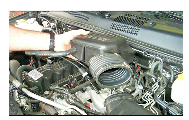
4. Loosen the hose clamp at the air cleaner lid and at the throttle body, then, remove the resonator and bellows assembly as shown.