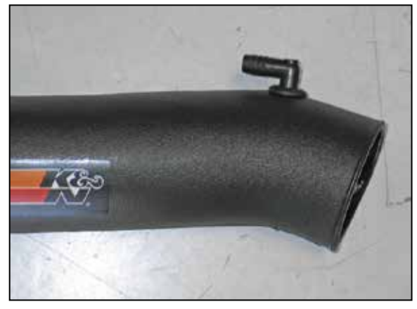
16d. On SRT 8; 6.1L equipped vehicles, install the provided 90° hose mender as shown.