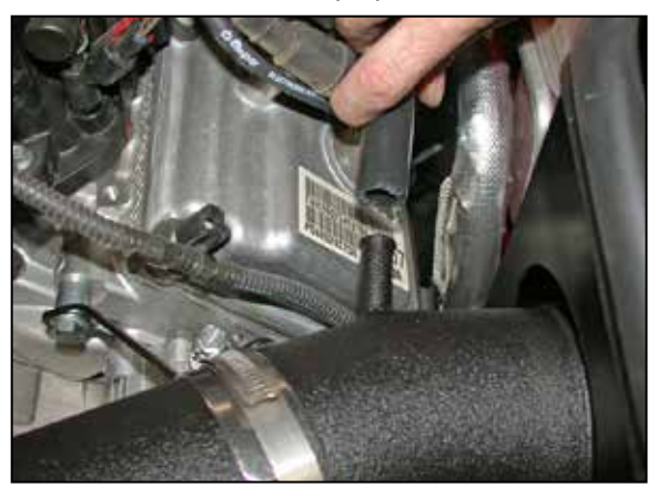
19. Install the provided crank case vent hose onto the vent port on the valve cover then install the vent hose onto the K\&N^{\mbox{\ensuremath{\$}}} intake tube.

18. Install the K&N<sup>®</sup> intake tube into the throttle body and onto the saddle clamp as shown, then secure with the hose clamps provided.