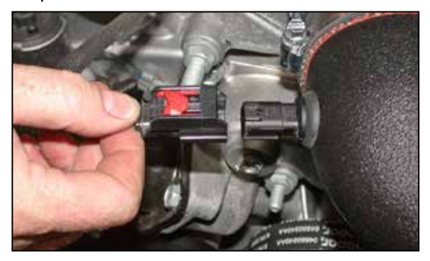
23. Reconnect the air temperature sensor electrical connection as shown.

22. Install the air filter assembly onto the K&N<sup>®</sup> intake tube and secure with the provided hose clamp as shown.