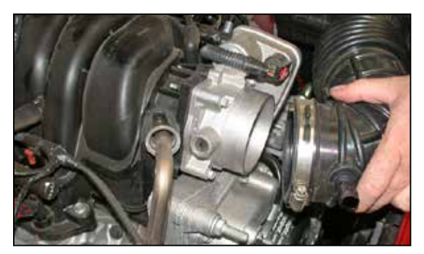
4. Loosen the hose clamp that secures the intake tube to the throttle body and pull the intake tube off of the throttle body.