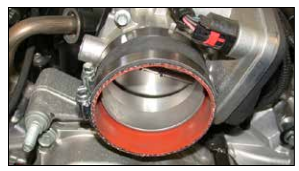
14. Install the silicone hose (08630) onto the throttle body and secure with the provided hose clamp as shown.

13. Using the provided spacer, install the tube mounting bracket assembly onto the engine as shown.