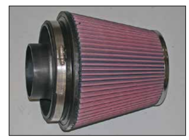
20. Install the filter adapter into the air filter and secure with the provided hose clamp.