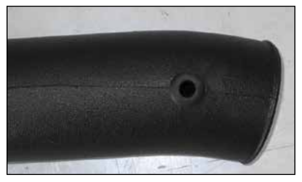
16c. On SRT 8; 6.1L equipped vehicles, install the provided grommet into the 0.75" ID hole as shown.

16b. Drill out the hole in the intake tube to 0.75".