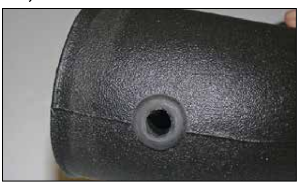
16. Install the provided grommet into the K\&N^{\circledast} intake tube as shown.

15. Remove the air temperature sensor from the factory intake tube.