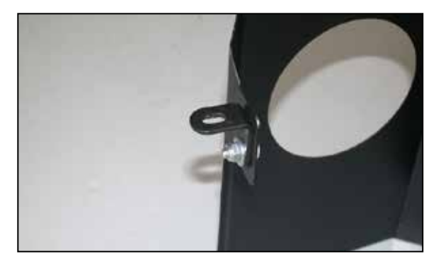
9. Install the "L" bracket (070066A) onto the heat shield with the provided hardware through the non-slotted hole in the bracket.