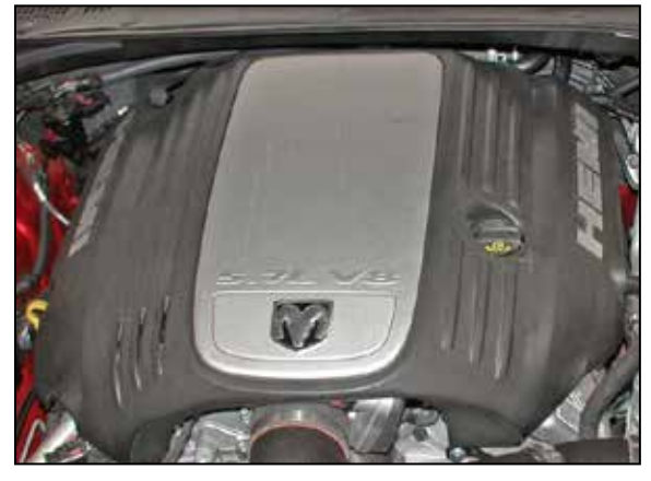
24. Reinstall the engine cover removed in step #2.