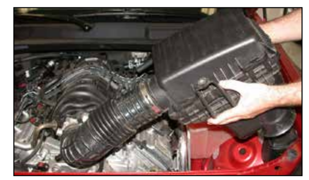
6. Loosen and remove the air box mounting bolt as shown.

2. Lift up on the engine cover to loosen it from the mounts, and then remove the cover from the vehicle.