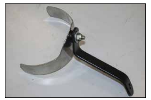
12. Assemble the tube mounting bracket and saddle clamp as shown with the provided hardware.

11a. Due to vehicle manufacturing tolerances, the A/C lines on some vehicles may need to repositioned slightly so that they do not contact the heat shield. To adjust, grab the A/C line on the aluminum section and carefully apply pressure in the desired direction until clearance is obtained.