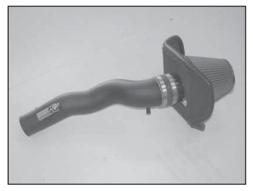
16. Install the air filter assembly onto the K&N<sup>®</sup> intake tube as shown.