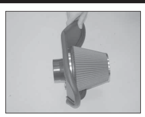
11. Install the K&N® air filter onto the filter adapter as shown.