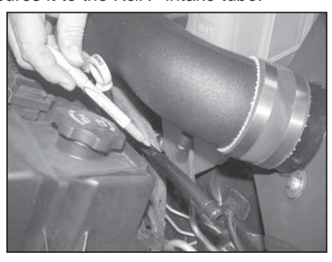
19. Mark the crank case vent tube approximately 1" back from the vent port on the K&N® intake tube as shown.