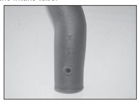
14. Install the grommet provide into the intake tube as shown.