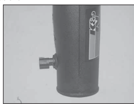
15. Install the air temperature sensor into the grommet installed in step #14.