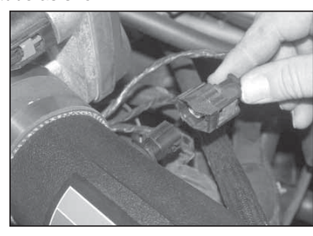
23. Reconnect the air temperature electrical connection as shown.