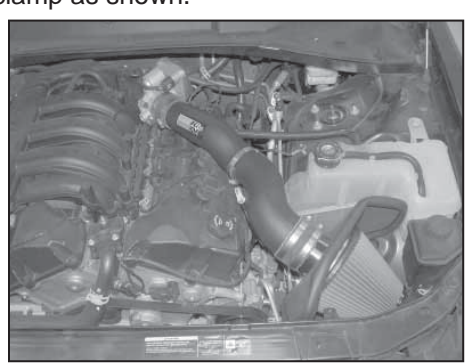
18. Install the K&N® intake assembly into the silicone hose at the throttle body and onto the saddle clamp as shown, then secure with the provided hose clamps. Adjust the air filter assembly for best clearance and tighten the hose clamp, which secures it to the K&N® intake tube.