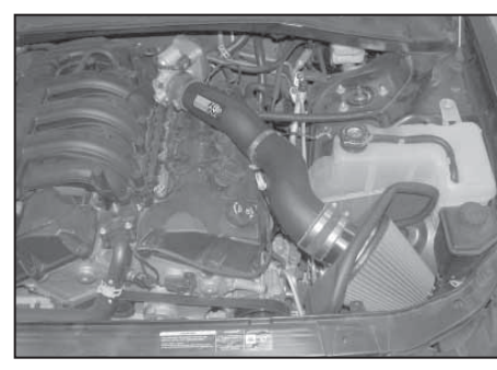
24. Reconnect the vehicle's negative battery cable. Double check to make sure everything is tight and properly positioned before starting the vehicle.