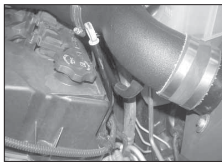
22. Reinstall the crank case vent tube onto the valve cover and then connect to the K&N<sup>®</sup> intake tube as shown.