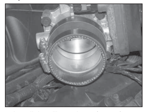
17. Install the silicone hose (08756) onto the throttle body and secure with the provided hose clamp as shown.