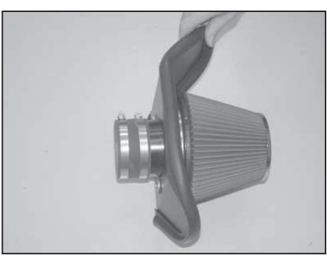
12. Install the silicone hose (08630) onto the filter adapter and secure with the provided hose clamp as shown.