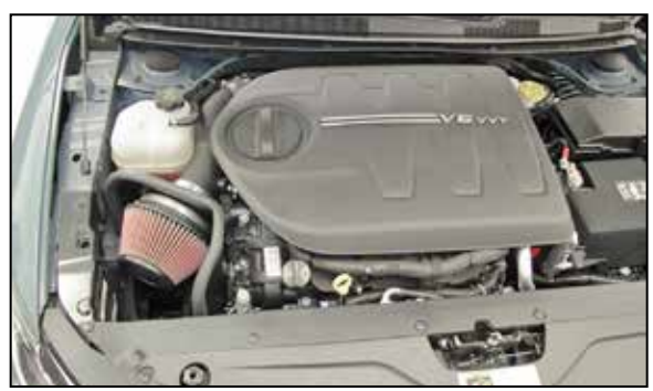
20. Reconnect the vehicle's negative battery cable. Double check to make sure everything is tight and properly positioned before starting the vehicle.

21. The C.A.R.B. exemption sticker, (attached), must be visible under the hood so that an emissions inspector can see it when the vehicle is required to be tested for emissions. California requires testing every two years, other states may vary.