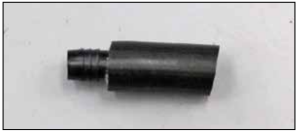
14. Install the provided hose mender into the section of crank case vent hose provided.