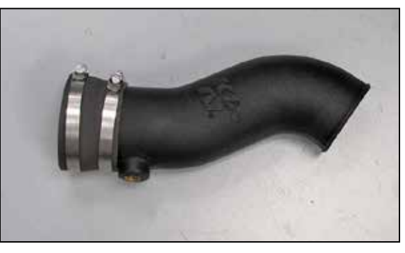
12. Install the provided coupler hose (084091) onto the K&N ^{\odot} intake tube fully but do not tighten at this time.