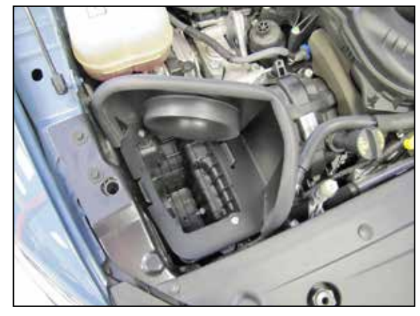
10. Install the heat shield assembly so that the mounting studs engage with the factory mounting grommets.

NOTE: Some trimming of the edge trim will be necessary.