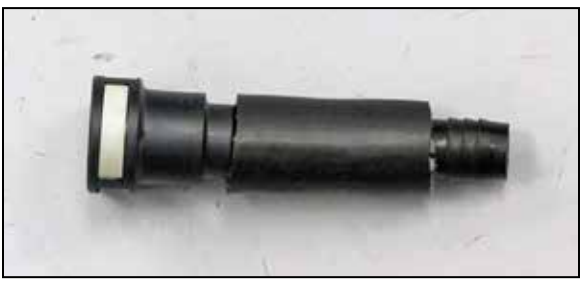
15. Remove the factory quick disconnect fitting from the factory crank case vent hose and install it into the provided vent hose as shown.