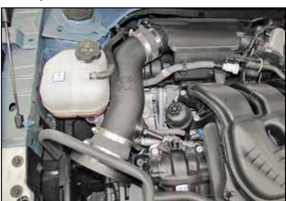
16. Install the K&N<sup>®</sup> intake tube into the coupling