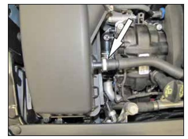
4. Depress the locking tab and then disconnect the crank case vent hose assembly from the air filter housing.

5. Separate the factory intake tube from the intake plenum and then lift up the complete upper air filter housing to dislodge it from the mounting grommets and remove it from the vehicle.