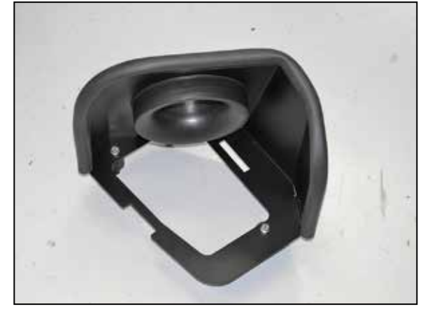
9. Install the provided edge trim onto the heat shield as shown.

NOTE: Some trimming of the edge trim will be necessary.