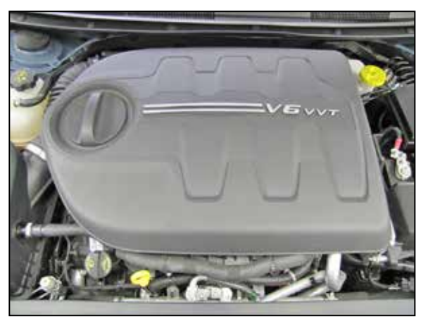
2. Lift off the decorative engine cover.