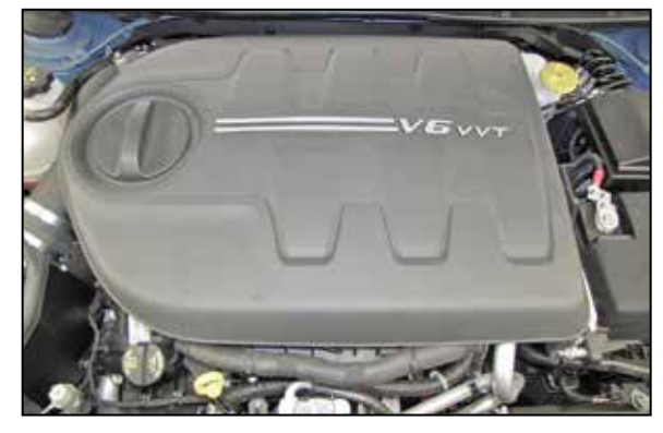
19. Reinstall the decorative engine cover.

18. Install the K&N ^{\odot} air filter onto the filter adapter and secure with the provided hose clamp.