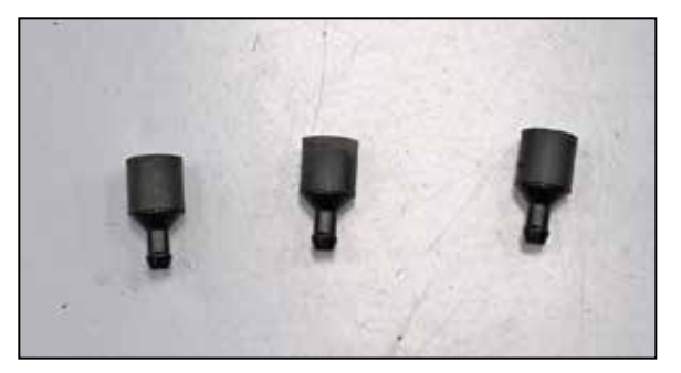
7. Install the three provided heat shield mounting studs onto the rubber mounted studs as shown.