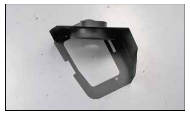
6. Install the provided air filter adapter into the heat shield and secure with the provided hardware.

NOTE: K&N Engineering, Inc., recommends that customers do not discard factory air intake.