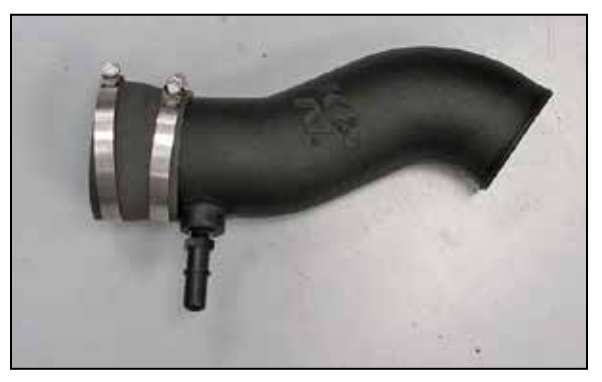
13. Install the provided quick disconnect npt fitting into the K&N<sup>®</sup> intake tube as shown. NOTE: Plastic NPT fittings are easy to cross thread. Install the vent fitting "hand" tight, then turn it two complete turns with a wrench.