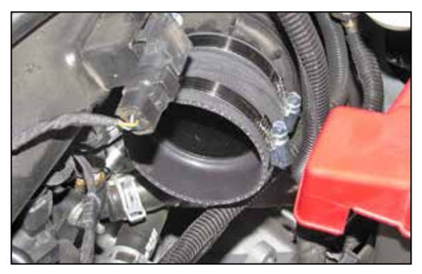
8. Install one of the hump hoses (087121) onto the turbo inlet and secure with the provided hose clamp.