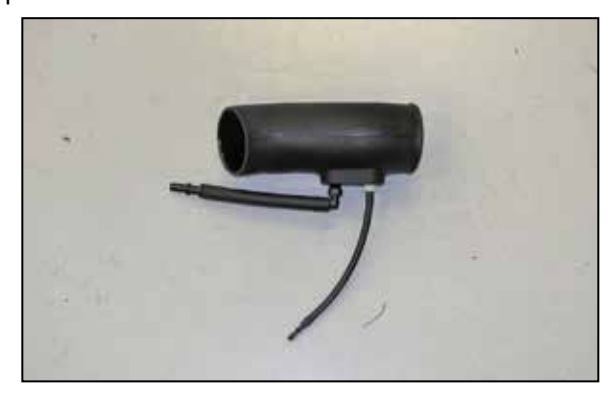
11. Install the vent hose assemblies onto the fittings installed into the K&N ^{\odot} intake tube.