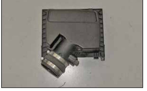
16. Install the remaining hump hose (087121) onto the factory air box as shown and secure with the provided hose clamp.