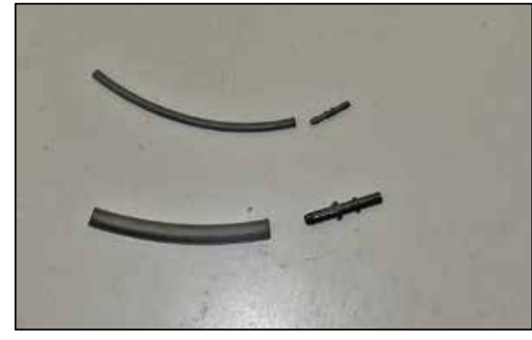
10. Install the provided union fittings into the provided vent hoses as shown.

NOTE: Plastic NPT fittings are easy to cross thread. Install the vent fitting "hand" tight, then turn it two complete turns with a wrench.