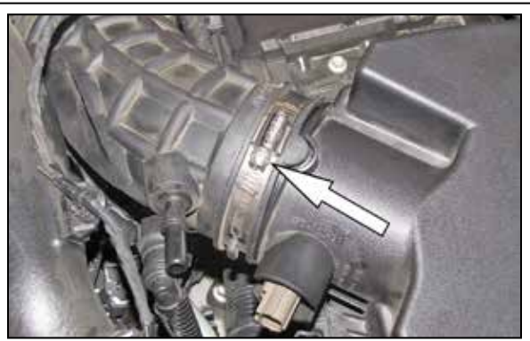
4. Loosen the hose clamp securing the intake tube to the air filter housing.