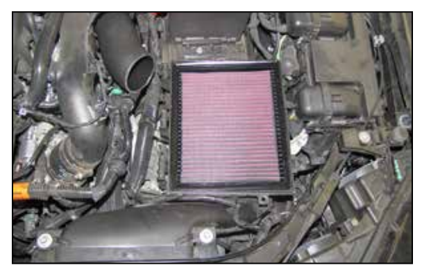
15. Install the K&N® air filter.

14. Connect the factory crank case vent hose to the quick connect fitting/vent hose installed into the K&N<sup>®</sup> intake tube.