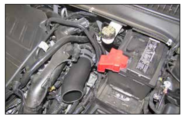
13. Install the K&N<sup>®</sup> intake tube into the coupling hose at the turbo but do not tighten at this time.

12. Set the intake tube in and then connect the solenoid vent hose to the hose installed onto the K&N<sup>®</sup> intake tube.