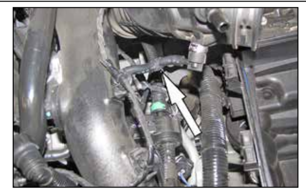
6. Disconnect the solenoid vent hose from the fitting installed into the factory intake tube.