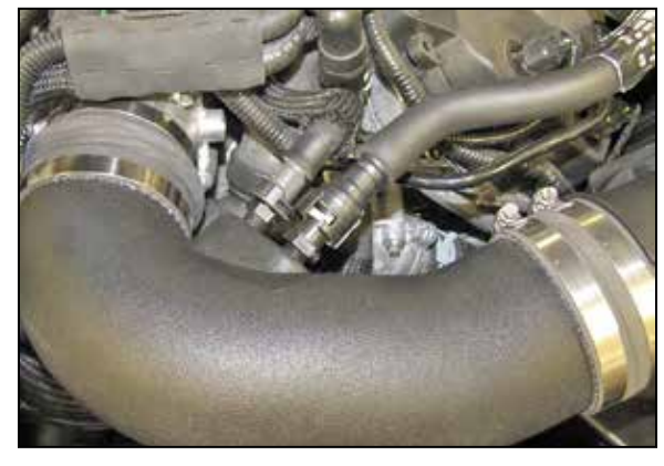
17. Connect the crank case vent and EVAP vent lines to the quick disconnect fittings installed into the K&N® intake tube as shown.