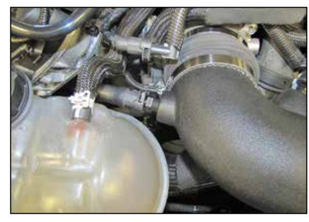
18. Connect the idle by-pass vent line to the quick disconnect fitting installed into the K&N® intake tube as shown.