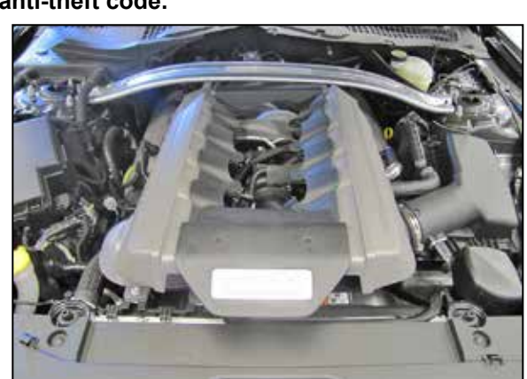
2. Lift up the engine cover to unhook it from its mounts, slide the engine cover from under the strut tower brace and remove it from the vehicle.

NOTE: Disconnecting the negative battery cable erases pre-programmed electronic memories. Write down all memory settings before disconnecting the negative battery cable. Some radios will require an anti-theft code to be entered after the battery is reconnected. The anti-theft code is typically supplied with your owner's manual. In the event your vehicles anti-theft code cannot be recovered, contact an authorized dealership to obtain your vehicles anti-theft code.