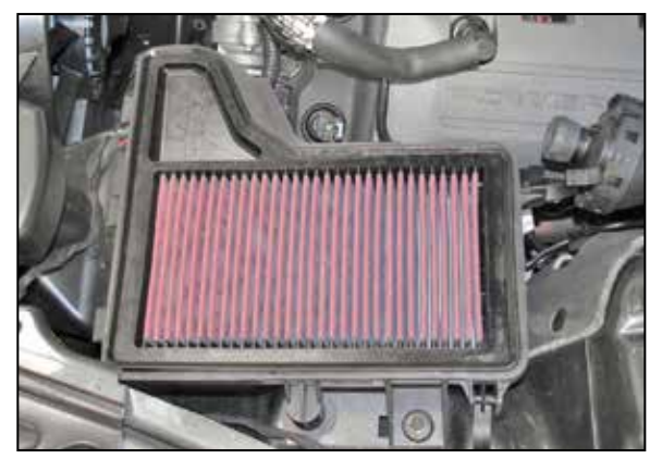
10. Install the K&N® air filter into the lower air filter housing.