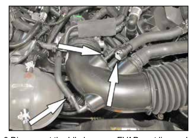
3.Disconnect the Idle by-pass, EVAP vent line and the crank case vent line from the factory intake tube.

NOTE: Some vehicles are not equipped with the EVAP vent hose.