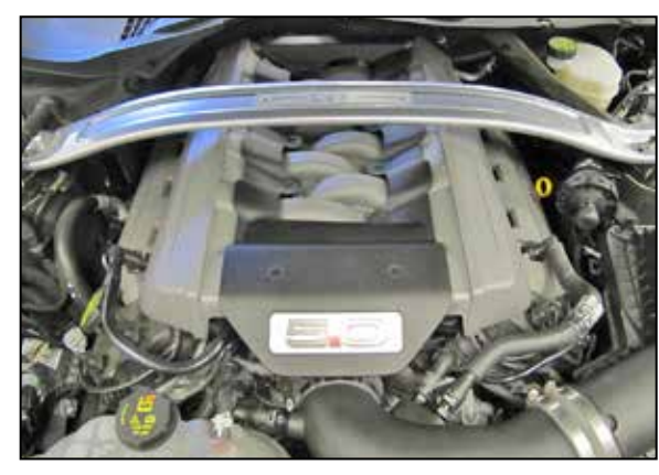
19. Reinstall the Engine cover onto its mounting studs.