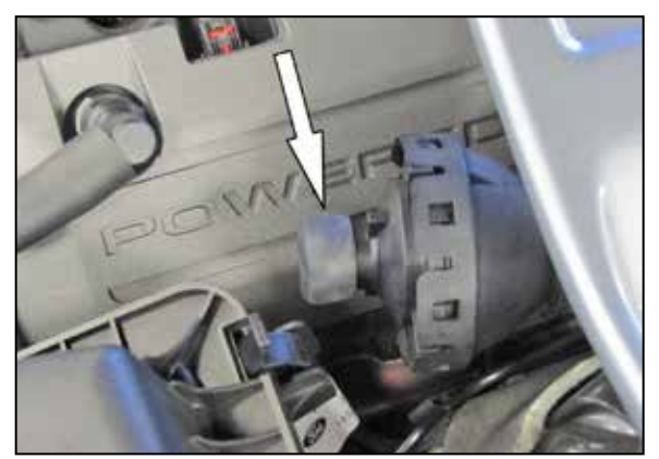
6. Install the provided cap onto the sound drum as shown.