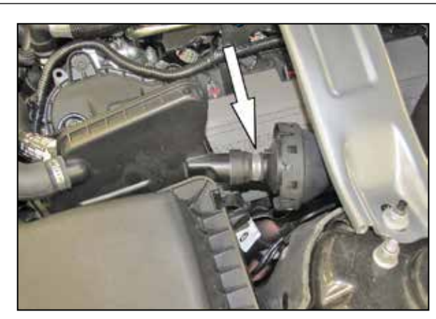
5. Cut the clamp securing the sound tube to the sound drum and then disconnect the sound tube.