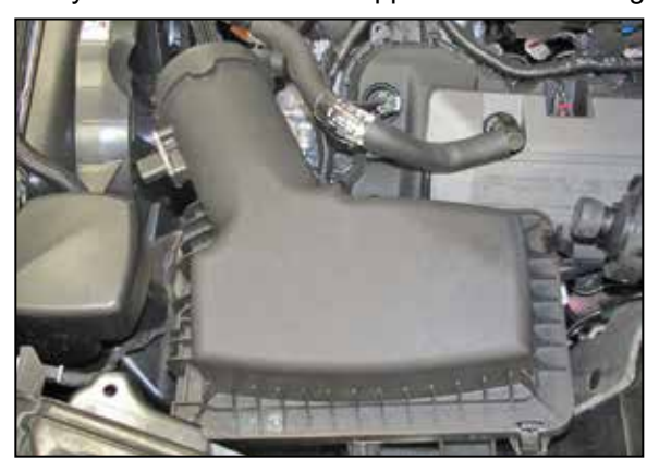
12. Reinstall the upper air filter housing onto the lower housing and secure with the factory retaining clips.