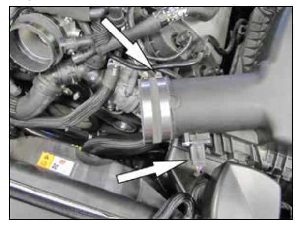
14. Install the provided coupling hose (08760) onto the air filter housing and secure with the provided hose clamp then reconnect the mass air sensor electrical connection.