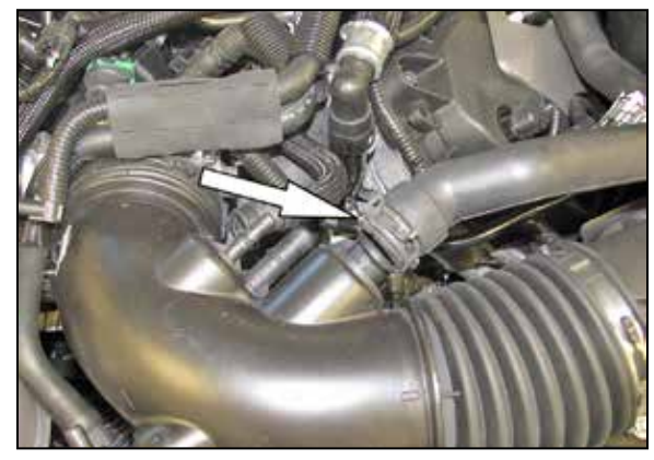
4. Using pliers, squeeze the spring clamp securing the sound tube to the factory intake tube and disconnect the sound tube.

NOTE: Some vehicles are not equipped with the EVAP vent hose.