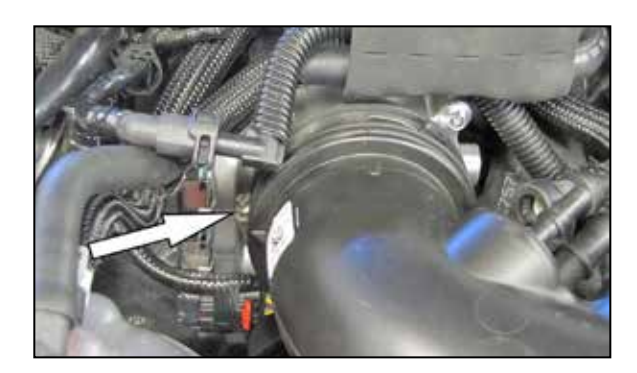
7. Loosen the hose clamp securing the intake tube to the throttle body.