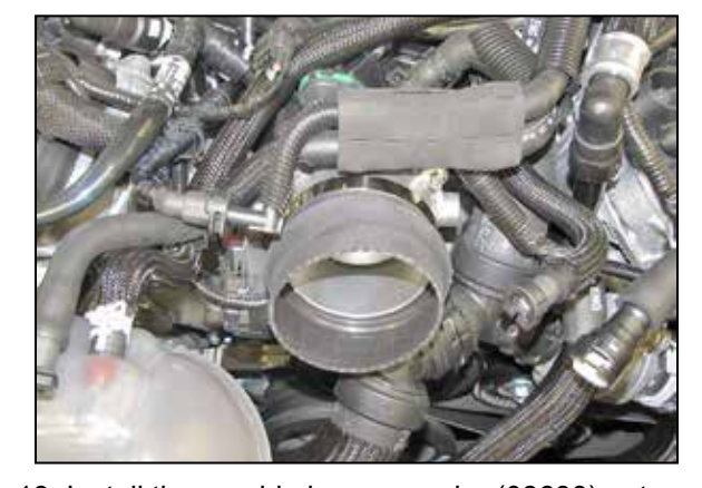
13. Install the provide hump coupler (08699) onto the throttle body and secure with the provided hose