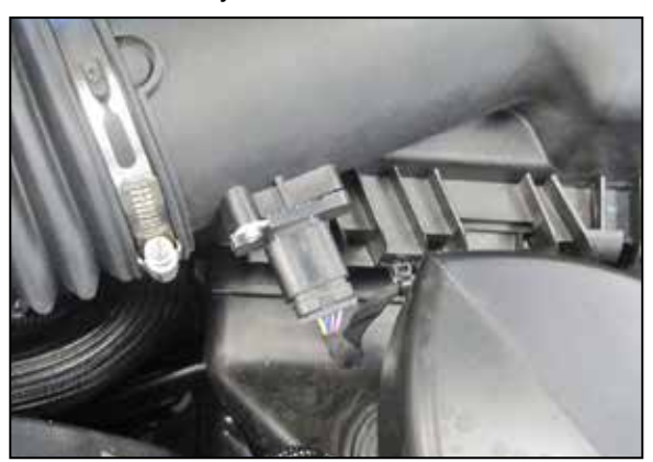
8. Release the red locking tap on the underside of the MAF electrical connector and then disconnect the MAF electrical connection.