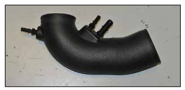
15. Install the three quick disconnect fittings into the K&N® intake tube as shown.

NOTE: On vehicles not eqquipped with an EVAP line, install the provided NPT plug #08032 onto the K&N® intake tube.