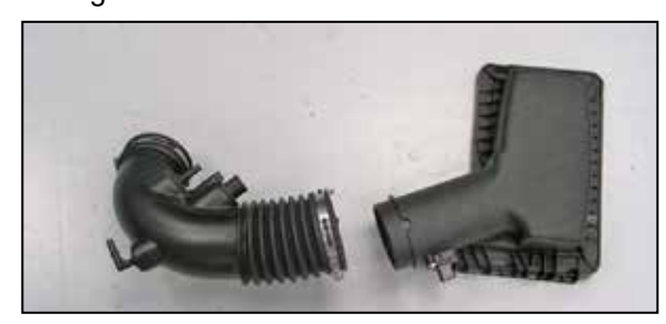
11. Loosen the hose clamp and then remove the factory intake tube from the upper air filter housing