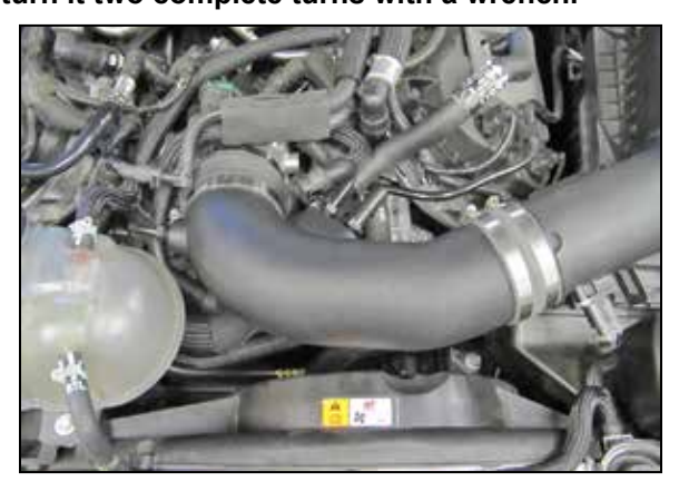
16. Install the K&N® intake tube into the hump hose at the throttle body and then into the coupling hose on the upper air box housing. Secure the hoses with the provided hose clamps

NOTE: Plastic NPT fittings are easy to cross thread. Install the vent fitting "hand" tight, then turn it two complete turns with a wrench.