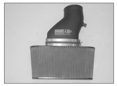
15. Install the K&N intake tube onto the filter charger as shown.