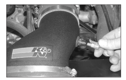
19. Reconnect the air temp sensor electrical connection.