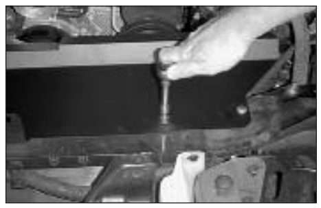
9. Secure the heat shield to the radiator core support using the bolts removed in step #6.

8. Install the rubber cushion onto the heat shield as shown.