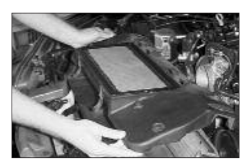
6. Loosen and remove the four bolts that retain the air box base to the radiator core support, then remove the lower air box assembly.