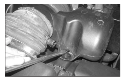
3. Pry up on the two tabs to release the clip that retains the resonator to the radiator cover.