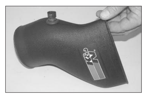
13. Install the temp sensor into the K&N intake tube as shown.