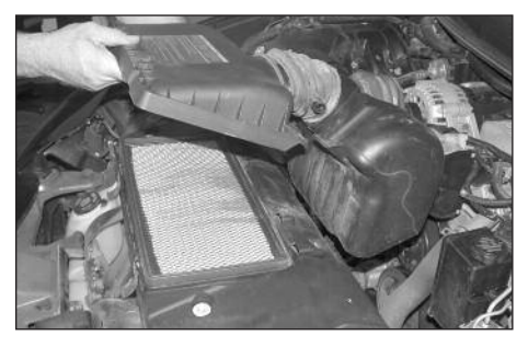
5. Remove intake from throttle body, then remove the entire upper air intake assembly.

4. Release the two clips that retain the air box top to the air box base.