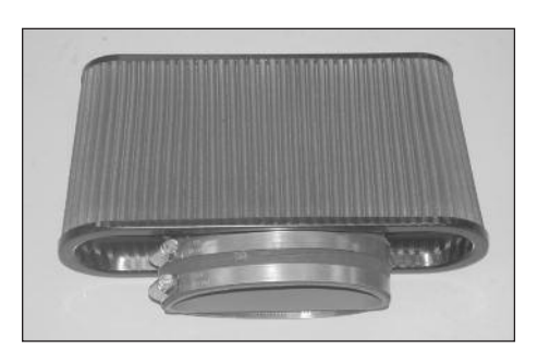
14. Attach the oval silicone hose (08541) onto the filter as shown.