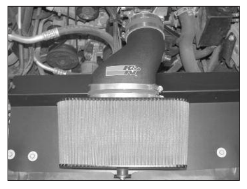
17. Install the K&N intake assembly onto the heat shield and throttle body.

16. Install the rubber mounted stud into the threaded hole on the top plate of the filter.