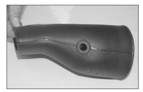
11. Install the grommet into the K&N intake tube as shown.

10. Install the provided silicone hose (08621) onto the throttle body with the provided hose clamps.