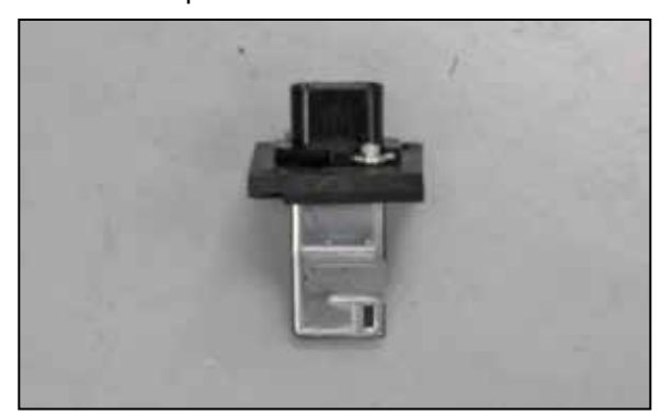
10. Install the mass air sensor into the adapter and secure with the provided hardware.