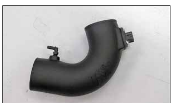
12. Install the 90° vent fitting into the K&N® intake tube as shown.

NOTE: Plastic NPT fittings are easy to cross thread. Install the vent fitting "hand" tight, then turn it two complete turns with a wrench.