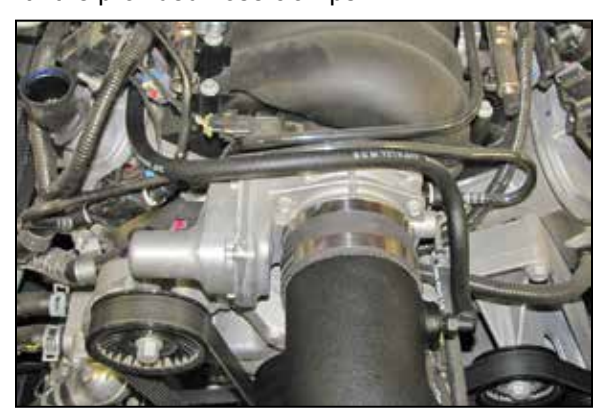
18. Connect the provided crank case vent hose to the fitting in the K&N® intake tube and then onto the valve cover port.

NOTE: On 2014 and later model vehicles, see the next step for crank case vent hose to engine connection.