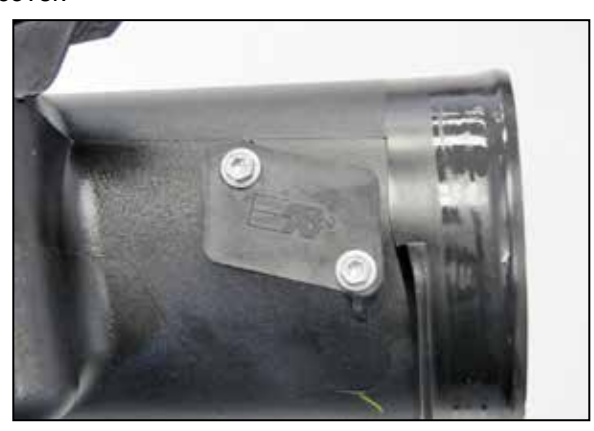
8. Using the factory screws from the previous step, install the mass air sensor block off plate and gasket.