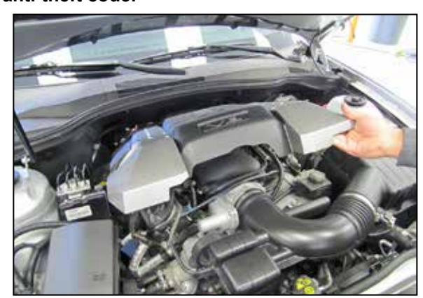
2. Remove the oil cap and then lift off the engine cover. Reinstall the oil cap.

NOTE: Disconnecting the negative battery cable erases pre-programmed electronic memories. Write down all memory settings before disconnecting the negative battery cable. Some radios will require an anti-theft code to be entered after the battery is reconnected. The anti-theft code is typically supplied with your owner's manual. In the event your vehicles anti-theft code cannot be recovered, contact an authorized dealership to obtain your vehicles anti-theft code.