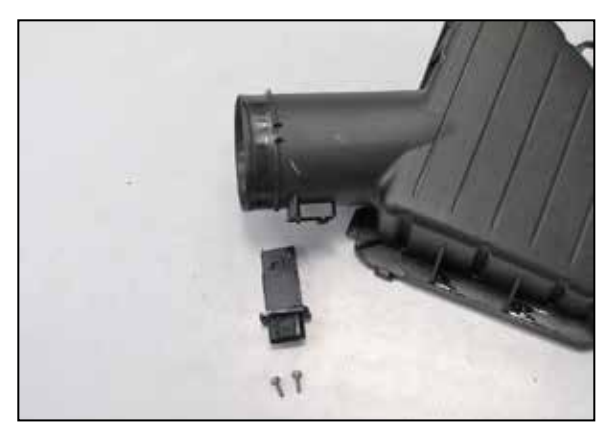
7. Remove the mass air sensor from the air filter