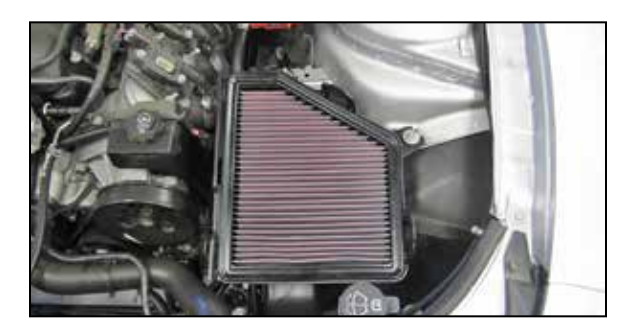
13. Remove the factory air filter and replace with the provided K&N® air filter.

NOTE: Plastic NPT fittings are easy to cross thread. Install the vent fitting "hand" tight, then turn it two complete turns with a wrench.