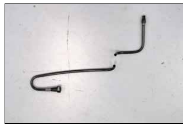
18a. On 2014 and later vehicles, it will be necessary to cut the crank case vent tube as shown. Then connect the Cut section of tube to the oil filler cap. Attach the supplied hose to the to the trimmed section of crank case vent tube.

NOTE: On 2014 and later model vehicles, see the next step for crank case vent hose to engine connection.