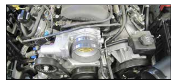
15. Install the provided coupling hose (08761) onto the throttle body and secure with the provided hose clamp.