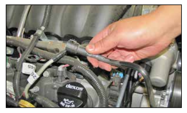
3. Disconnect the crank case vent tube from the valve cover port.

NOTE: On 2014 and later vehicles, the manufacturer changed the crank case vent system. The crank case vent tube will need to be unhooked from the oil filler cap before the cap can be removed from the engine.