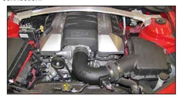
20. Reinstall the engine cover, Reconnect the negative battery cable. Double check to make sure everything is tight and properly positioned before starting the vehicle.