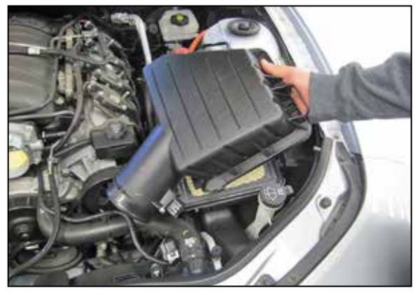
6. Release the two clips securing the air filter cover and then remove the air filter cover.