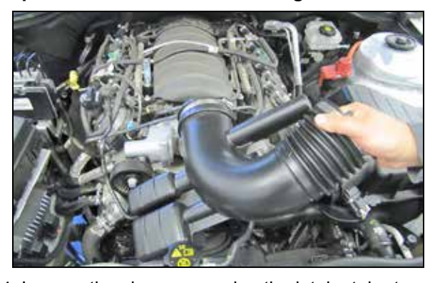
4. Loosen the clamps securing the intake tube to the throttle body and air filter housing and then remove the factory intake tube.

NOTE: On 2014 and later vehicles, the manufacturer changed the crank case vent system. The crank case vent tube will need to be unhooked from the oil filler cap before the cap can be removed from the engine.