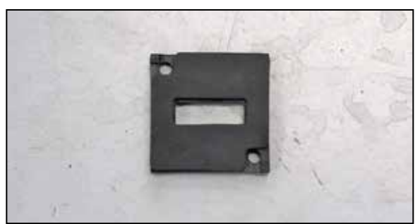
9. Install the provided gasket onto the K&N® mass air sensor adapter.