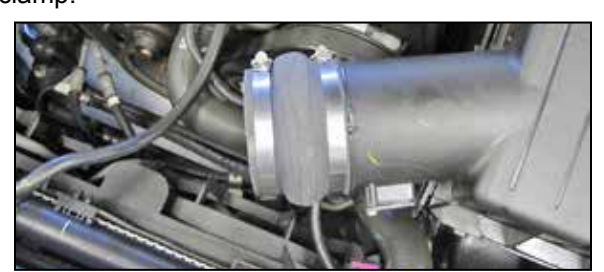
16. Install the provided coupling hose (08418) onto the air filter cover and secure with the provided hose clamp.