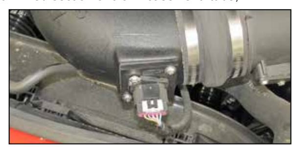
19. Reconnect the mass air sensor electrical connection.