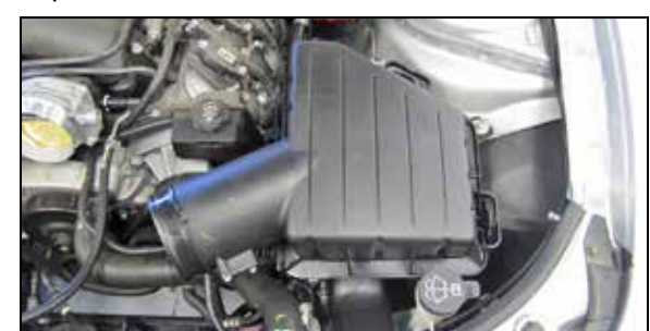
14. Reinstall the air filter cover.