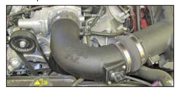
17. Install K&N® intake tube into the hose at the throttle body and then into the hose at the air filter cover, adjust the tube for proper fit and then secure with the provided hose clamps.