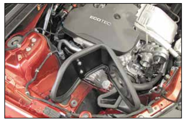
9. Install the heat shield assembly onto the engine mount and secure with the factory bolt from the previous step.

NOTE: The bolt will be reused in the next step.