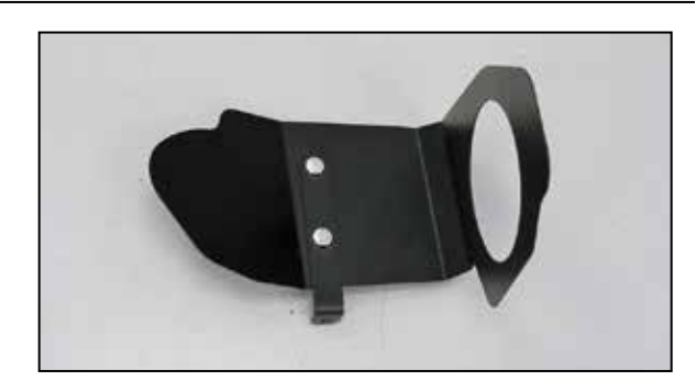
5. Install the heat shield mounting bracket (064337) onto the heat shield as shown using the provided

3. Disconnect the crank case vent hose. NOTE: On 2017 and later vehicles, it will be necessary to use the special tool provided (088027) to disconnect the crank case vent line. Snap the tool onto the vent tube and then slide it upwards until it unlocks the retaining clips and then disconnect the crank case vent line.