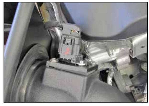
19. Reconnect the mass air sensor electrical connection.

17. Install the air filter onto the K&N<sup>®</sup> intake tube and secure with the provided hose clamp. Adjust the tube and heat shield for best fit and then secure them with the hose clamp and hardware. NOTE: Drycharger<sup>®</sup> air filter wrap; part # RC-4630DK is available to purchase separately. To learn more about Drycharger<sup>®</sup> filter wraps or look up color availability please visit http://www.knfilters.com<sup>®</sup>.