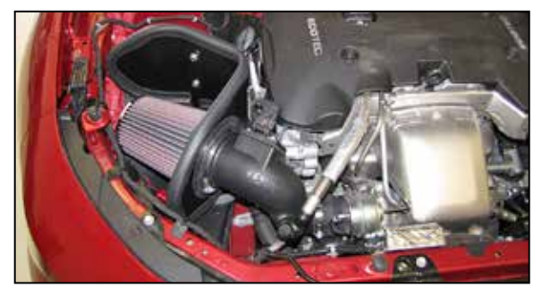
21. Reconnect the vehicle's negative battery cable. Double check to make sure everything is tight and properly positioned before starting the vehicle.

20. Using the provided tie wraps, secure the mass air sensor electrical cable to the A/C line as shown.