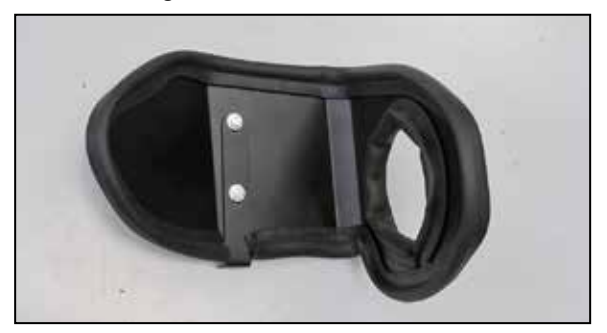
7. Install the edge trim into the hole and around the heat shield as shown.

6. Cut the provided edge trim into two sections, one section will be 15-1/2" long and the other section will be 46" long.