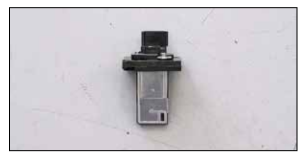
14. Install the mass air sensor into the K&N<sup>®</sup> mass air sensor adapter and secure with the provided hardware.