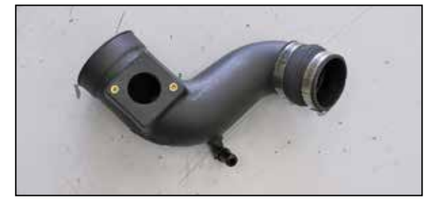
11. Install the 90° NPT vent fitting into the K&N ^{\otimes} intake tube as shown.

NOTE: Plastic NPT fittings are easy to cross thread. Install the vent fitting "hand" tight, then turn it two complete turns with a wrench.