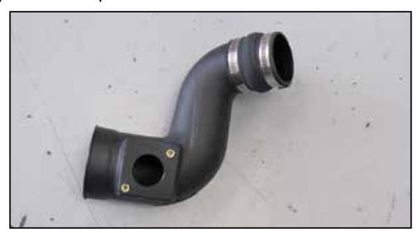
10. Install the provided hump coupler (084018) hose onto the K&N ^{\circ} intake tube and secure with the provided hose clamp.