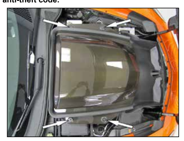
2. Loosen the four bolts that secure the super charger cover, remove the bolts and then remove the cover from the vehicle.

NOTE: Disconnecting the negative battery cable erases pre-programmed electronic memories. Write down all memory settings before disconnecting the negative battery cable. Some radios will require an anti-theft code to be entered after the battery is reconnected. The anti-theft code is typically supplied with your owner's manual. In the event your vehicles anti-theft code cannot be recovered, contact an authorized dealership to obtain your vehicles anti-theft code.