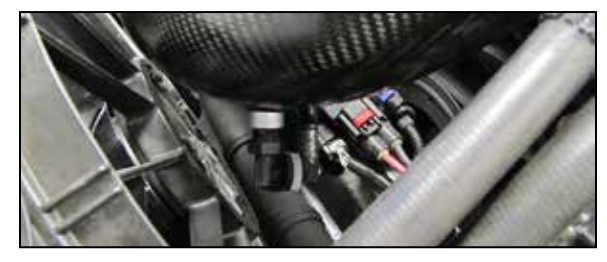
19. Connect the factory crank case vent line to the quick connect fitting installed into the K&N® intake tube.