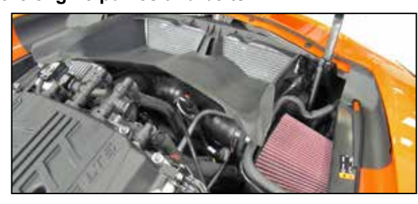
21. Reinstall the air extractor duct and secure with the factory hardware.