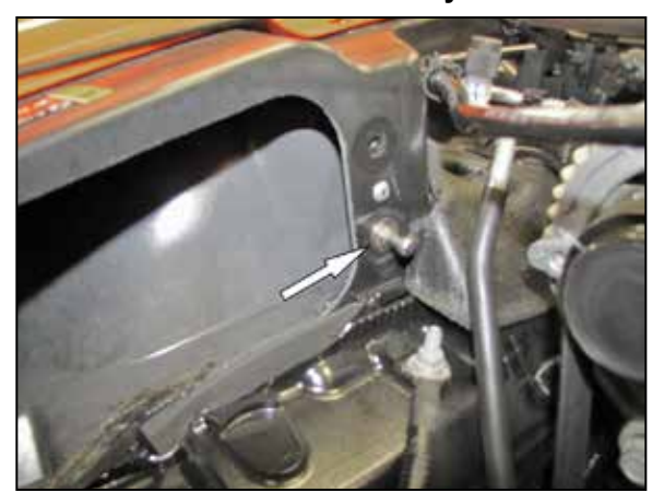
9. Remove the air filter housing mounting stud from the inner fender.