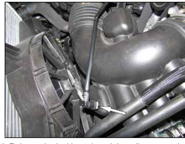
4. Release the locking tab and then disconnect the crank case vent line from the factory intake tube.