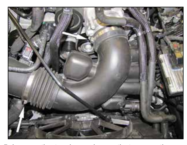
5. Loosen the two hose clamps that secure the factory intake tube and then remove the intake tube from the vehicle.