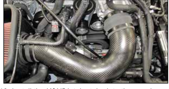
18. Install the K&N® intake tube into the coupler hose at the air filter and then into the coupler at the throttle body. Adjust the tube for best fit and then secure with the provided hose clamps.