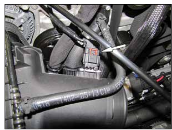
6. Pull the red locking tab back and then disconnect the mass air sensor electrical connection.