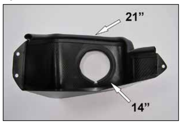
12. Install the edge trim onto the K&N<sup>®</sup> heat shield as shown.