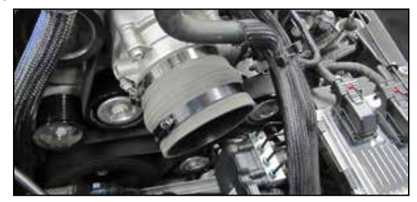
15. Install the provided coupler (08633) onto the throttle body and secure with the provided hose clamp.