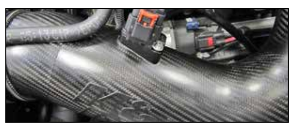
20. Using the provided extension harness, reconnect the mass air sensor electrical connection.