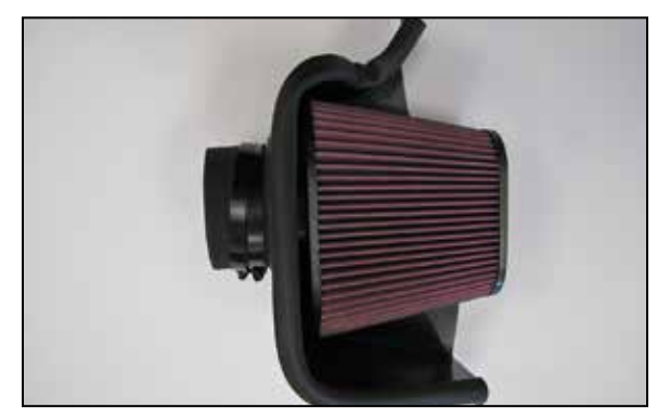
13. Install the K&N® air filter into the heat shield, install coupler hose (08761) onto the filter and secure with the provided hose clamp.