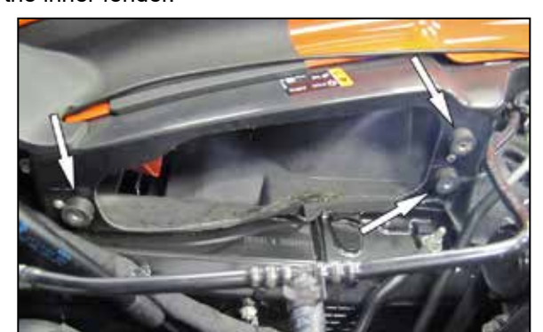
10. Install the three rubber mounted studs into the air filter housing mounting location as shown.