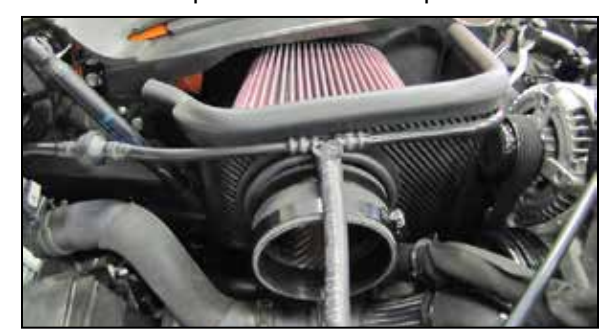
14. Install the heat shield/air filter assembly onto the rubber mounted studs and secure with the provided hardware.