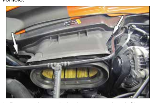
8. Remove the two bolts that secure the air filter housing to the inner fender and then remove the housing and air filter from the vehicle.