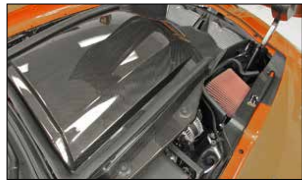
22. Reinstall the super charger cover and secure with the factory hardware.