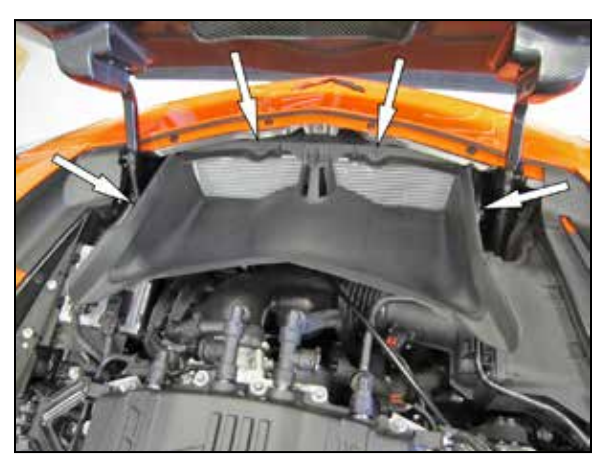
3. Loosen the four bolts that secure the air extractor duct to the radiator and then remove the extractor from the vehicle.