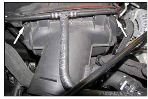
7. Loosen the two screws that secure the mass air sensor housing to the air filter housing and then remove the mass air sensor housing from the vehicle.