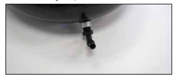
17. Install the provided crank case quick connect fitting into the K&N® intake tube as shown. NOTE: Plastic NPT fittings are easy to cross thread. Install the vent fitting "hand" tight, then turn it two complete turns with a wrench.