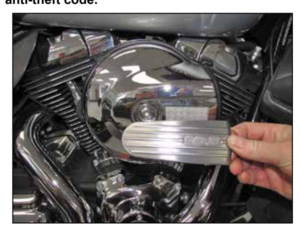
2. Remove the decorative badge from the air filter cover.

NOTE: Disconnecting the negative battery cable erases pre-programmed electronic memories. Write down all memory settings before disconnecting the negative battery cable. Some radios will require an anti-theft code to be entered after the battery is reconnected. The anti-theft code is typically supplied with your owner's manual. In the event your vehicles anti-theft code cannot be recovered, contact an authorized dealership to obtain your vehicles anti-theft code.