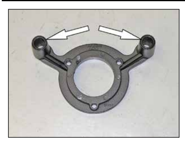
7. Install two of the provided O-Rings into the engine side of the K&N® intake tube adapter.