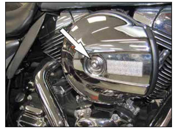
3. Remove the bolt securing the air filter cover and then remove the cover from the vehicle.