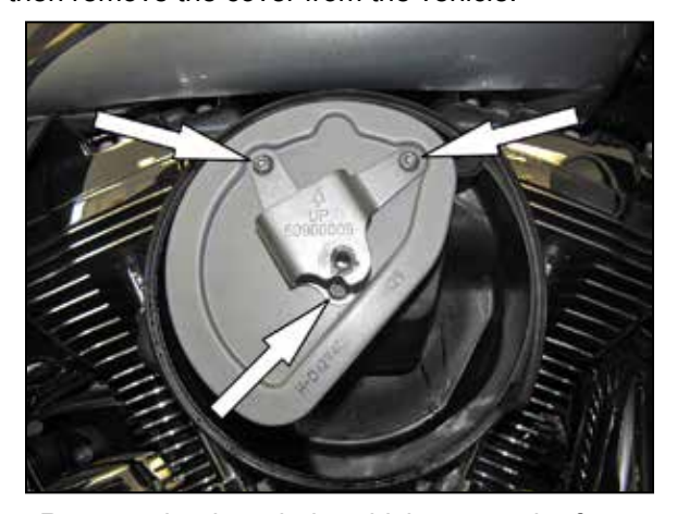
4. Remove the three bolts which secure the factory air filter to the base plate and then remove the air filter from the vehicle.