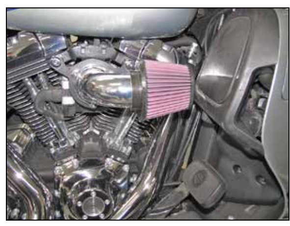
11. Install the K&N® air filter and secure with the provided hose clamp.