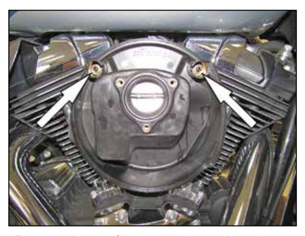
5. Remove the two factory crank case breather bolts and then remove the filter back plate from the vehicle.

NOTE: K&N Engineering, Inc., recommends that customers do not discard factory air intake.