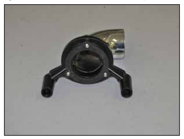
8. Install the tube with the bolts and gasket onto the tube adapter and then install the remaining gasket onto the adapter.