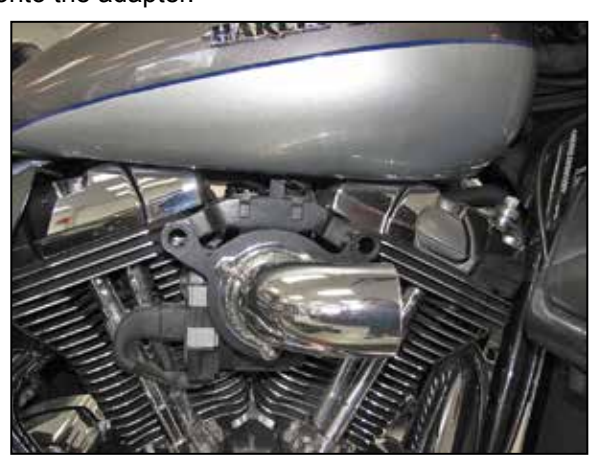
9. Apply one drop of the provided thread locker onto the tube mounting bolts. Install the complete tube and adapter assembly onto the throttle body and secure with the tube mounting bolts. NOTE: Do not completely tighten the tube bolts at this time.