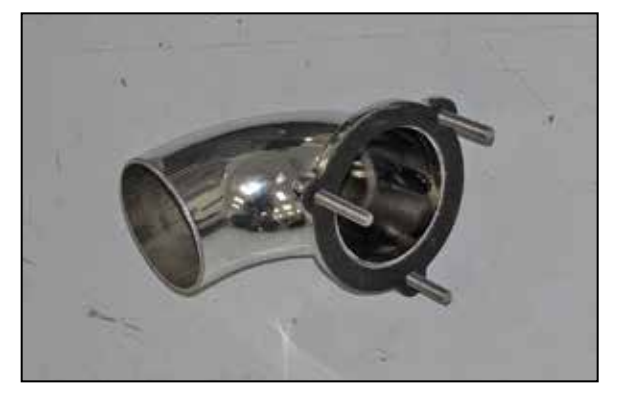
6. Install the three provided tube mounting bolts into the K&N® intake tube and then install one of the two provided gaskets onto the bolts.

NOTE: K&N Engineering, Inc., recommends that customers do not discard factory air intake.