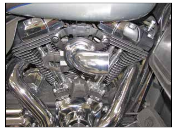
10. Install the two remaining O-Rings and K&N® breather bolts into the tube adapter. Tighten all of the hardware at this time.