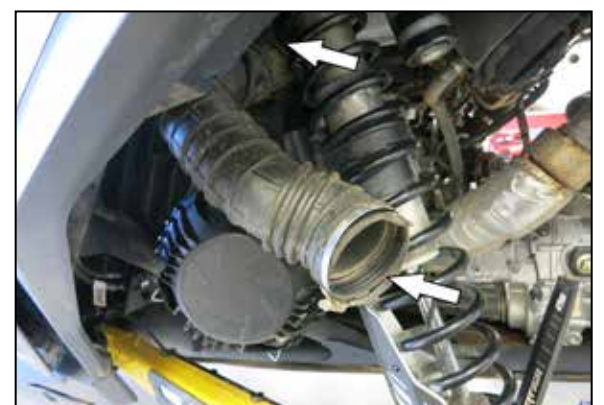
5. Remove the factory fresh air intake duct.