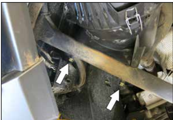
2. Remove the factory air filter housing mounting bolts shown. Save for later install.

1. Turn off the ignition and disconnect the negative battery cable. NOTE: Disconnecting the negative battery cable erases pre-programmed electronic memories. Write down all memory settings before disconnecting the negative battery cable. Some radios will require an anti-theft code to be entered after the battery is reconnected. The anti-theft code is typically supplied with your owner's manual. In the event your vehicles anti-theft code cannot be recovered, contact an authorized dealership to obtain your vehicles anti-theft code.