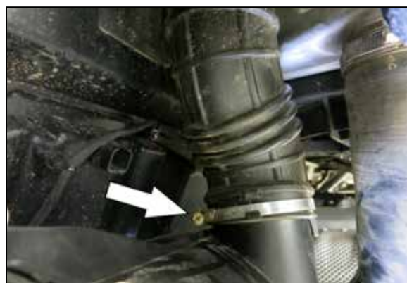
4. Loosen the hose clamp that secures the fresh air duct to the factory air filter housing.