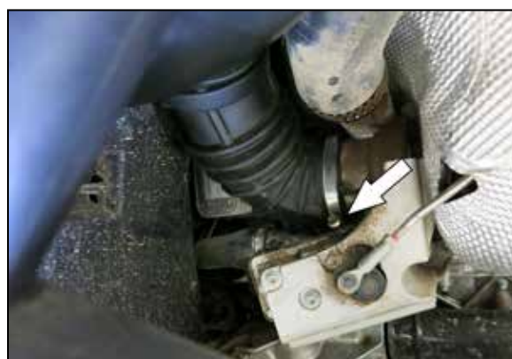
3. Loosen the hose clamp that secures the factory intake tube to the turbo inlet.