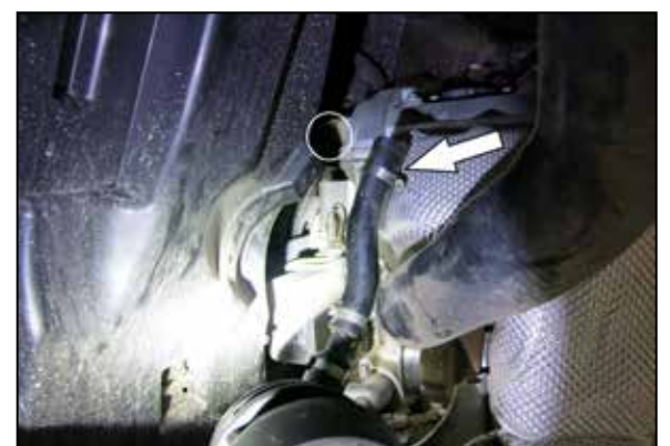
6. Loosen the hose clamp that secures the CCV hose to the engine, remove the complete factory intake system.