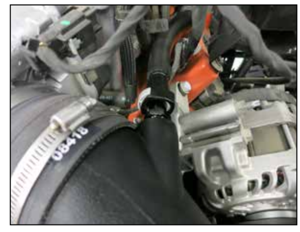
25. Connect the CCV quick connect fitting to the fitting installed into the K&N intake tube.