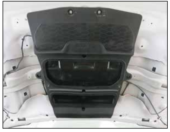
45. Snap the retaining clips into the hood and then secure the front of the duct to the hood with the hardware provided.