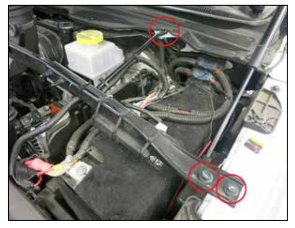
8. Remove the three bolts shown that secure the air filter housing mounting bracket to the driver side inner fender.