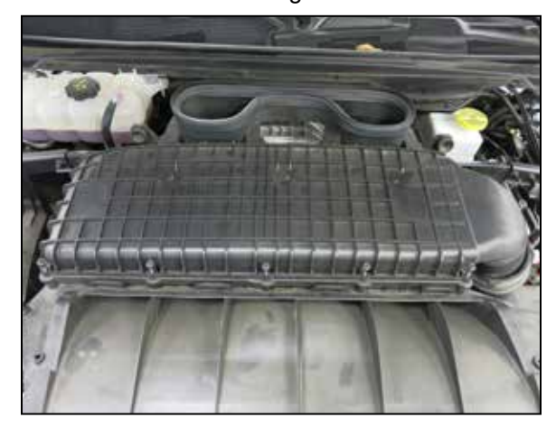
6. Loosen the ten screws that secure the upper air filter housing to the lower air filter housing and then remove the upper housing. Remove the air filters from the lower housing.