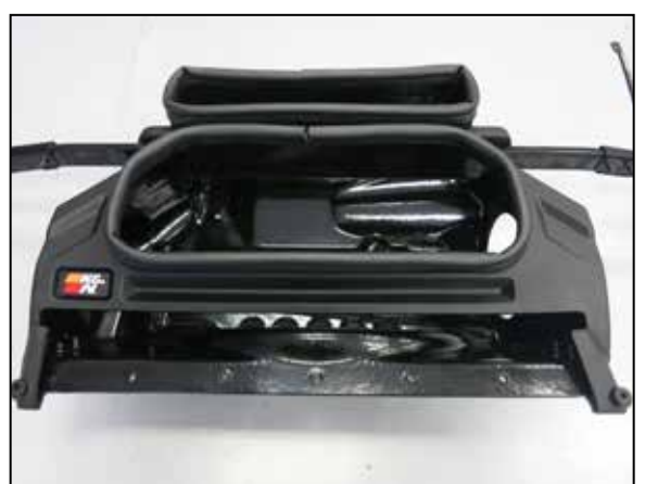
27. Install the provided edge trim onto the K&N air filter bousing