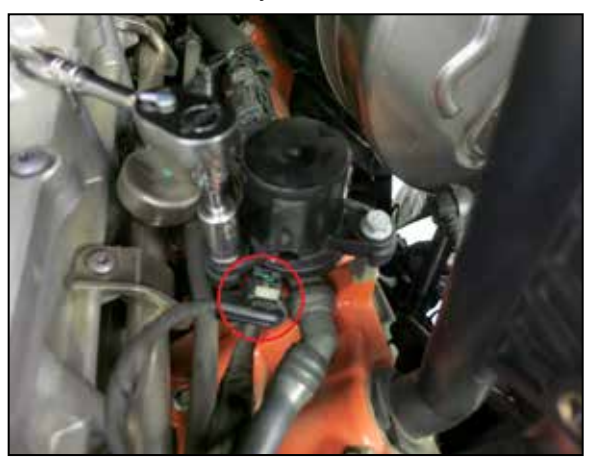
12. Disconnect the CCV switch electrical connection. Remove the mounting bolts that secure the CCV switch to the valve cover.