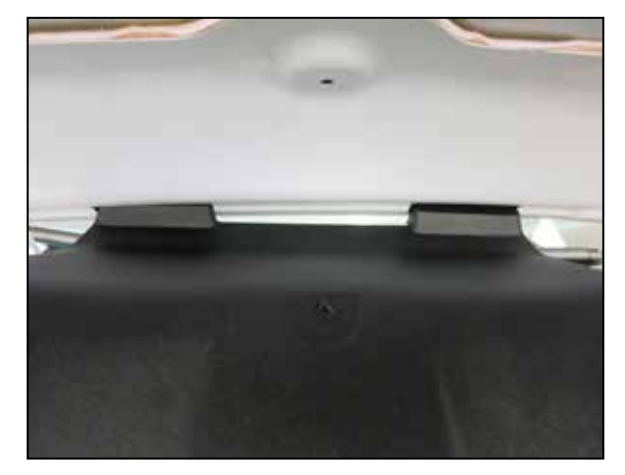
43. Install the tabs at the rear of the K&N fresh air duct onto the slots of the hood.