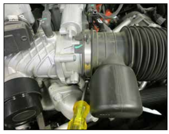
11. Loosen the hose clamp that secures the intake tube to the throttle body.