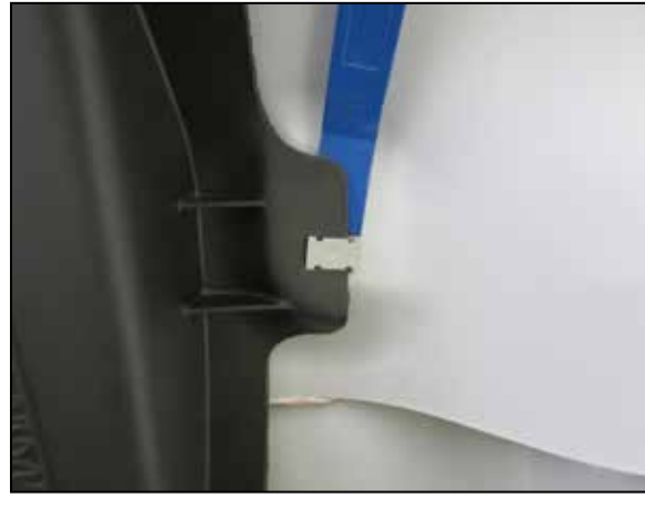
20. Using a panel popper tool or similar device, pry the clips that attach the fresh air duct to the hood to separate the duct from the hood. Remove the factory fresh air duct from the hood.