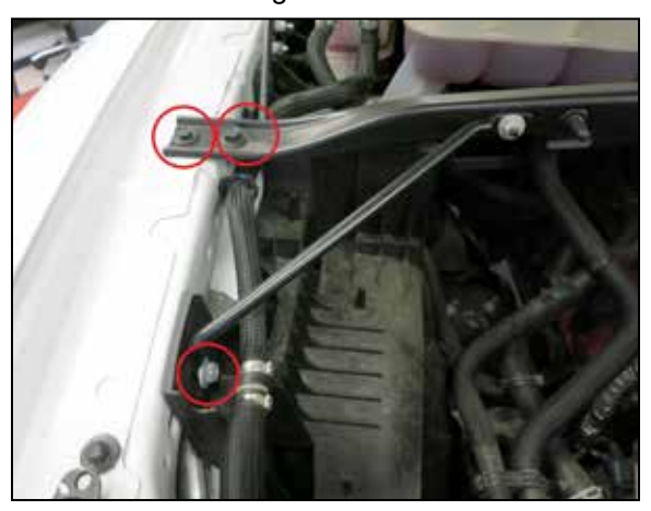
7. Remove the three bolts shown that secure the air filter housing mounting bracket to the passenger side inner fender.