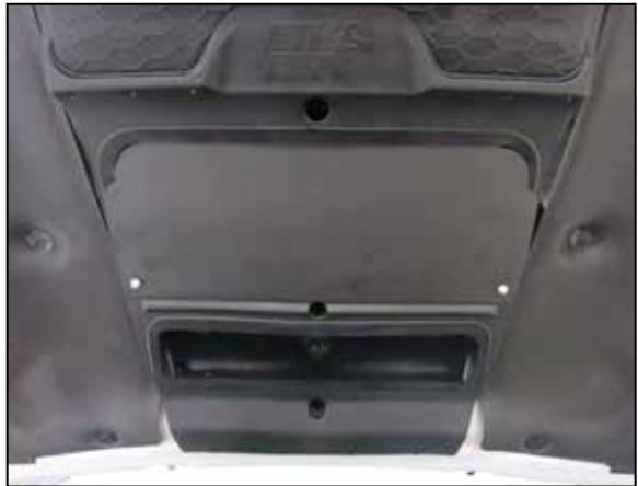
47. During severe inclement weather such as heavy rain or snow, K&N recommends install the provided forward fresh air block off plate using the provided hardware.