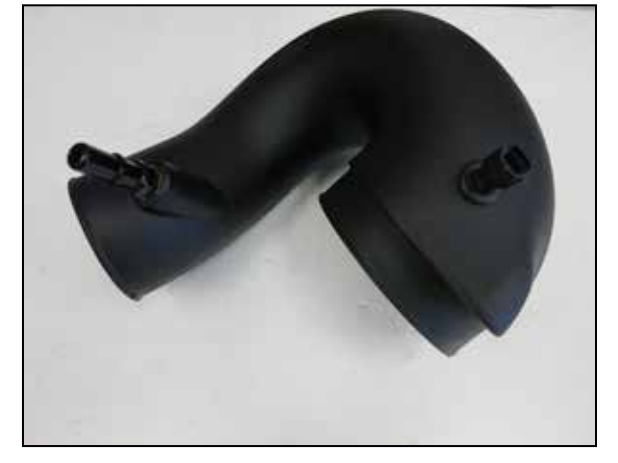
21. Remove the IAT sensor from the factory intake tube and install it into the K&N intake tube using the provided grommet. Install the provided quick connect fitting into the K&N intake tube as shown. NOTES: The IAT sensor is fragile, use care when handling the sensor so as not to break it. The quick connect fitting npt tapered threads and will not tighten all the way down.