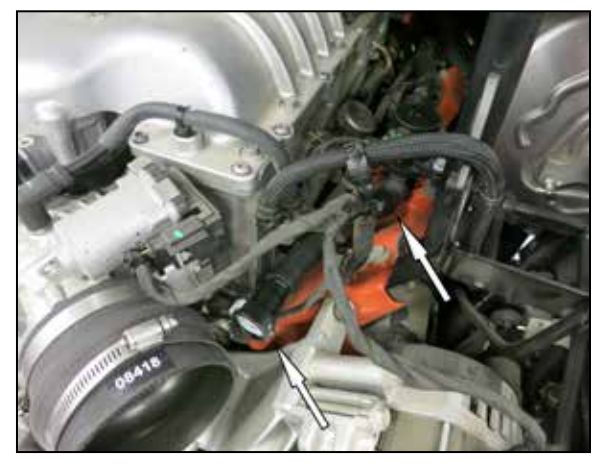
23. Assemble the provided CCV hose and quick connect fitting. Install the assembled CCV hose onto the CCV switch as shown.

22. Install the provided coupler onto the throttle body and secure with the provided hose clamp.