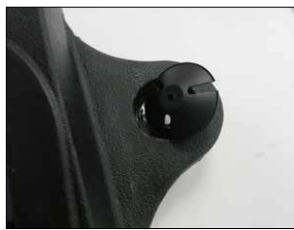
42. Feed two of provided retaining clips into the K&N fresh air duct as shown.

41. Using the provided tie wrap, secure the harness to the hood as shown.