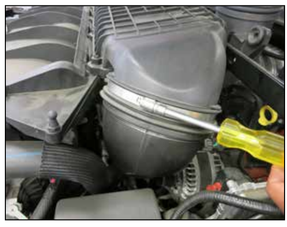
5. Loosen the hose clamp that secures the intake hose to the air filter housing.