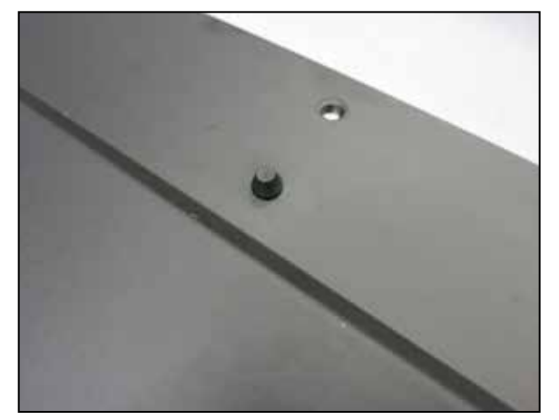
28. Install the three rubber bumpers into the support bracket as shown.