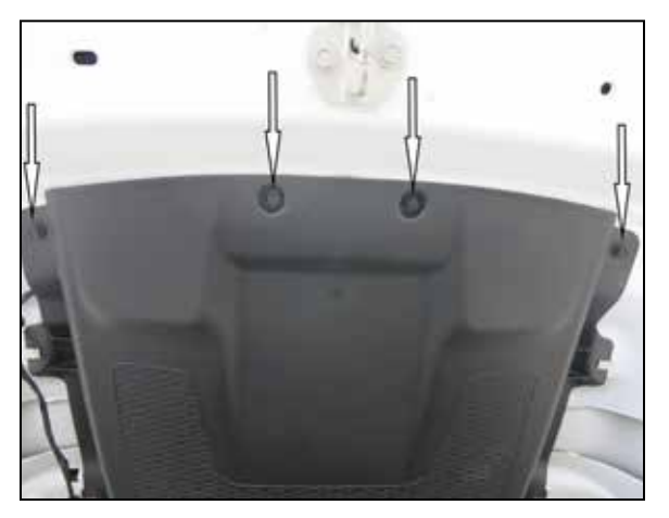
19. Remove the four bolts that secure the front of the factory fresh air intake duct.