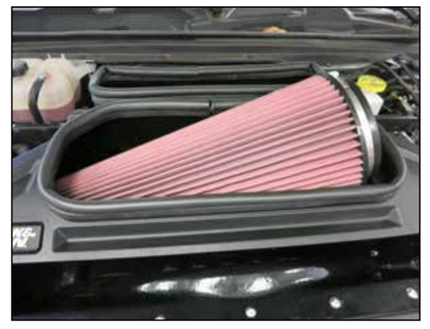
37. Install the K&N air filter into the housing and onto the intake tube, then secure with provided hose clamp.