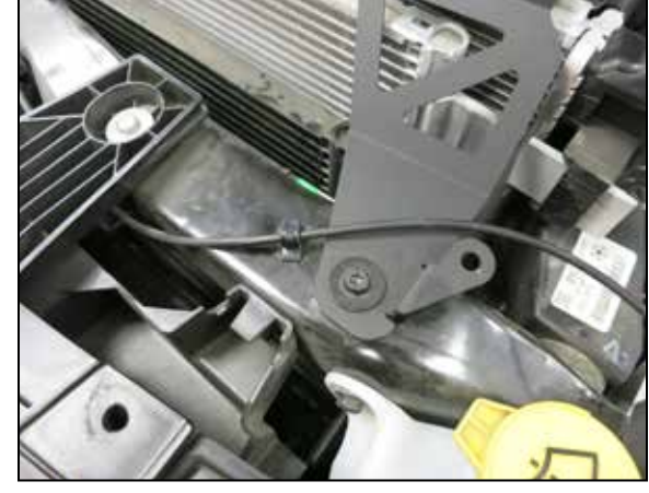
33. Secure the front air filter housing mounting bracket to the core support using the factory air filter housing mounting bolts.