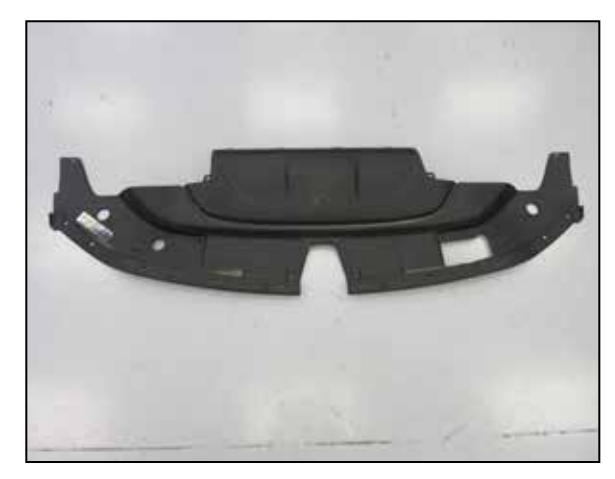
3. Remove the plastic fasteners from the upper valence and then remove the valence from the vehicle.