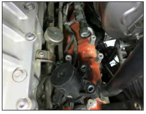
13. Disconnect the CCV line from the CCV switch at the quick connector.