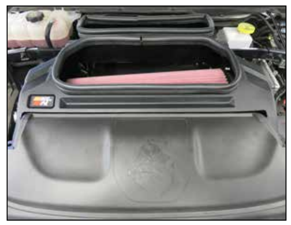
38. Reinstall the upper valence and secure with the factory retaining clips.