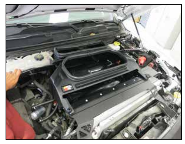
31. Set the air filter housing assembly into the vehicle.

30. Secure the top side of the filter housing to the support bracket with the provided hardware.