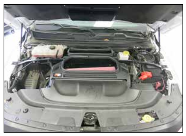
48. Reconnect the vehicle's negative battery cable. Double check to make sure everything is tight and properly positioned before starting the vehicle.

49. It will be necessary for all K&N<sup>®</sup> high flow intake systems to be checked periodically for realignment, clearance and tightening of all connections. Failure to follow the above instructions or proper maintenance may void warranty.