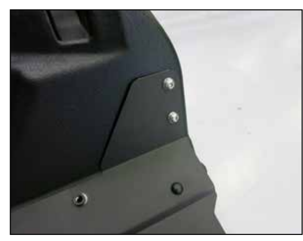
29. Secure the support bracket to the K&N air filter housing with the provided hardware.