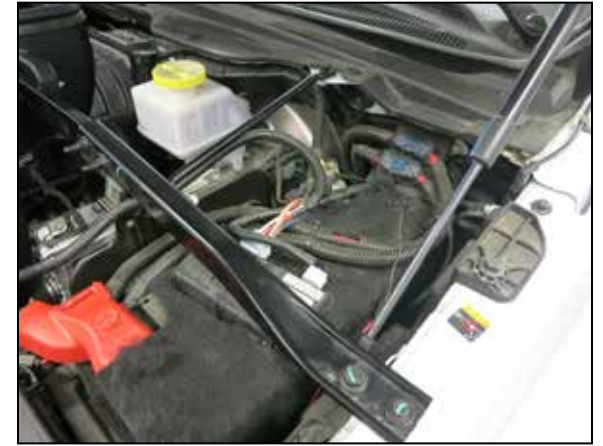
34. Secure the air filter support bracket onto the inner fenders using the factory hardware.