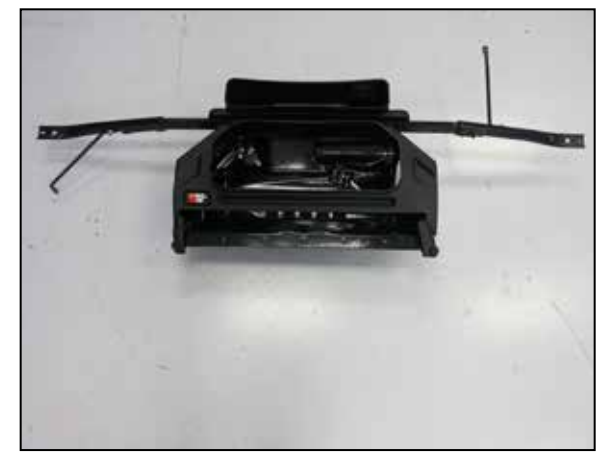
26. Secure the factory air filter housing support bracket to the K&N air filter housing using the provided hardware. Install the K&N logo into the filter housing.