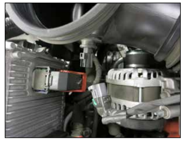
10. Disconnect the IAT sensor electrical connection.