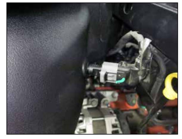
36. Reconnect the IAT sensor electrical connection.