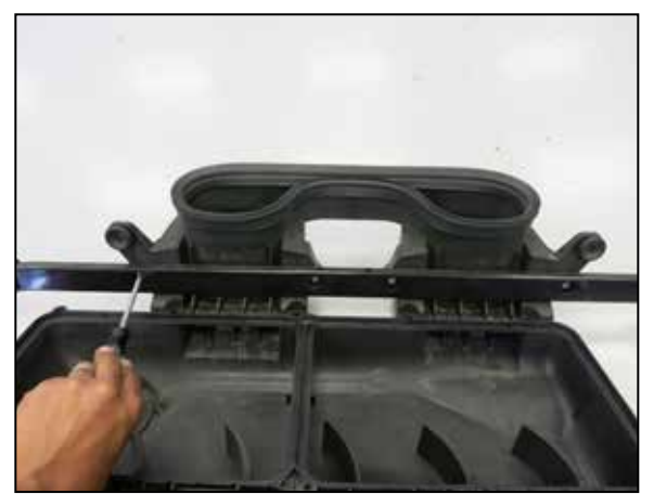
17. Remove the bolts that secure the air filter housing support bracket to the housing and set the support bracket aside.