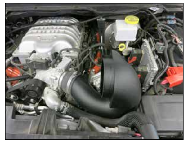
24. Install the K&N intake tube into the coupler at the throttle body but do not tighten the hose clamp to secure the tube.