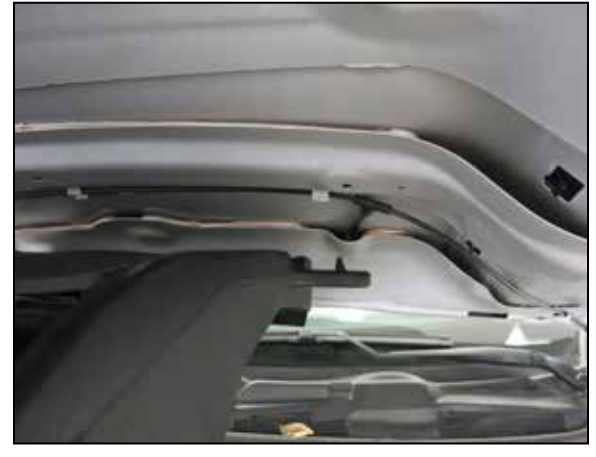
44. Rotate the fresh air duct up and align the mounting clips previously installed to the mounting holes in the hood.