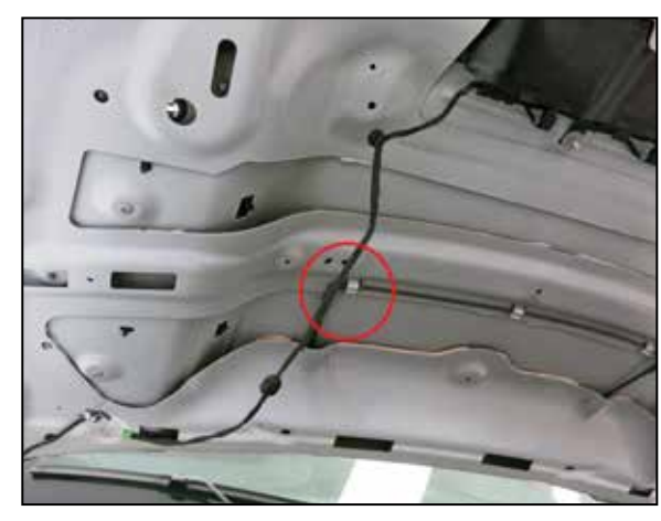
40. Unclip the wiring harness from the under side of the hood where shown.