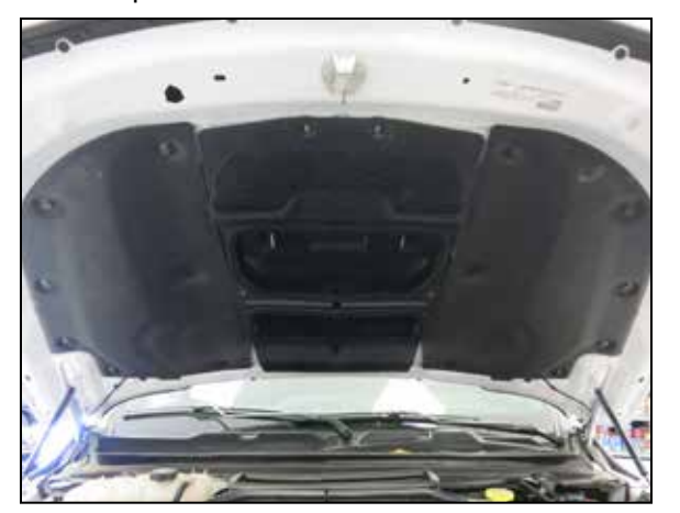
46. Reinstall the under hood insulation and secure with the provided retaining clips.