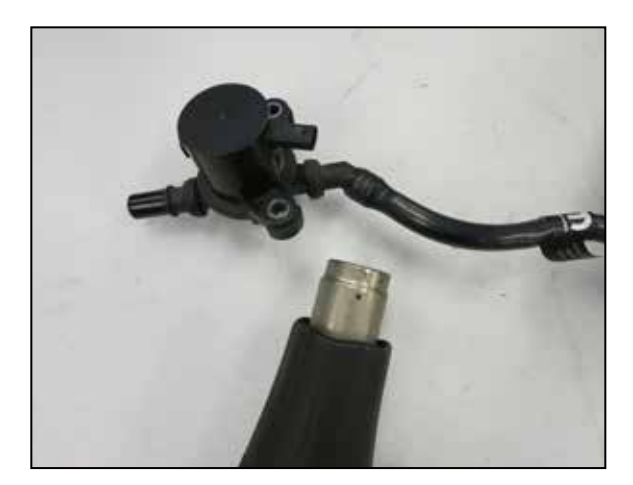
15. Using a heat gun or hair dryer, warm the connection of the CCV pipe to the CCV switch and then separate the pipe from the switch.