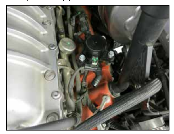
16. Reinstall the CCV switch onto the valve cover and secure with the factory bolts. Reconnect the CCV hose quick connector and connect the electrical connection.