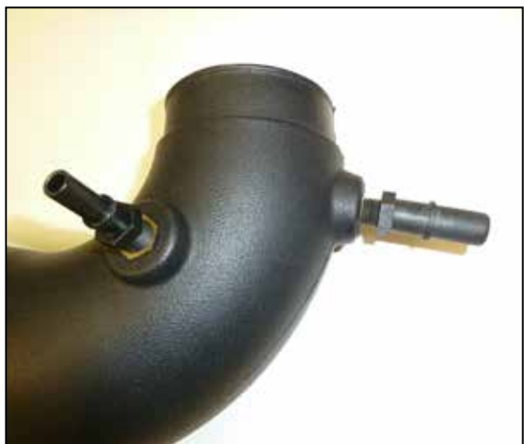
14. Install the provided quick disconnect fittings into the K&N intake tube as shown. Note: On vehicles that are only equipped with the one fitting on the side of the intake tube, install the provided pipe plug into the second position. Two different fittings are provided for the top position, be sure to install the correct fitting depending on how the vehicle is equipped from the factory. NPT fittings are easy to cross thread. Install the vent fitting “hand” tight, then turn it two complete turns with a wrench.