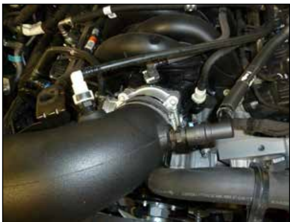
18. Reconnect the CCV hoses to the fittings installed into the K&N intake tube.