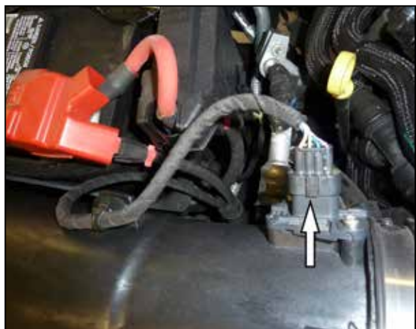
4. Disconnect the MASS air sensor electrical connection.