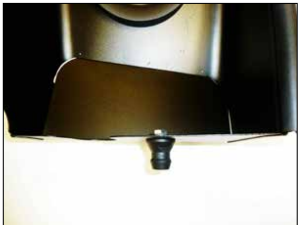
10. Install the mounting post onto the heat shield and secure with the provided hardware.