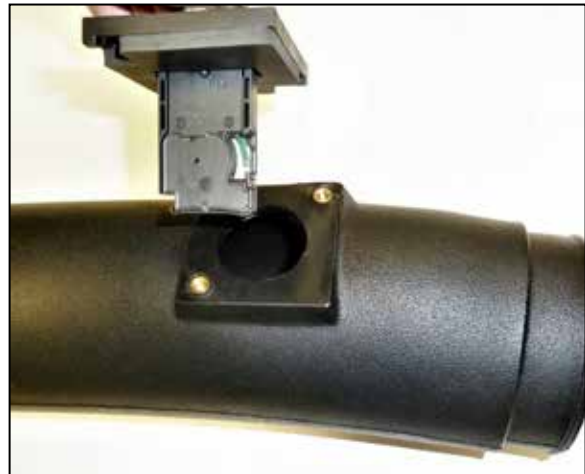
13. Install the mass air assembly into the K&N intake tube and secure with the provided hardware. NOTE: Be sure to install the sensor in the correct direction for proper operation.