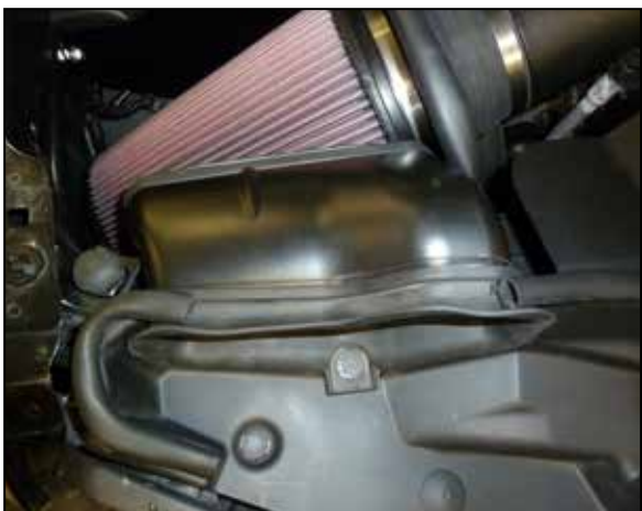
21. Reinstall the fresh air intake duct and secure with the factory push pin.