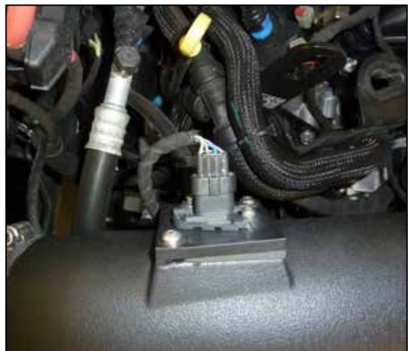
19. Reconnect the mass air sensor electrical connection.