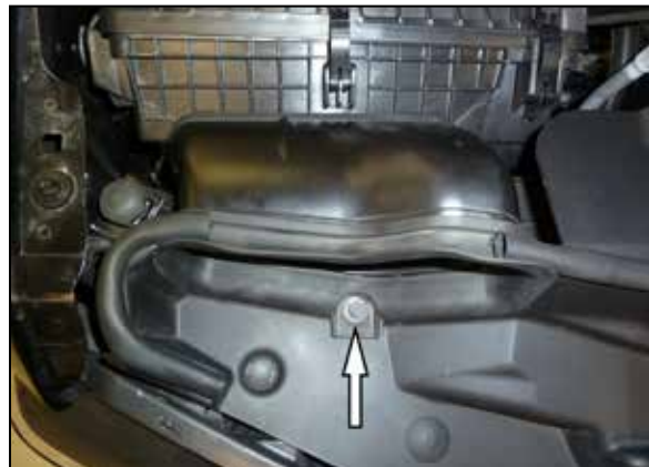
5. Remove the push pin securing the fresh air intake duct and then remove the duct from the vehicle.