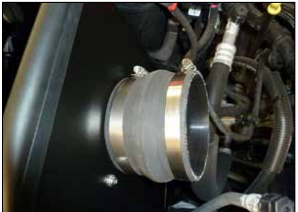
16. Install the provided hump coupler onto the filter adapter and secure with the provided hose clamp.