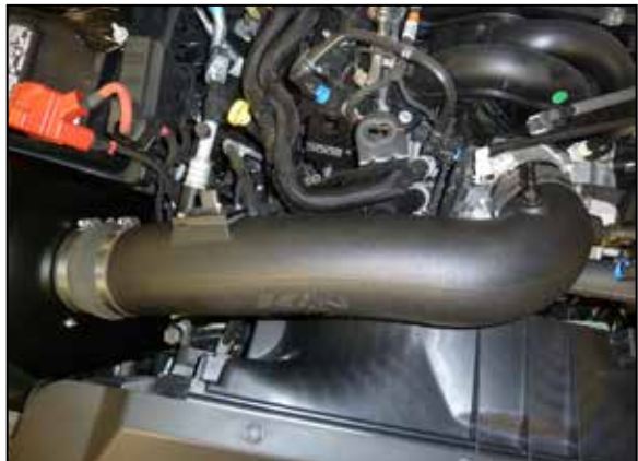
17. Install the K&N intake tube into the hump coupler and then connect to the throttle body, secure with the provided hose clamps