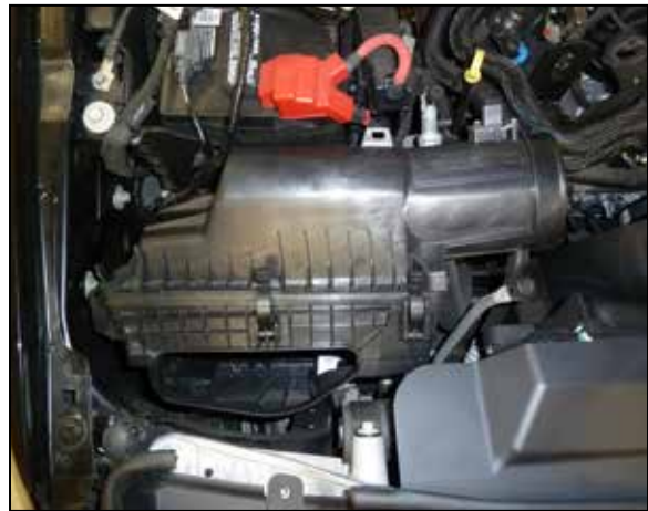
6. Pull up the air filter housing and remove it from the vehicle. NOTE: K&N Engineering, Inc., recommends that customers do not discard factory air intake.