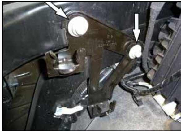
7. Remove the two bolts securing the air filter housing mounting brackets and then remove the bracket.