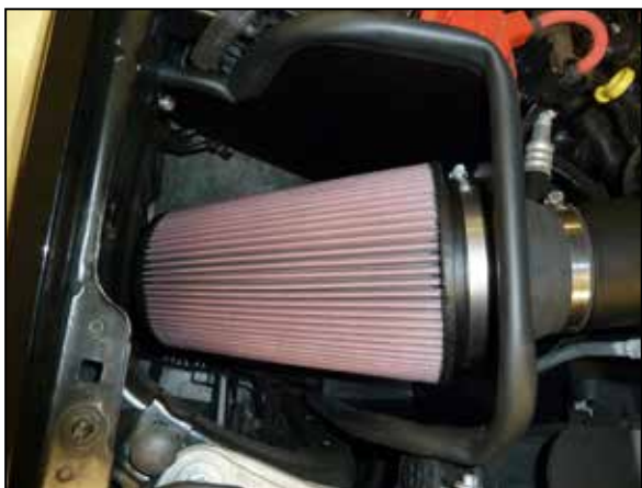
20. Install the K&N air filter and secure with the provided hose clamp.