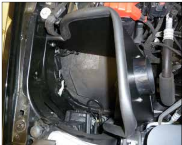
11. Install the heat shield assembly into the vehicle so the mounting post inserts into the factory mounting grommet and then secure with the provided hardware.