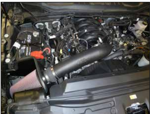
22. Reconnect the vehicle's negative battery cable. Double check to make sure everything is tight and properly positioned before starting the vehicle.

23. It will be necessary for all K&N® high flow intake systems to be checked periodically for realignment, clearance and tightening of all connections. Failure to follow the above instructions or proper maintenance may void warranty.