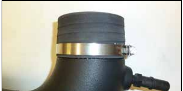
15. Install the provided straight coupler onto the K&N intake tube and secure with the provided hose clamp. NOTE: 2020-22 model years will use the straight coupler p/n 08698, 2023 and later model years will use step coupler p/n KITRDCR28.