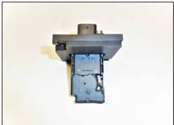
12. Install the provided gasket onto the mass air sensor adapter and then install the mass air sensor into the adapter and secure with the provided hardware.