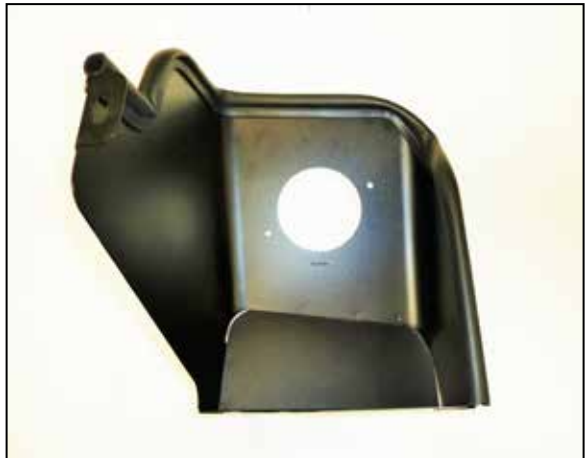
8. Install the provided edge trim onto the heat shield as shown. Some trimming of the edge trim will be necessary.