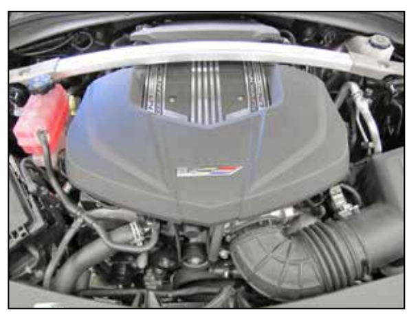
2. Lift the decorative engine cover and remove it from the engine.

NOTE: Disconnecting the negative battery cable erases pre-programmed electronic memories. Write down all memory settings before disconnecting the negative battery cable. Some radios will require an anti-theft code to be entered after the battery is reconnected. The anti-theft code is typically supplied with your owner's manual. In the event your vehicles anti-theft code cannot be recovered, contact an authorized dealership to obtain your vehicles anti-theft code.