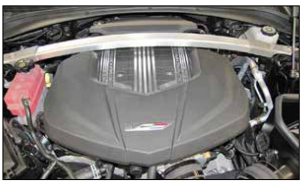
21. Reinstall the decorative engine cover.