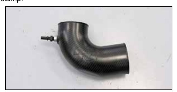
16. Install the provided NPT quick disconnect fitting into the K&N® intake tube.

NOTE: Plastic NPT fittings are easy to cross thread. Install the vent fitting "hand" tight, then turn it two complete turns with a wrench.