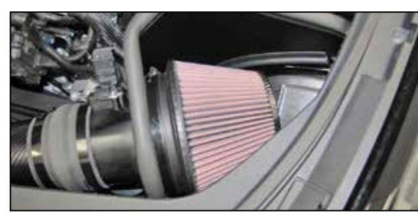
20. Install the K&N® air filter and secure with the provided hose clamp.