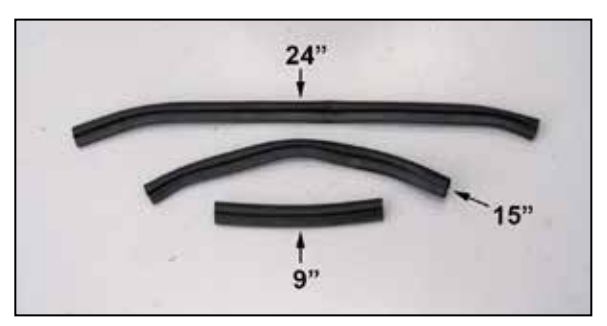
9. Cut the provided edge trim into three sections of 24", 15" and 9" as shown.