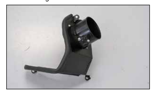
12. Install the mass air sensor into the K&N® air filter housing and secure with the provided