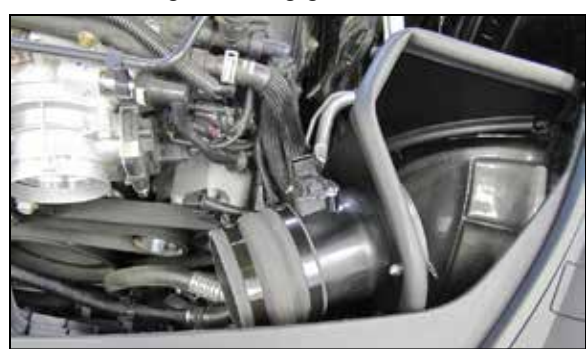
14. Install the provided hump coupler hose (084101) onto the mass air sensor housing and secure with the provided hose clamp.