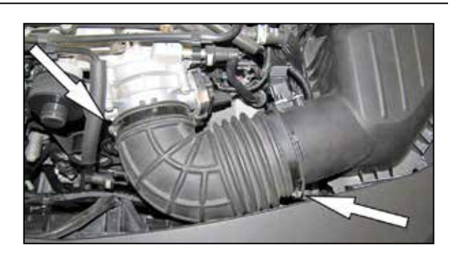
5. Loosen the hose clamps that secure the factory intake hose to the throttle body and air filter housing.