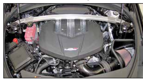
19. Reconnect the vehicle's negative battery cable. Double check to make sure everything is tight and properly positioned before starting the vehicle.

20. It will be necessary for all K&N® high flow intake systems to be checked periodically for realignment, clearance and tightening of all connections. Failure to follow the above instructions or proper maintenance may void warranty.