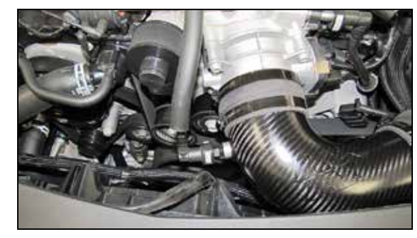
18. Connect the crank case vent fitting to the quick disconnect fitting installed into the K&N® intake tube.