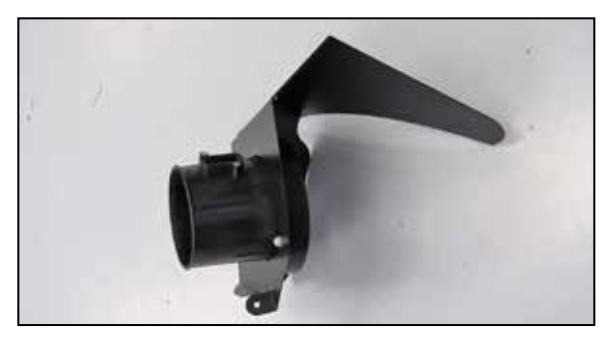
7. Install the K&N® mass air housing into the heat shield and secure with the provided hardware.