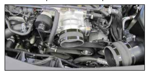
15. Install the provided coupler hose (08618) onto the throttle body and secure with the provided hose clamp.