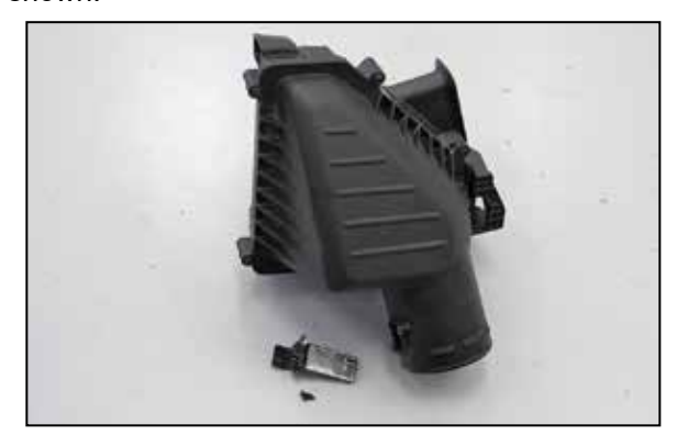
11. Remove the mass air sensor from the factory air filter housing.