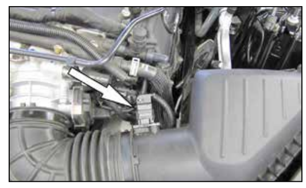
3. Disconnect the mass air sensor electrical connection.