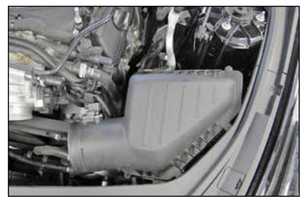
6. Lift the air filter housing assembly and remove it from the vehicle.

NOTE: K&N Engineering, Inc., recommends that customers do not discard factory air intake.