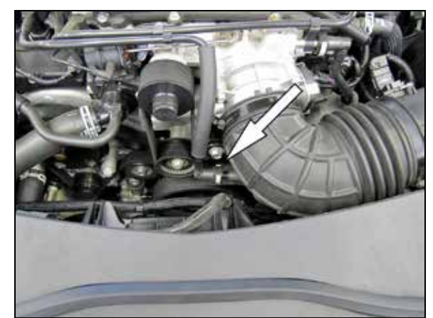
4. Disconnect the crank case vent quick disconnect