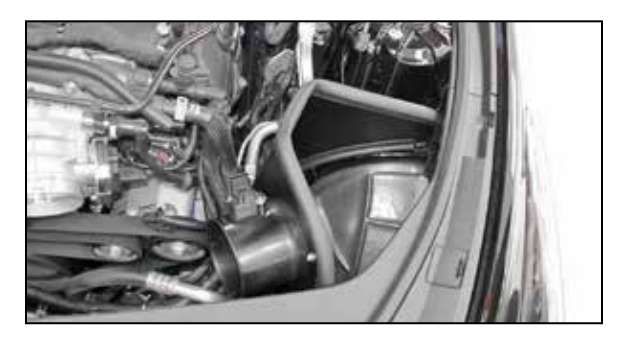
13. Install the heat shield assembly into the vehicle so that the mounting studs engage into the factory air filter housing mounting grommets.