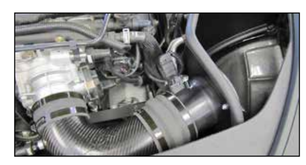
19. Connect the mass air sensor electrical connection.