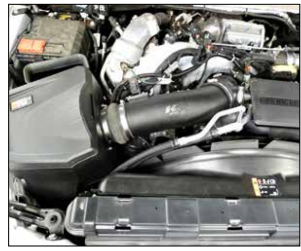
18. Reconnect the vehicle's negative battery cable. Double check to make sure everything is tight and properly positioned before starting the vehicle.