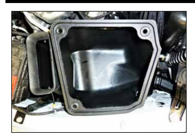
7. Set the K&N air filter housing into the vehicle so the studs protrude into the factory mounting grommets. Secure the K&N Air filter housing with the facory from step #4.