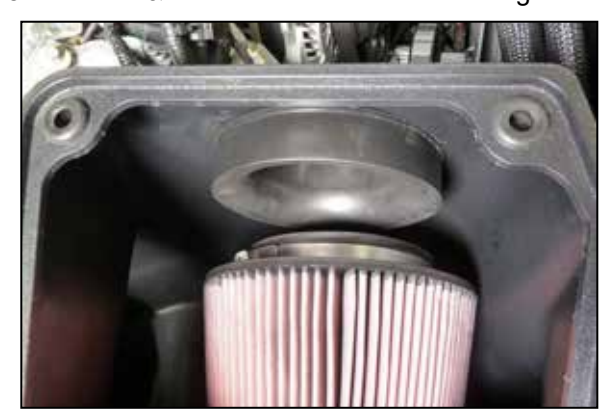
9. Install the filter adapter into the filter housing and secure with the provided hardware.