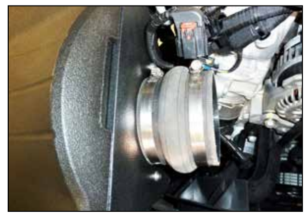
12. Install the provided hump coupler onto the filter adapter and secure with the provided hose clamp.