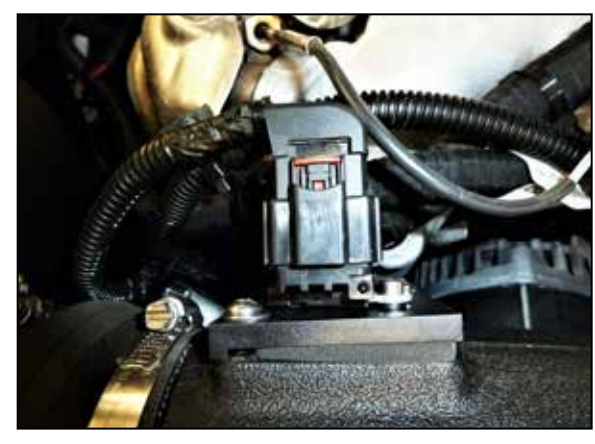
17. Reconnect the mass air sensor electrical connection.