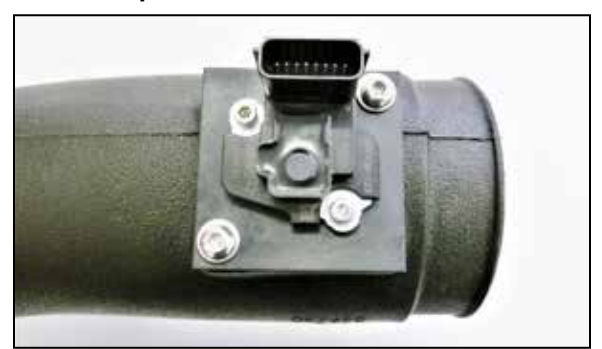
14. Install the mass air sensor assembly into the K&N intake tube and secure with the provided hardware. Be sure to install the sensor in the correct direction as shown. NOTE: 2024 model year vehicles and later have a different mass air sensor, the connector lays flat as compared to the sensor pictured.