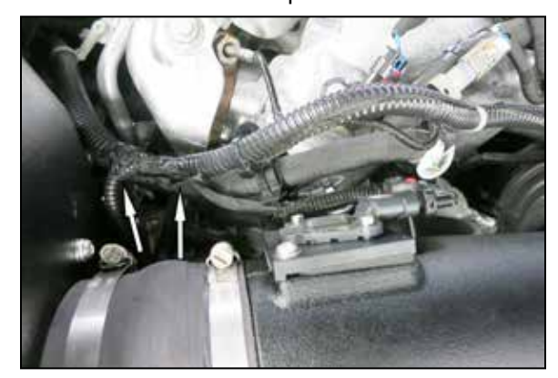
16. On 2014 and later model year vehicles that the electrical connection lays flat, it will be necessary to cut the electrical tape that secures the MAF pigtail to the main harness. Then pull approximately two inches of the MAF pigtail harness out from the main harness and retape the harness covering This will allow enough slack in the harness to allow connection.