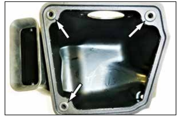
6. Install the three provided grommets into the K&N air filter housing as shown.