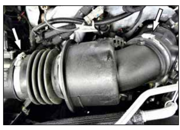
2. Loosen the two hose clamps securing the factory intake hose and then remove the hose from the vehicle.

NOTE: Disconnecting the negative battery cable erases pre-programmed electronic memories. Write down all memory settings before disconnecting the negative battery cable. Some radios will require an anti-theft code to be entered after the battery is reconnected. The anti-theft code is typically supplied with your owner's manual. In the event your vehicles anti-theft code cannot be recovered, contact an authorized dealership to obtain your vehicles