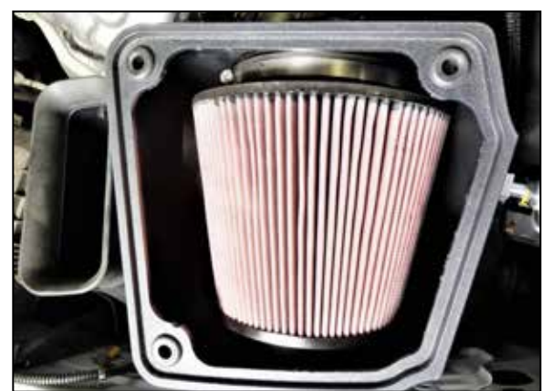
10. Slide the K&N air filter onto the filter adapter and secure with the provided hose clamp.