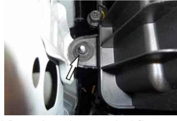
4. Remove the nut that secures the air filter housing into the vehicle and then lift up and remove the air filter housing from the vehicle.

3. Disconnect the mass air sensor electrical connection. NOTE: 2024 model year vehicles and later have a different mass air sensor, the connector lays flat as compared to the sensor pictured.