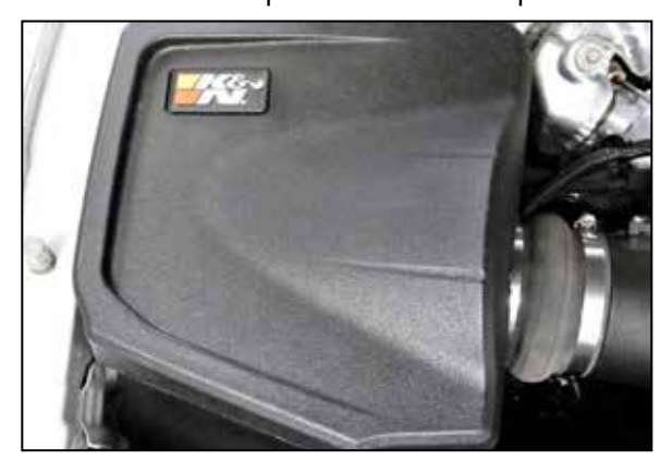
11. Install the K&N badge onto the lid and then install the lid onto the air filter housing as shown.