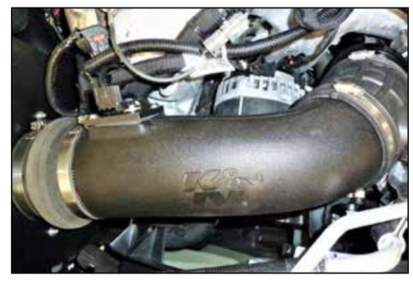
15. Install the K&N intake tube assembly into the coupler at the filter adapter and then into the factory coupler, adjust the tube for best fit and secure with the hose clamps.