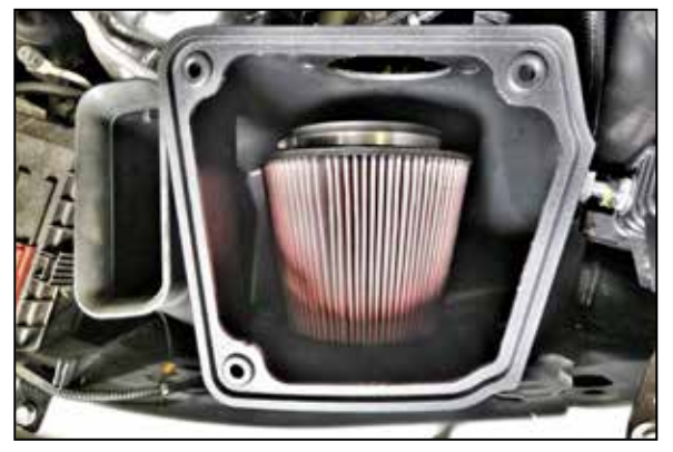
8. Set the K&N air filter into the filter housing.