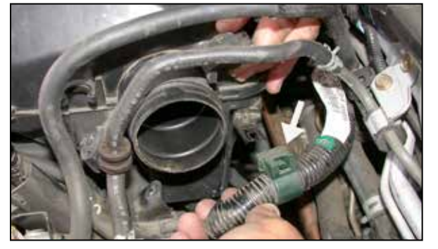
11. Using a flat blade screwdriver, unclip the wire harness from the resonator as shown.