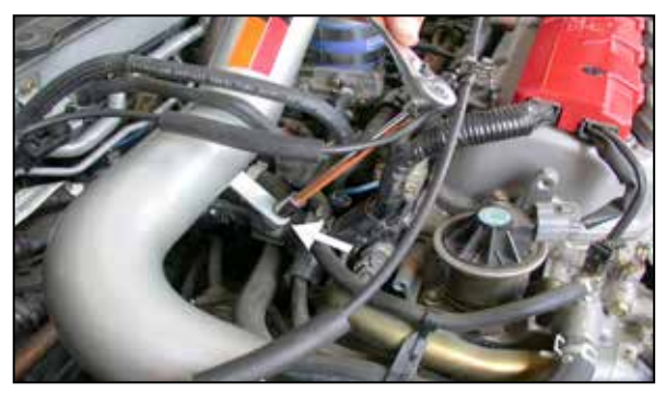
19. Secure the bracket to the rubber mounted stud using the provided hardware, but do not tighten completely at this time.

18. Install the K&N<sup>®</sup> intake tube onto the throttle body, then, line up the bracket with the rubber mounted stud as shown. Tighten hose clamps at this time.