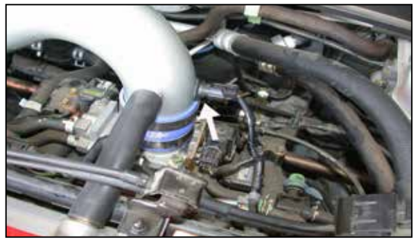
21. Reconnect the air temperature sensor electrical connection as shown.

20. Install the provided silicone hose onto the crankcase vent on the cam cover, then connect the other end to the vent on the K&N<sup>®</sup> intake tube as shown.