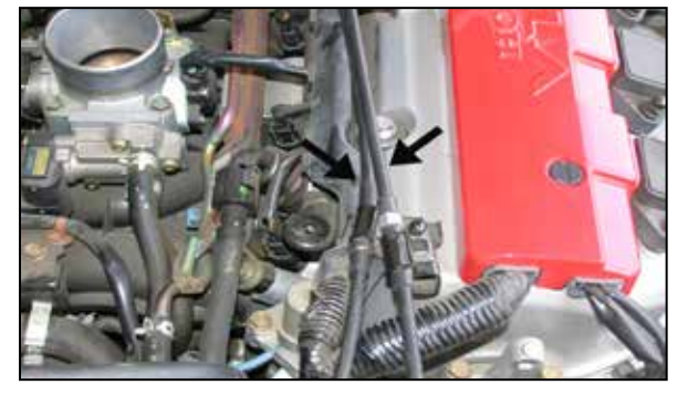
13. Secure the throttle cable and cruise control cable (if equipped) to the stock clips as shown.

NOTE: K&N Engineering, Inc., recommends that customers do not discard factory air intake.