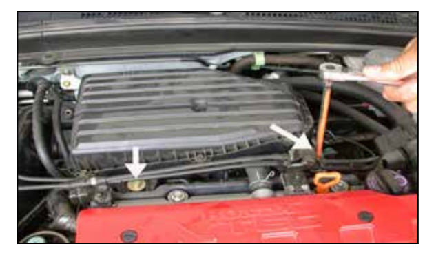
7. Loosen and remove the two bolts that secure the throttle body plenum.