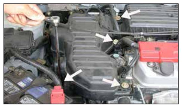
6. Loosen and remove the four bolts that secure the air intake resonator.

8. Loosen the hose clamp that secures the plenum to the throttle body as shown.