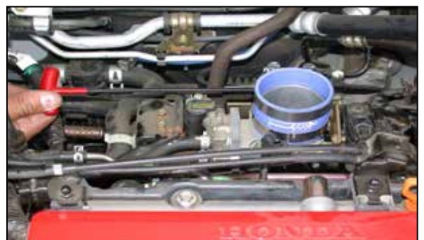
14. Install the silicone hose and hose clamps onto the throttle body. Do not tighten at this time.