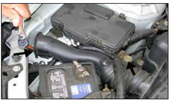
4. Loosen and remove the two bolts that secure the air inlet duct as shown.