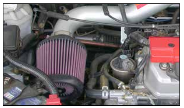
22. Install the K&N<sup>®</sup> air filter onto the K&N<sup>®</sup> intake tube and secure with the provided hose clamp. Adjust for best fit and clearance then tighten all hardware.

NOTE: Drycharger<sup>®</sup> air filter wrap; part # RX-4990DK is available to purchase separately. To learn more about Drycharger<sup>®</sup> filter wraps or look up color availability please visit http://www.knfilters.com<sup>®</sup>.