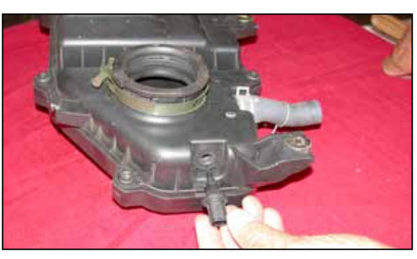
16. Remove the air temperature sensor from the throttle body plenum as shown.