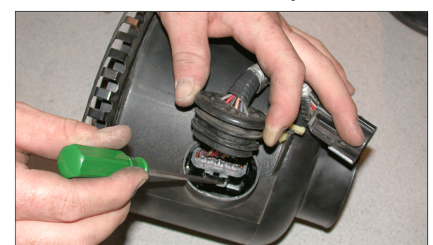
9. Pull the rubber boot back then depress the release tab to disconnect the mass air sensor electrical connection as shown.

NOTE: K&N Engineering, Inc., recommends that customers do not discard factory air intake.