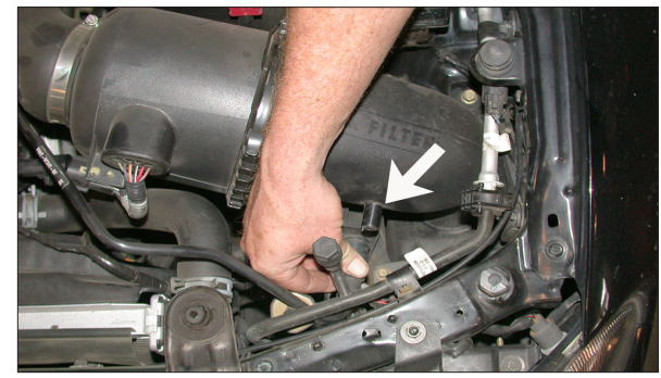
3. Disconnect the crank case vent hose from the stock air cleaner assembly as shown.