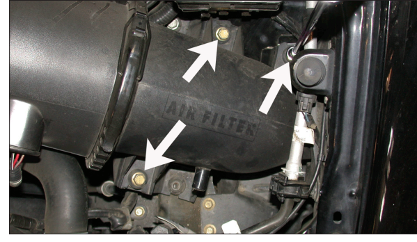
7. Loosen and remove the three bolts that secure the air cleaner assembly as shown.