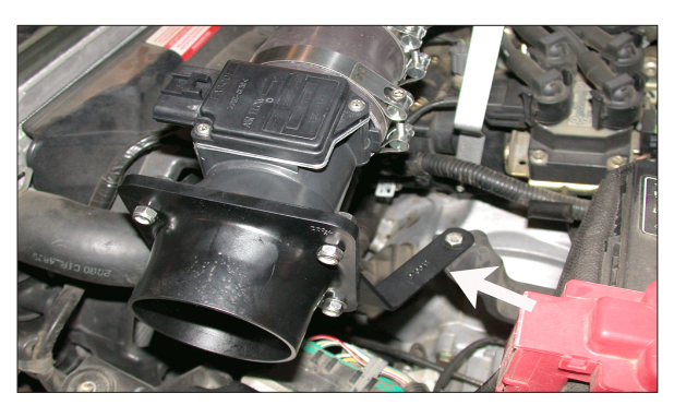
20. Secure the bracket to the battery tray using the provided hardware as shown.