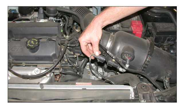
2. Disconnect the secondary mass air sensor electrical connection as shown.

NOTE: Disconnecting the negative battery cable erases pre-programmed electronic memories. Write down all memory settings before disconnecting the negative battery cable. Some radios will require an anti-theft code to be entered after the battery is reconnected. The anti-theft code is typically supplied with your owner's manual. In the event your vehicles' anti-theft code cannot be recovered, contact an authorized dealership to obtain your vehicles anti-theft code.