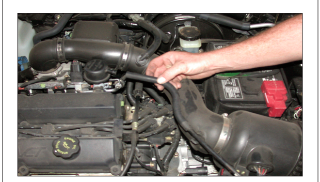
4. Remove the crank case vent hose from the breather on the cam cover as shown.