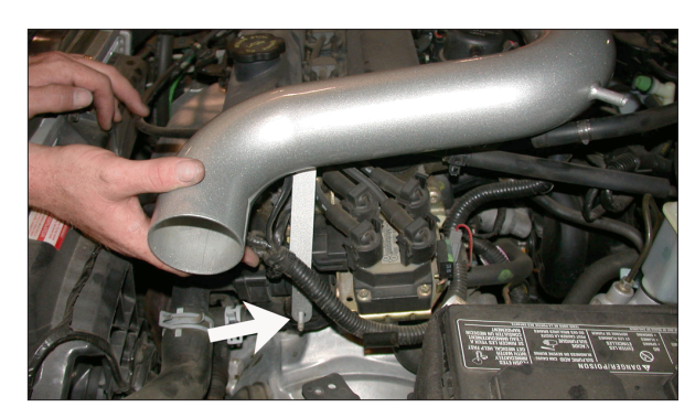
14. Line up the bracket on the tube with the stud on the water neck as shown.