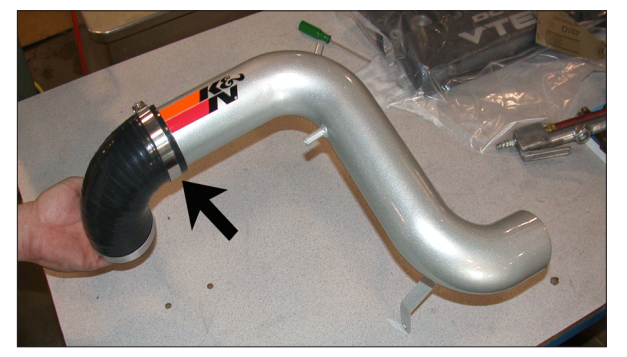
12. Assemble the 90 degree silicone hose and hose clamps onto the intake tube as shown. Due to hood clearance problems, the long end of the silicone hose should be clamped onto the tube. NOTE: Before installing the silicone hose, inspect the inside of the tube for any debris, then clean the inside out with water and a towel. Inspect the tube one more time before proceeding to the next step.