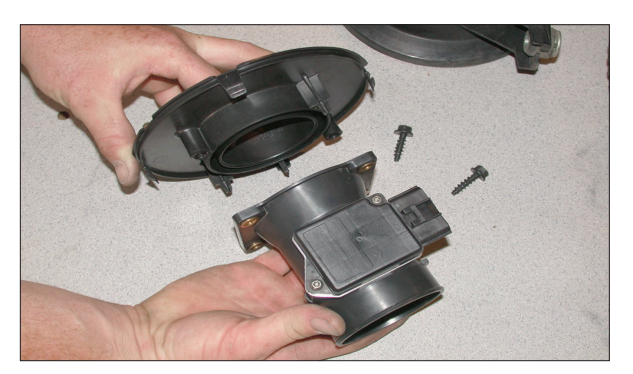
11. Remove the two bolts that secure the mass air sensor, then, remove the mass air sensor as shown.