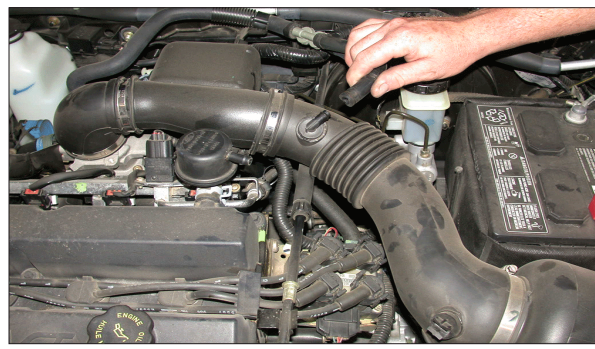
5. Remove the vent hose from the stock intake tube as shown.