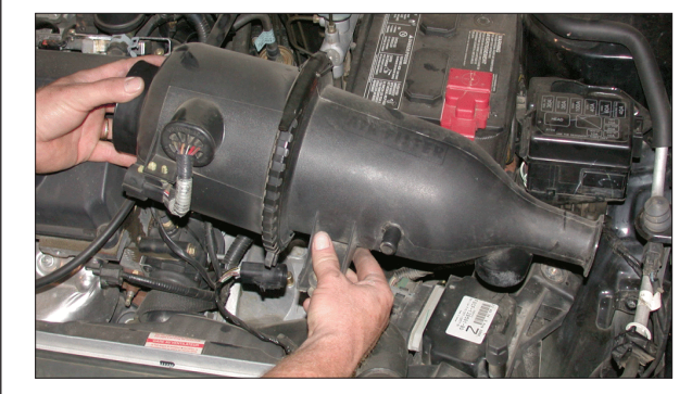
8. Pull firmly upwards to remove the air cleaner assembly as shown.

NOTE: K&N Engineering, Inc., recommends that customers do not discard factory air intake.