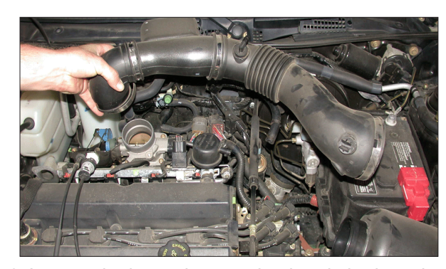
6. Loosen the hose clamp at the throttle body and at the mass air sensor, then, remove the stock intake tube as shown.