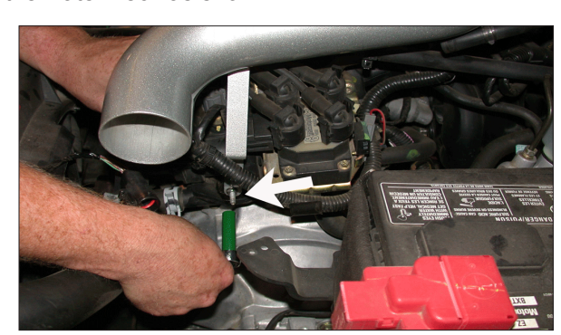
15. Secure the bracket to the stud using the provided washer and hex nut as shown.