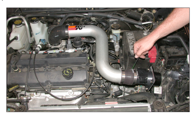
21. Tighten all hose clamps and hardware and adjust for best fit.