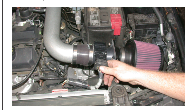
23. Reconnect the secondary and primary mass air electrical connections as shown.