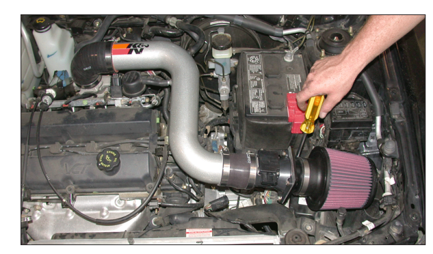
22. Install the air filter and secure with the provided hose clamp as shown.