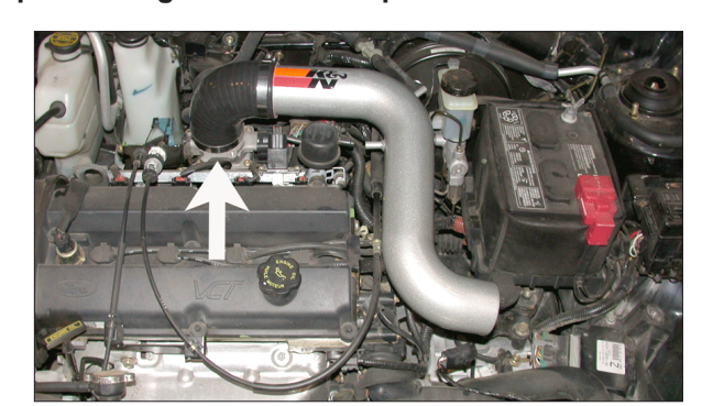
13. Slide the intake tube assembly onto the throttle body as shown, but do not tighten completely at this time.