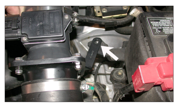
19. Slide the mass air sensor assembly into the silicone step hose, then, line up the bracket with the hole located on the battery tray as shown.