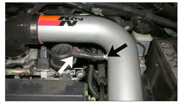
16. Connect the provided hose onto the cam cover vent and to the vent on the intake tube as shown.