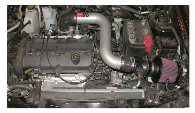
24. Reconnect the vehicle's negative battery cable. Double check to make sure everything is tight and properly positioned before starting the vehicle.