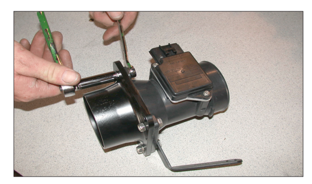
18. Assemble the stock mass air sensor, gasket, mass air adapter, and bracket using the provided hardware as shown.