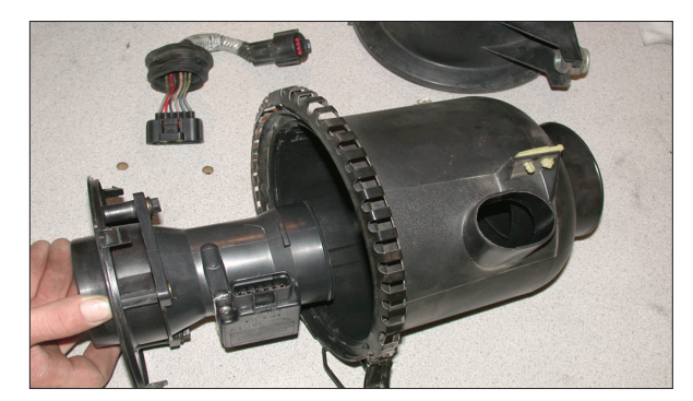
10. Remove the mass air sensor base plate from the air cleaner housing as shown.