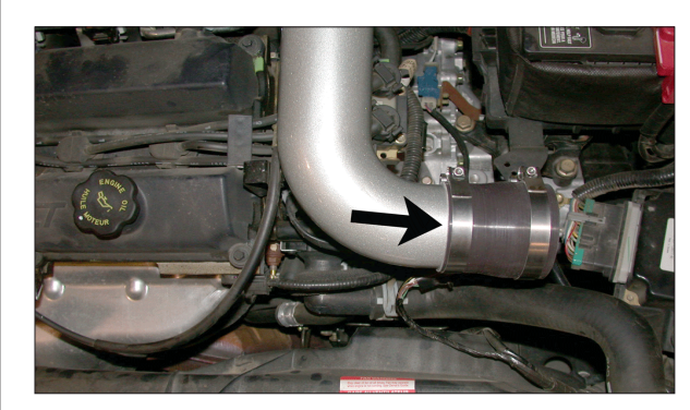
17. Install the silicone step hose and hose clamps onto the intake tube as shown.