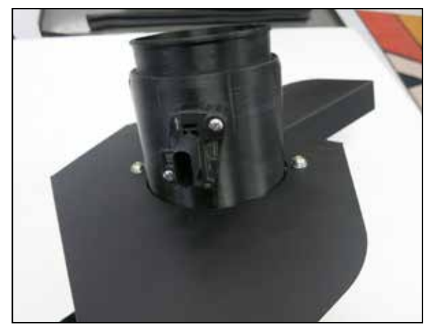
17. Remove the mass air sensor from the factory passenger side housing and then install it into the K&N passenger side housing using the provided hardware.