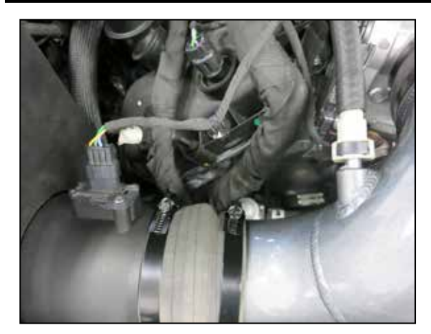
30. Connect the EVAP hose to the fitting on the K&N passenger intake tube. Reconnect the passenger side MAF electrical connection.