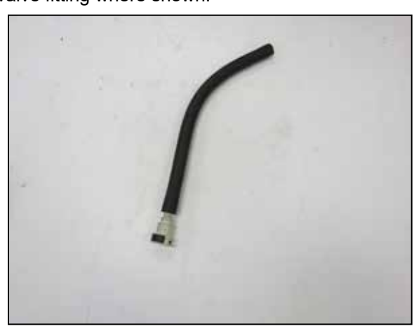
24. Remove the quick connect fitting from the factory EVAP hose and install it into the provided longer EVAP hose.