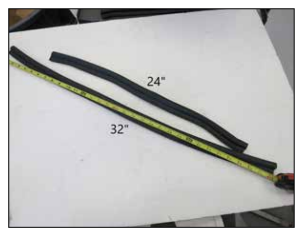
18. Cut the provided 56" edge trim into lengths of 32" and 24" as shown.