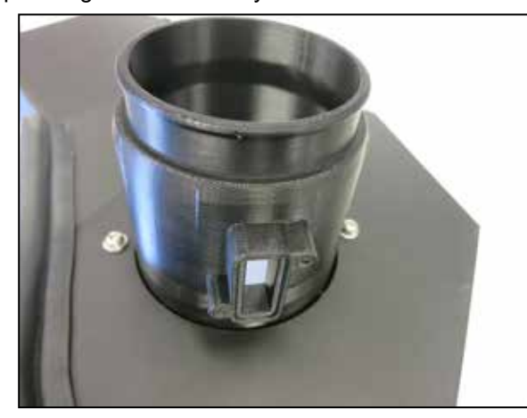
9. Install the K&N MAF housing into the driver side K&N heat shield and secure with the provided hardware.