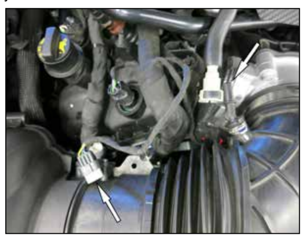
5. Release the locking tab and then disconnect the EVAP hose quick connect fitting from the passenger side intake tube. Release the locking clip and then disconnect the passenger side MAF electrical connection.