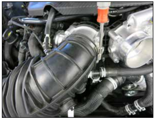
8. Loosen the hose clamp that secures the passenger side intake tube to the throttle body. Disconnect the intake tube from the throttle body, lift the air filter housing to dislodge it from the mounting grommet and then remove the complete passenger side intake system.