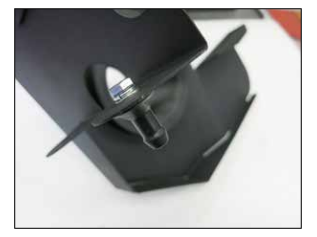
16. Install the remaining mounting stud to the passenger side heat shield using the provided hardware.