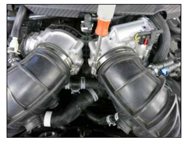
4. Loosen the hose clamp that secures the driver side intake tube to the throttle body. Disconnect the intake tube from the throttle body, lift the air filter housing to dislodge it from the mounting grommet and then remove the complete driver side intake system.