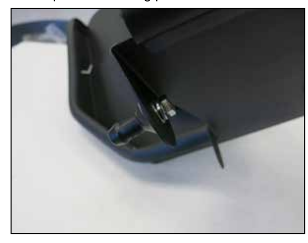
13. Install the provided mounting stud onto the heat shield using the provided hardware.