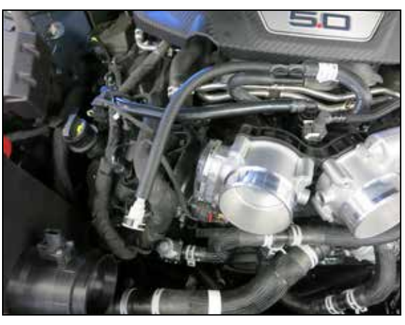
25. Install the longer EVAP hose assembly onto the check valve fitting.