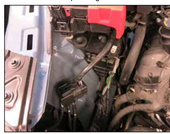
21. Lay the relay loosened in step #8 onto the inner fender as shown.