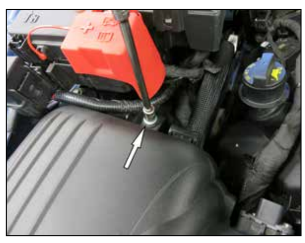
6. Remove the bolt that secures the passenger side air filter housing to the inner fender.