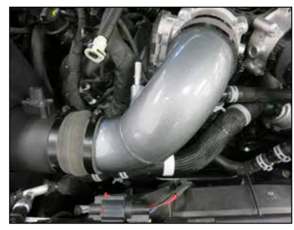
29. Install the K&N passenger side intake tube into the couplers, adjust for best fit and then secure with the provided hose clamps.