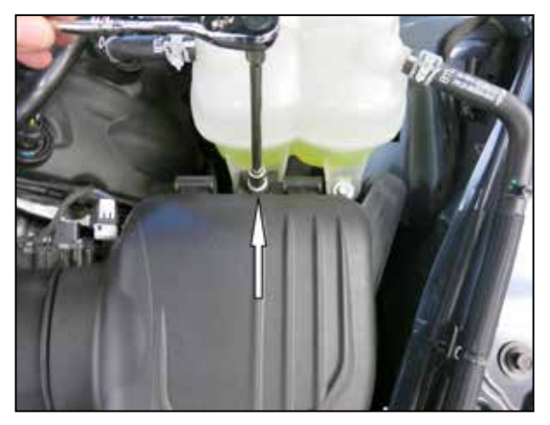
3. Remove the bolt that secures the driver side air filter housing to the inner fender.