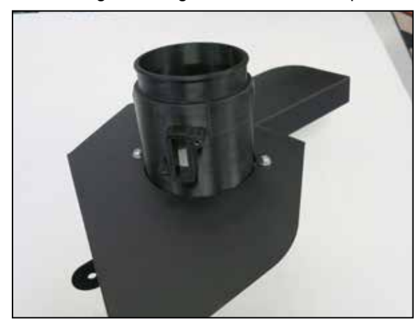
15. Install the remaining K&N MAF housing into the passenger side K&N heat shield and secure with the provided hardware.