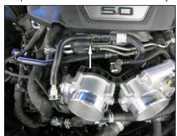
23. Disconnect the EVAP hose from the check valve fitting where shown.