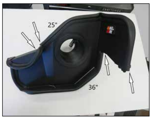
12. Install the cut sections of edge trim onto the heat shield as shown. Install the K&N badge into the heat shield and lock in place from the back side with the provided locking plate.