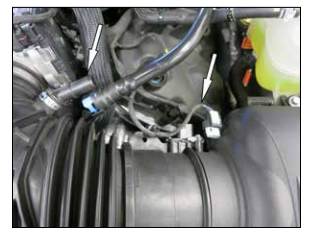
2. Release the locking tab and then disconnect the CCV hose quick connect fitting from the driver side intake tube. Release the locking clip and then disconnect the driver side MAF electrical connection.

NOTE: Disconnecting the negative battery cable erases pre-programmed electronic memories. Write down all memory settings before disconnecting the negative battery cable. Some radios will require an anti-theft code to be entered after the battery is reconnected. The anti-theft code is typically supplied with your owner's manual. In the event your vehicles anti-theft code cannot be recovered, contact an authorized dealership to obtain your vehicles anti-theft code.