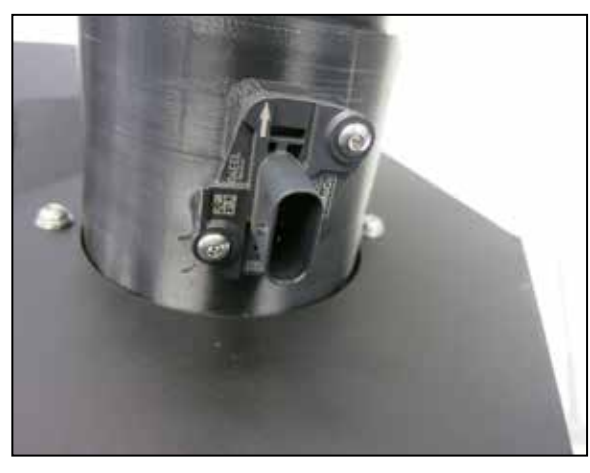
10. Remove the mass air sensor from the factory driver side maf housing and install it into the K&N driver side housing using the provided hardware.