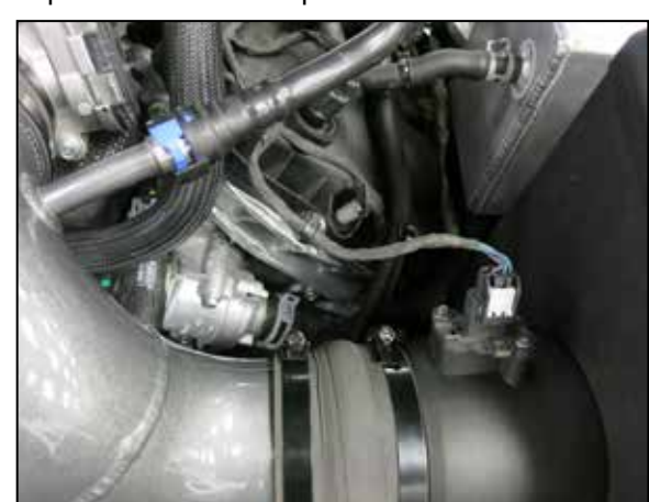
28. Connect the CCV to the fitting on the K&N driver side intake tube. Reconnect the MAF electrical connection.