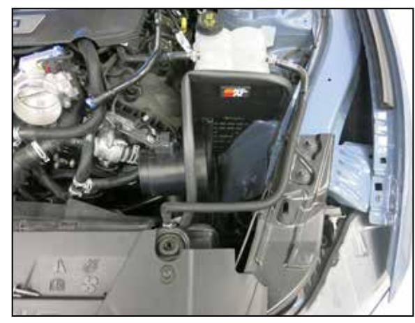
14. Install the heat shield assembly into the driver side so the mounting stud inserts into the factory mounting grommet, then secure with the factory air filter housing mounting bolt removed in step #3.