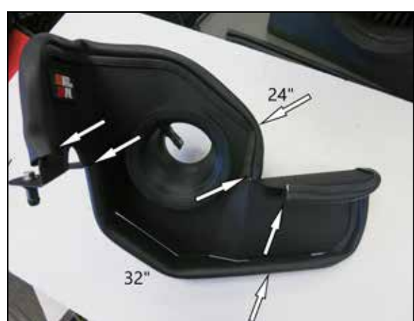
19. Install the edge trim onto the passenger side heat shield as shown. Install the K&N badge into the passenger side heat shield and secure with the provided locking tab.