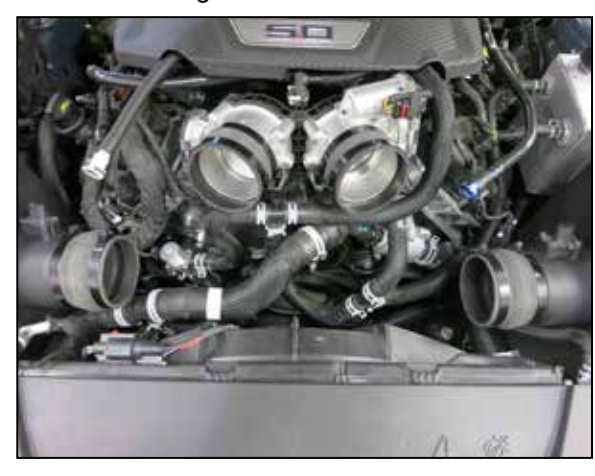
26. Install the straight couplers onto the throttle bodies and secure with the provided clamps. Install the step couplers onto the K&N MAF housings and secure with the provided clamps.