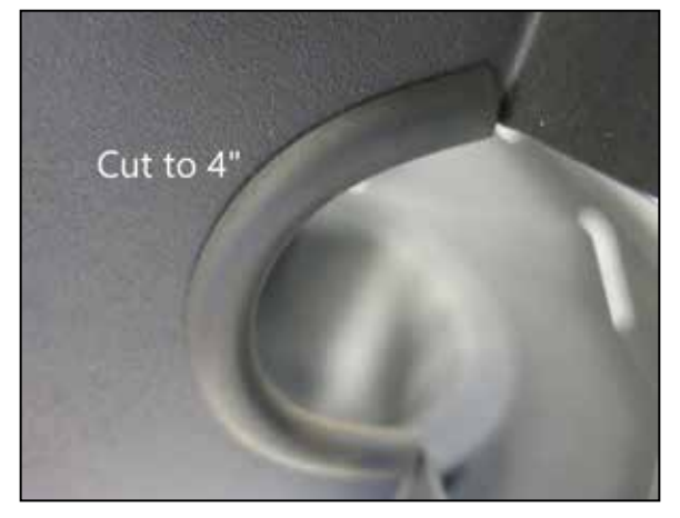
20. Apply a few drops of the provided super glue the inside of 1/16" edge and then install the edge trim as shown to the passenger side heat shield.