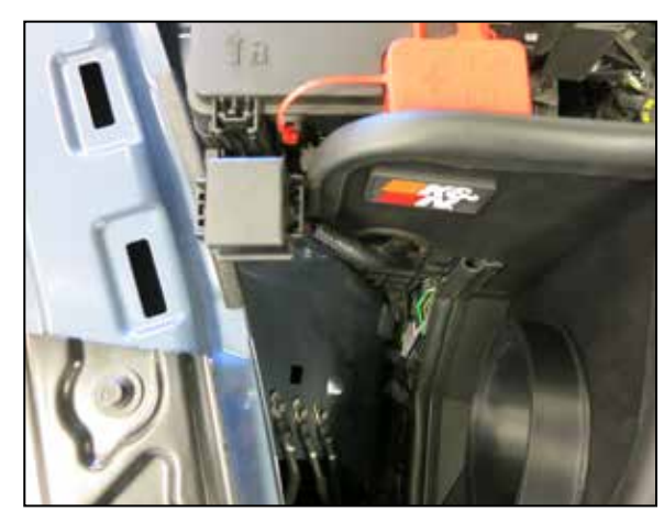
22. Install the K&N passenger side heat shield into the vehicle so the mounting stud inserts the factory mounting grommet and secure with the factory air filter housing mounting bolt. Reinstall the relay onto the factory mount making sure the wiring harness is not pinched between the heat shield and body.