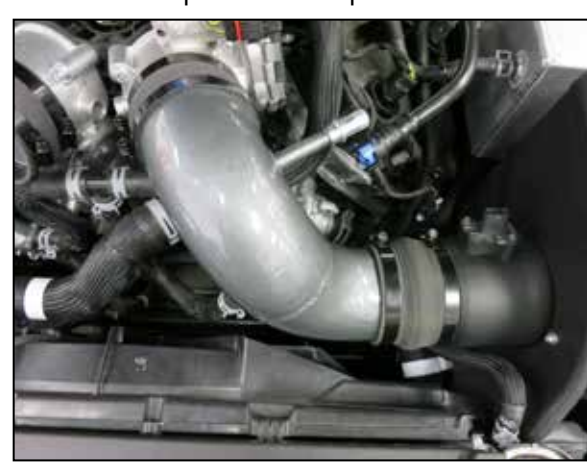
27. Install the K&N driver side intake tube into the couplers, adjust for best fit and then secure with the provided hose clamps.