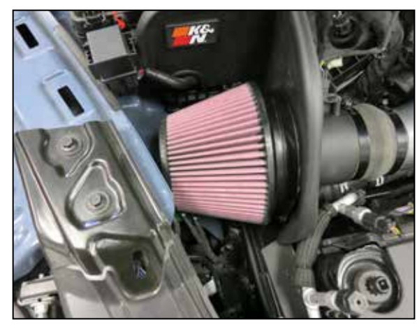
32. Install the passenger side K&N air filter and secure with the provided hose clamp.