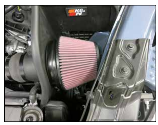
31. Install the driver side K&N air filter and secure with the provided hose clamp.