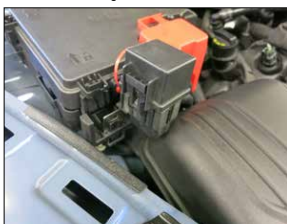
7. Pull back the relay from the fuse box assembly and set aside to allow clearance for air filter housing removal.