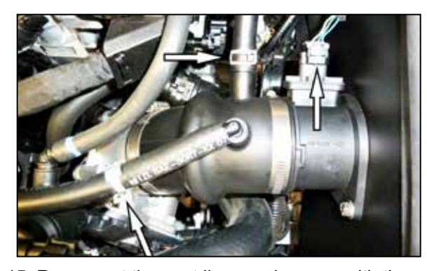
15. Reconnect the vent lines and secure with the factory spring clamps. Reconnect the mass air sensor electrical connection.