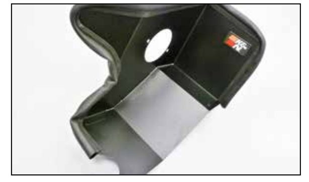
10. Install the edge trim around the heat shield as shown trimming off access. Install the K&N badge into the heat shield and secure with provided locking plate on the back side.