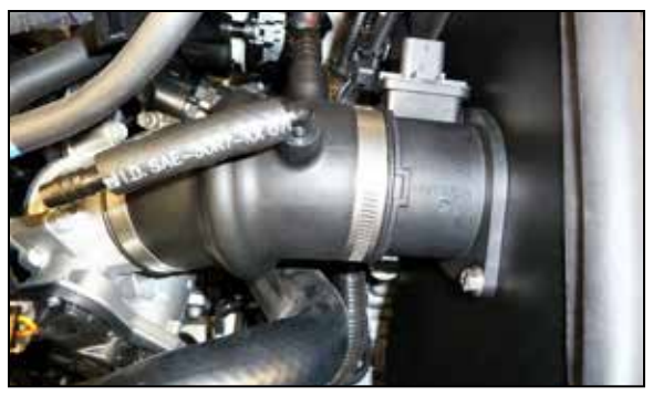
14. Install the hose/maf housing assembly onto the throttle body and into the heat shield. Adjust the maf housing so the holes line up and secure with the provided hardware. Adjust the hose for best fit and then secure with the provided hose clamps.