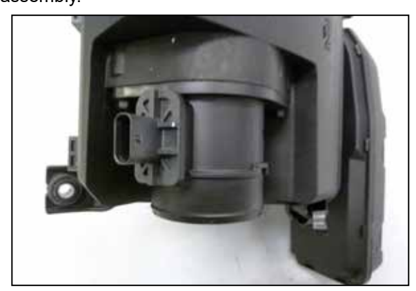
8. Remove the two bolts that secure the mass air sensor to the upper air filter housing and then remove the sensor from the housing.