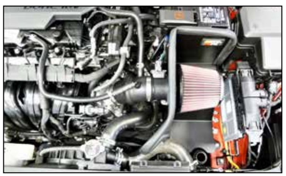
17. Reconnect the vehicle's negative battery cable. Double check to make sure everything is tight and properly positioned before starting the vehicle.

18. It will be necessary for all K&N® high flow intake systems to be checked periodically for realignment, clearance and tightening of all connections. Failure to follow the above instructions or proper maintenance may void warranty.