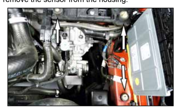
9. Install the three rubber mounted studs in the places shown.