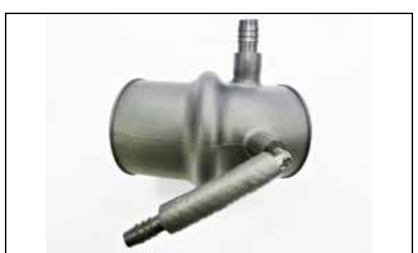
12. Assemble the K&N intake hose assembly and vents as shown.