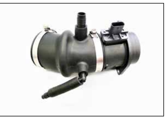
13. Install the factory mass air sensor into the K&N hose as shown but don't tighten the clamp.