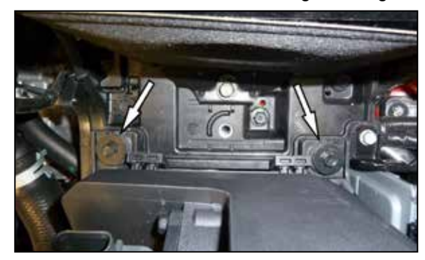
7. Remove the two rear air filter housing mounting bolts and then remove the complete intake assembly.