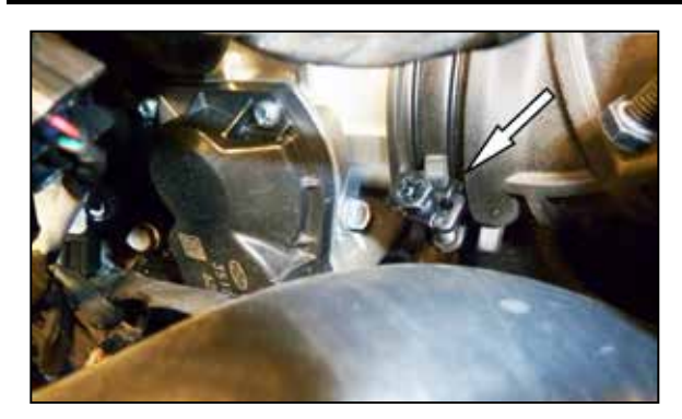
4. Loosen the hose clamp that secures the factory intake tube to the throttle body.