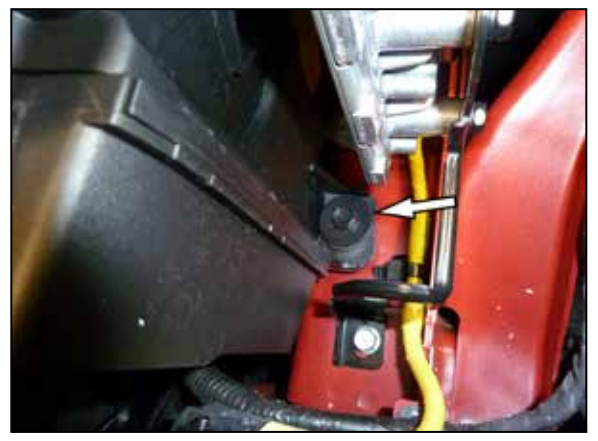
6. Remove the lower air filter housing retaining bolt