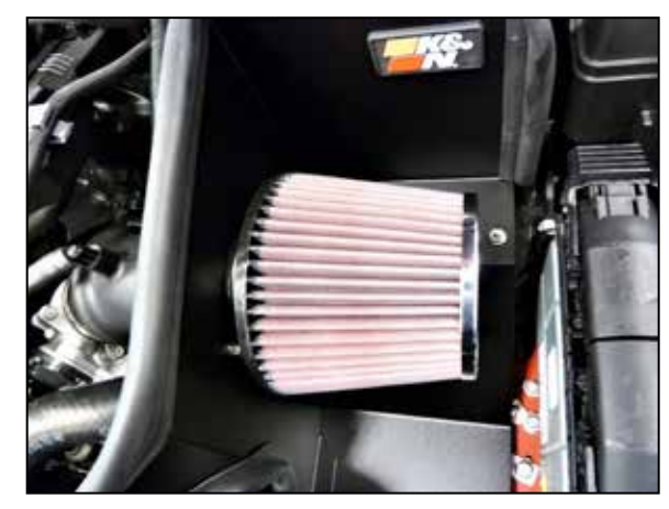
16. Install the K&N air filter onto the mass air sensor and secure with the provided hose clamp.