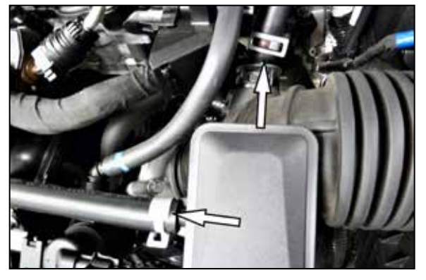
3. Release the two spring clamps that secure the vent hoses and then disconnect the vent hoses from the intake system.