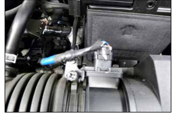
2. Disconnect the mass air sensor electrical connection.

NOTE: Disconnecting the negative battery cable erases pre-programmed electronic memories. Write down all memory settings before disconnecting the negative battery cable. Some radios will require an anti-theft code to be entered after the battery is reconnected. The anti-theft code is typically supplied with your owner's manual. In the event your vehicles anti-theft code cannot be recovered, contact an authorized dealership to obtain your vehicles anti-theft code.