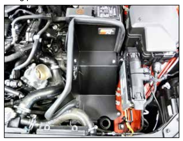
11. Install the heat shield assembly onto the rubber mounted studs and secure with the provided hardware.