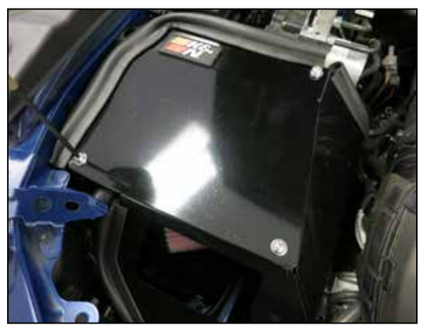
25. Install the lid onto the heat shield and secure with the provided hardware.