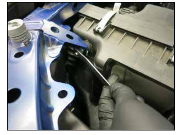
5. Remove the nut the secures the vibration damper to the core support. This nut will be reused in a later step.