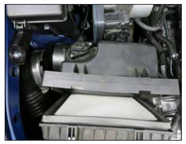
6. Loosen the hose clamp that secures the intake tube to the air filter housing and disconnect the hose. Release the two retaining clips and then remove the housing half and factory air filter.