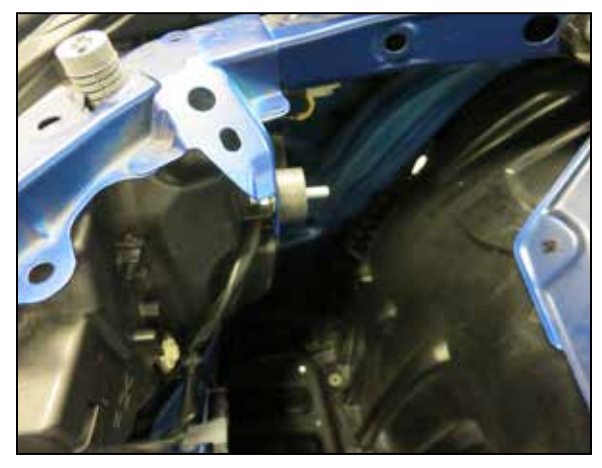
11. Install the provided vibration damper onto the factory air filter housing mounting location using the factory nut.

10. Remove the entire stock intake tube.