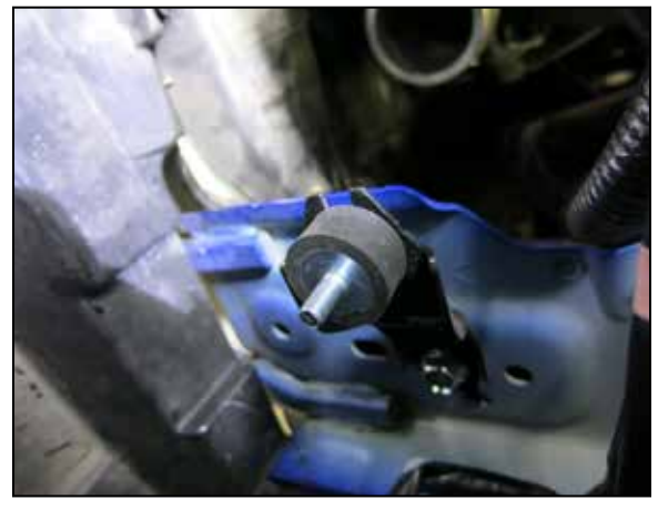
12. Install the provided vibration damper onto the factory intake tube mounting location using the factory nut.