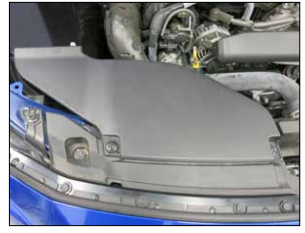
26. Reinstall the fresh air duct and secure with the factory mounting pins.