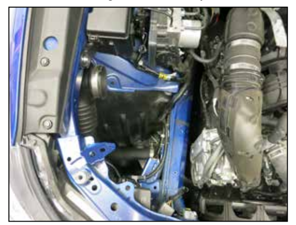
7. Remove the remaining air filter housing half from the engine compartment.