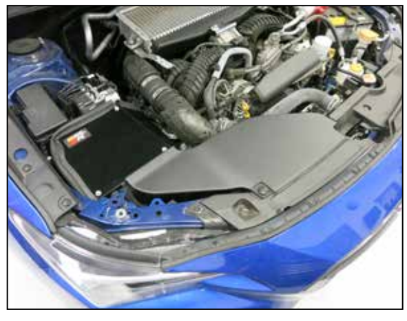
27. Reconnect the vehicle's negative battery cable. Double check to make sure everything is tight and properly positioned before starting the vehicle.

28. It will be necessary for all K&N<sup>®</sup> high flow intake systems to be checked periodically for realignment, clearance and tightening of all connections. Failure to follow the above instructions or proper maintenance may void warranty.