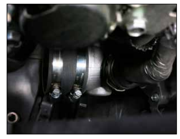
15. Install the provided coupler onto the turbo inlet along with the provided hose clamps. Do not tighten the clamps.