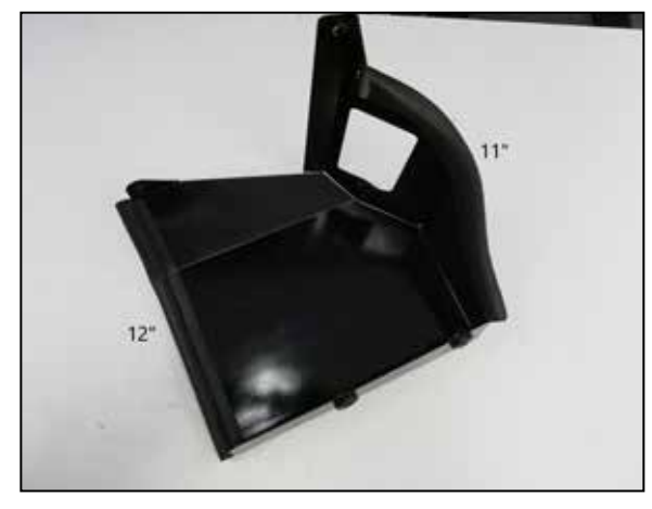
21. Cut the provided edge trim into lengths of 11", 12" and 15". Install the 11" and 12" onto the heat shield as shown.