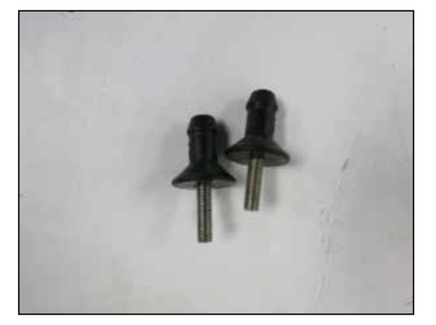
19. Install the provided m6 studs into the provided mounting posts.