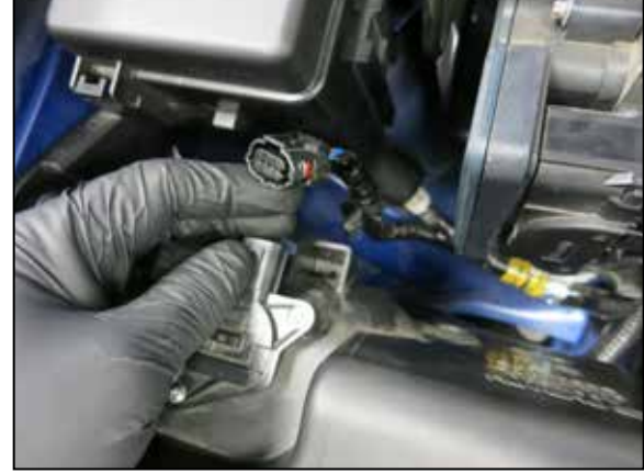
3. Disconnect the mass air sensor electrical connection and unhook the wiring harness from the air filter assembly.

2. Remove the two push clips that secure the fresh air intake duct and then remove the intake duct from the vehicle.