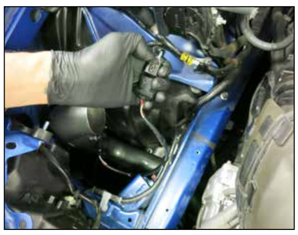
16. Install the K&N intake tube into the coupler at the turbo and align the mounting bracket with the vibration damper. Connect the provided extension harness to the mass air sensor and then connect the other end to the factory harness.