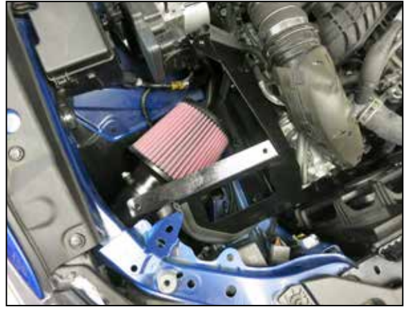
22. Install the mounting posts into the factory air filter housing mounting locations on the inner fender, then install the K&N heat shield onto the poste