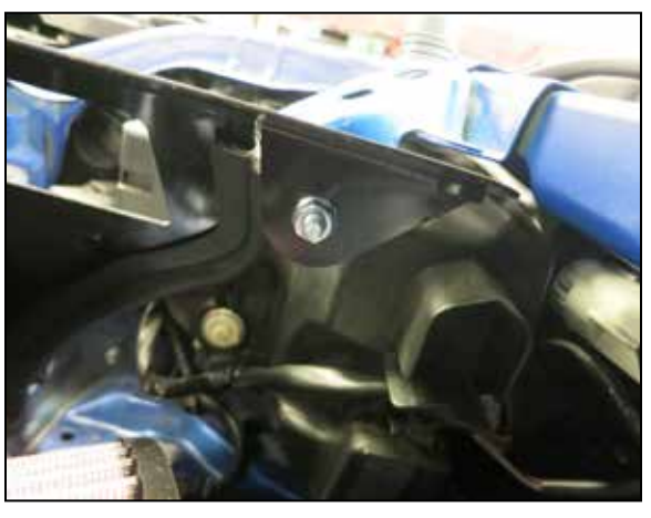
23. Secure the heat shield to the vibration damper using the factory nut.