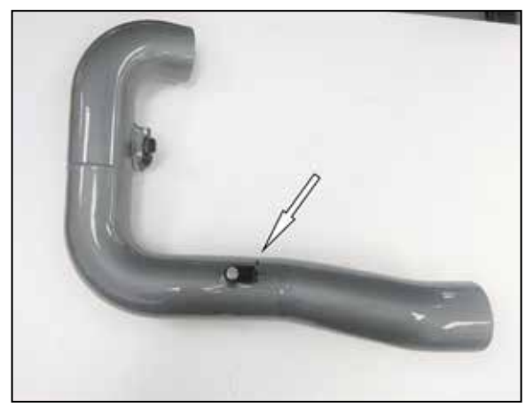
14. Install the provided mounting bracket onto the intake tube as shown using the provided hardware.