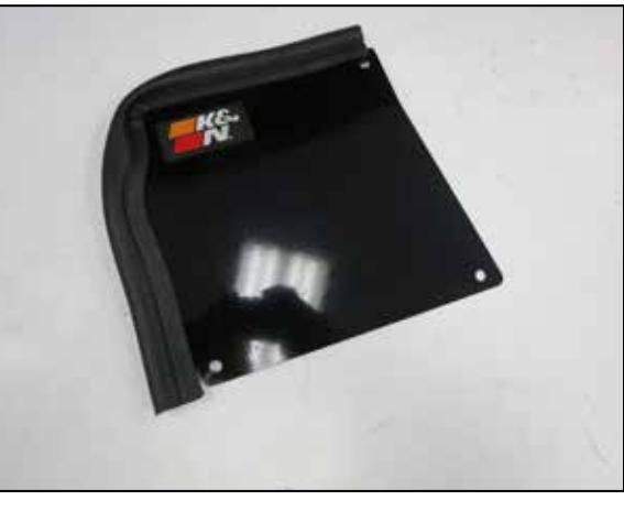
24. Install the remaining 15" edge trim onto the lid as shown. Install the K&N badge and secure with the backing plate.