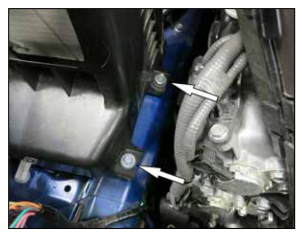
4. Loosen and remove the two bolts that secure the factory air filter housing to the inner fender.