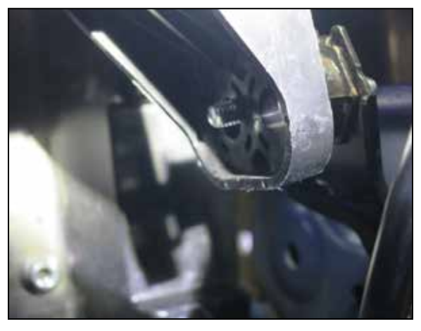
9. Remove the nut that secures the intake tube to the vibration damper. This nut will be reused in a later step.