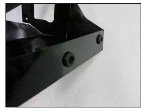
20. Install the provided grommets into the base of the heat shield as shown.