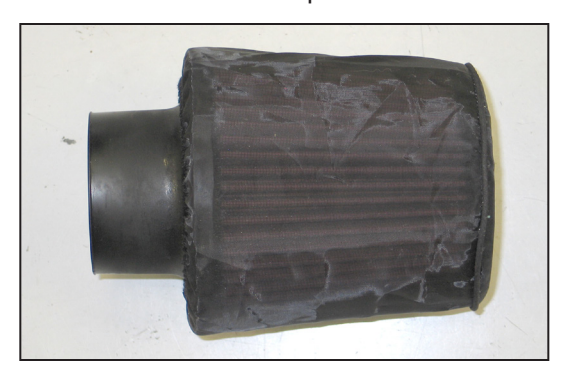
14. Install the K&N® Drycharger® onto the K&N® air filter as shown.

NOTE: Please be aware the Drycharger® is water repellent, not water proof. Depending on conditions and usage the water repellent treatment is good for 1 to 2 years. See the parts list to reorder a new Drycharger® if necessary.