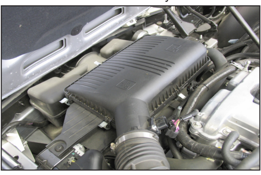
6. Release the six upper airbox mounting clips.