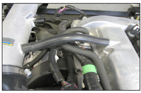
21. Install the supplied crankcase vent hose onto the valve cover and onto the intake tube as shown. NOTE: Some trimming of the hose may be necessary.