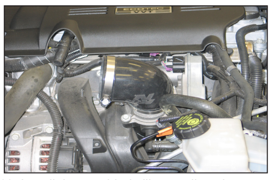
16. Install the provided silicone elbow hose onto the throttle body and secure with provided hose clamp.