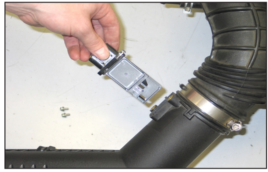
12. Remove the two screws securing the mass air sensor to the stock intake tube and then remove the mass air sensor as shown.