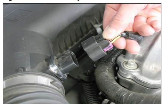
3. Depress the locking tab and then disconnect the mass air sensor electrical connection.