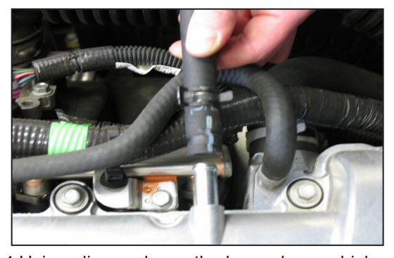
4.Using pliers, release the hose clamp which secures the crankcase vent hose to the valve cover and then remove the crankcase vent hose from the valve cover as shown.