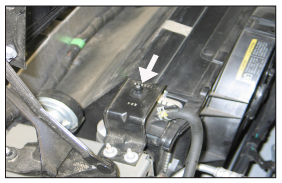
11. Remove the left lower airbox mounting studs shown from the bracket.