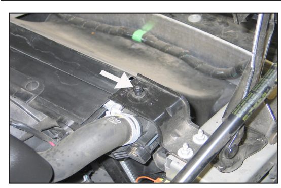
10. Remove the right lower airbox mounting studs shown from the bracket.