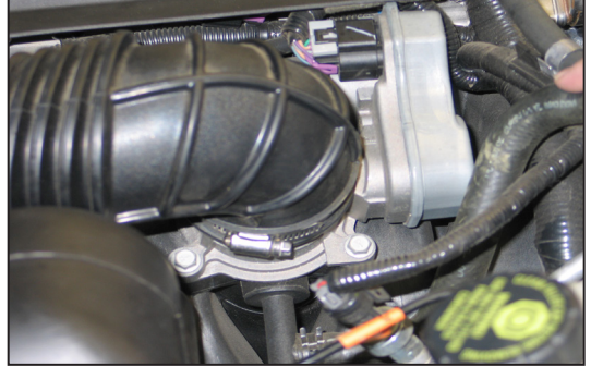
5. Loosen the hose clamp which secures the stock intake tube to the throttle body.