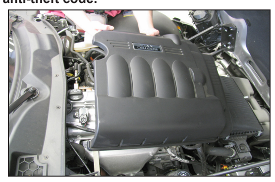
2. Lift firmly on the engine cover to dislodge it from the mounting grommets and then remove the engine cover assembly.

NOTE: Disconnecting the negative battery cable erases pre-programmed electronic memories. Write down all memory settings before disconnecting the negative battery cable. Some radios will require an anti-theft code to be entered after the battery is reconnected. The anti-theft code is typically supplied with your owner's manual. In the event your vehicles' anti-theft code cannot be recovered, contact an authorized dealership to obtain your vehicles anti-theft code.