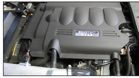
23. Reinstall the engine cover