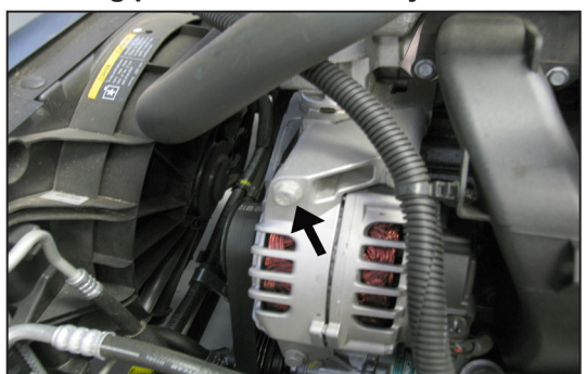
18. Remove the upper alternator mounting bolt. NOTE: This bolt will be reused in the next step.

NOTE: It will be necessary to use the provided spacers between the heat shield and airbox mounting points on Saturn Sky vehicles.