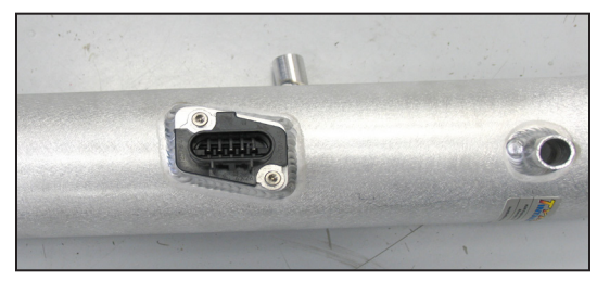
13. Install the mass air sensor into the K&N® intake tube and secure with the provided screws.