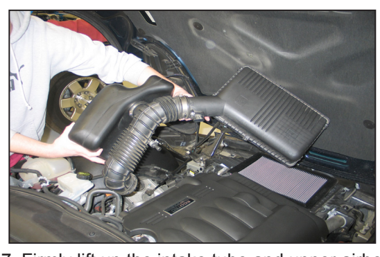
7. Firmly lift up the intake tube and upper airbox to release it from the mounting grommets and then remove the assembly from the vehicle.