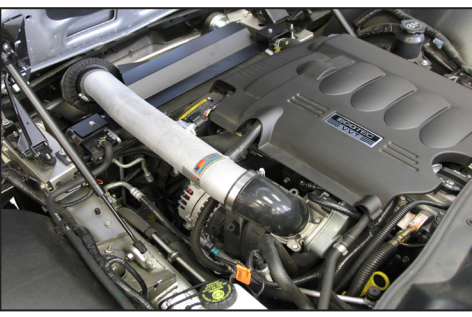
24. Reconnect the vehicle's negative battery cable. Double check to make sure everything is tight and properly positioned before starting the vehicle.