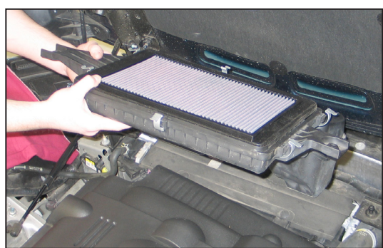
9. Pull up firmly to release the lower airbox housing from the mounting grommets and then remove the lower airbox from the vehicle.

NOTE: K&N Engineering, Inc., recommends that customers do not discard factory air intake.