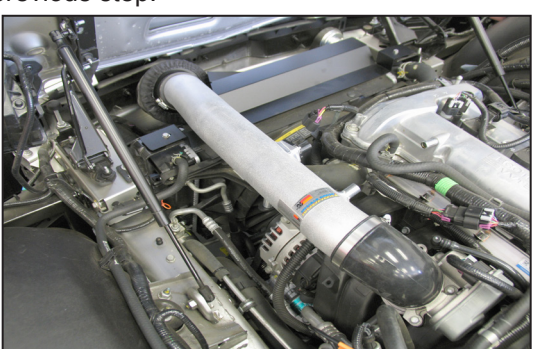
20. Install the K&N® intake tube assembly into the silicone hose at the throttle body and align with the mounting bracket installed in the previous step. Secure the tube with the hose clamp and hardware provided.