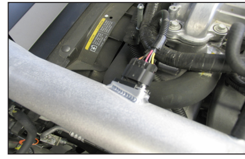
22. Connect the mass air sensor electrical connection.