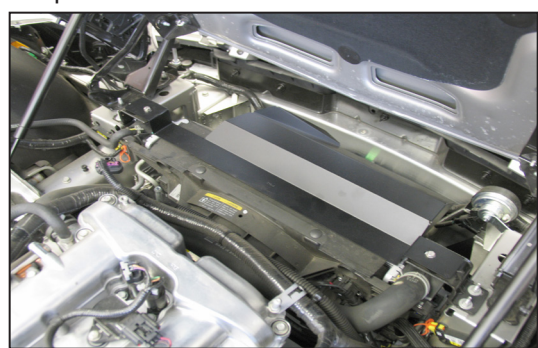
17. Install the heat shield assembly and secure to the airbox mounting points, then secure with the provided hardware.

NOTE: It will be necessary to use the provided spacers between the heat shield and airbox mounting points on Saturn Sky vehicles.