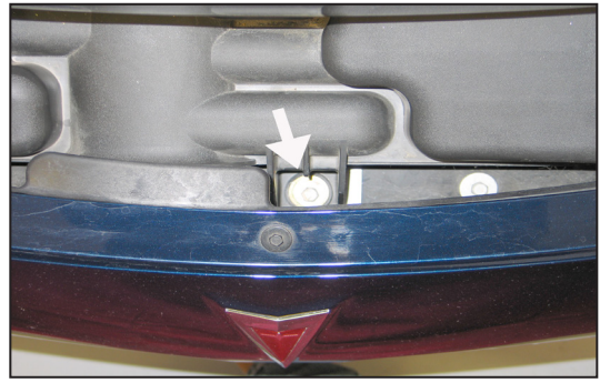
8. Remove the front lower airbox mounting bolt shown.