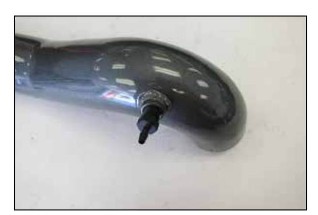
12. Install the 1/4" NPT vacuum fitting into the K&N intake tube as shown. NOTE: Plastic NPT fittings are easy to cross thread. Install the vent fitting "hand" tight, then turn it two complete turns with a wrench.