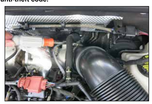
2. Loosen the hose clamp that secures the stock intake tube to the turbo inlet.

NOTE: Disconnecting the negative battery cable erases pre-programmed electronic memories. Write down all memory settings before disconnecting the negative battery cable. Some radios will require an anti-theft code to be entered after the battery is reconnected. The anti-theft code is typically supplied with your owner's manual. In the event your vehicles anti-theft code cannot be recovered, contact an authorized dealership to obtain your vehicles anti-theft code.