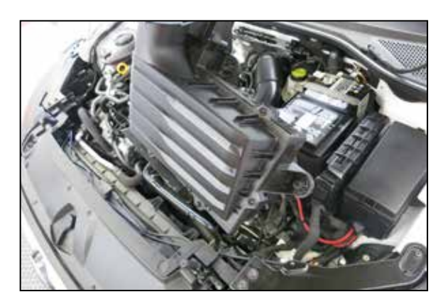
6. Remove the factory air filter housing from the vehicle.