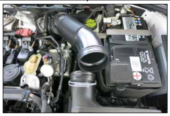
3. Release the spring clamp that secures the stock intake tube to the air filter housing and disconnect the tube from the housing.