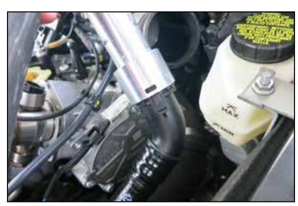
15. Connect the BOV hose to the fitting on the K&N intake tube.