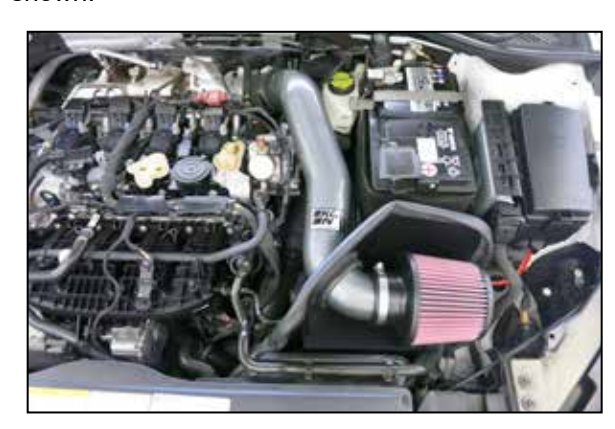
20. Reconnect the negative battery cable.