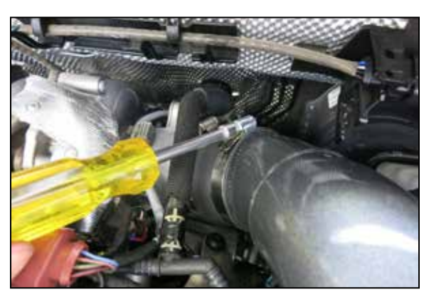
16. Insert the intake tube through the heat shield and into the coupler at the turbo, adjust for best fit and secure with the provided hose clamp.