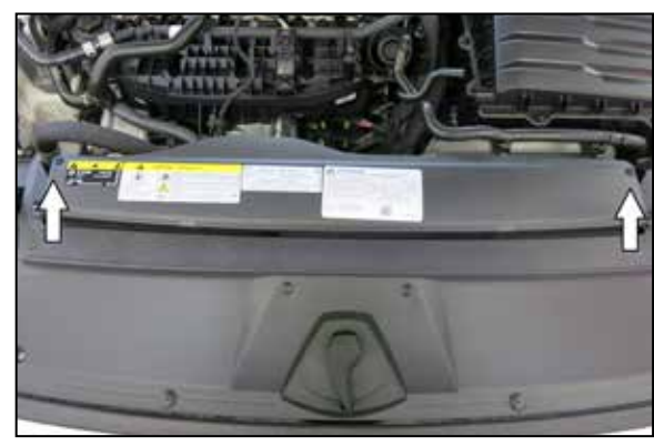
5. Remove the two screws that secure the fresh air inlet and then remove the fresh air inlet from the vehicle.