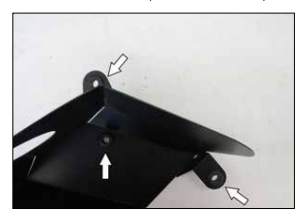
9. Install the provided grommets into the heat shield as shown.