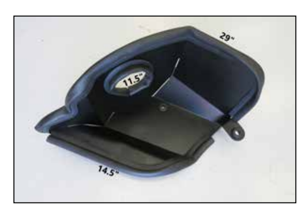
11. Install the edge trim onto the heat shield as shown.