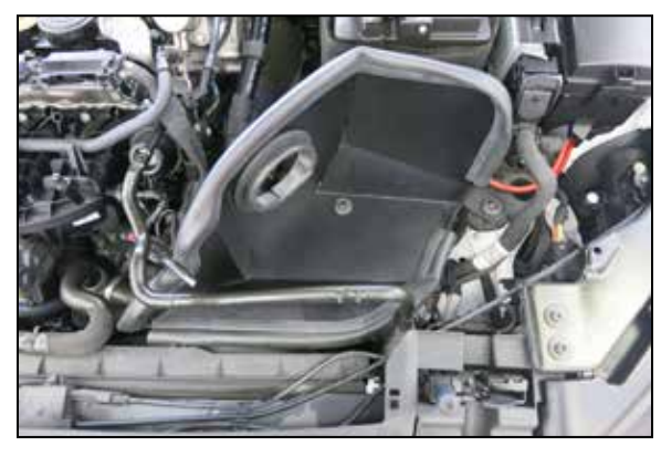
13. Set the heat shield into the vehicle so the mounting studs insert into the mounting grommets.