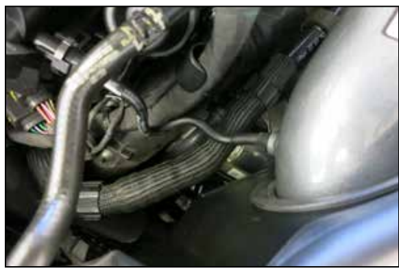
17. Connect the vacuum line to the fitting installed into the K&N intake tube.