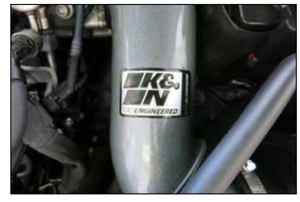
19. Install the K&N decal onto the intake tube as shown.