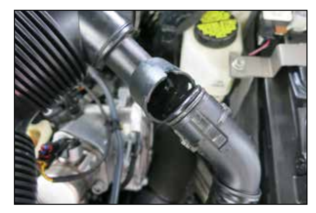
7. Depress the locking clips and disconnect the BOV hose from the intake tube and remove the intake tube from the vehicle.