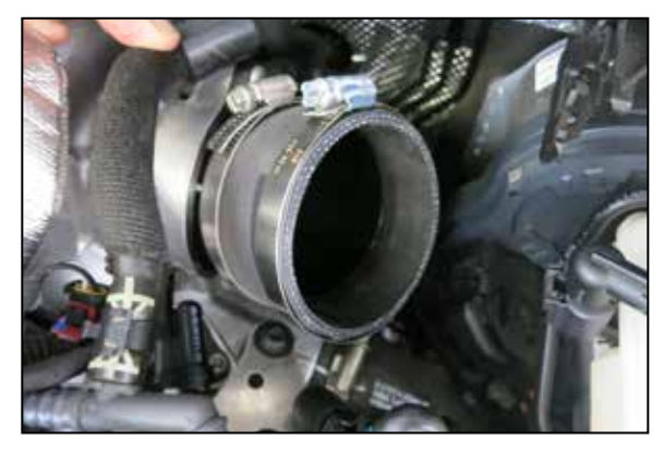
8. Install the provided step coupler onto the turbo inlet and secure with the provided hose clamp.