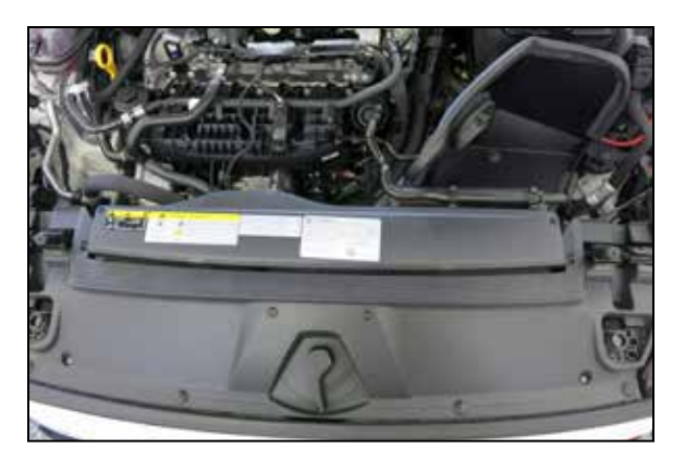
14. Reinstall the fresh air inlet and secure with the factory hardware.