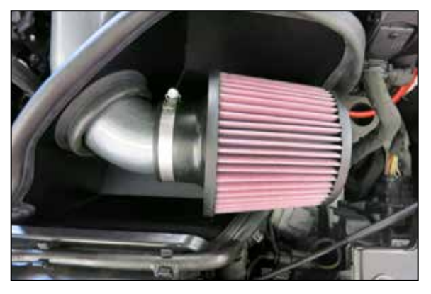
18. Install the air filter onto the intake tube and secure with the provided hose clamp.