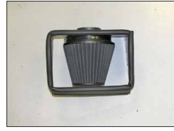
10. Install the air filter onto the filter adapter and secure with the provided hose clamp.

NOTE: It will be necessary to trim the edge trim.