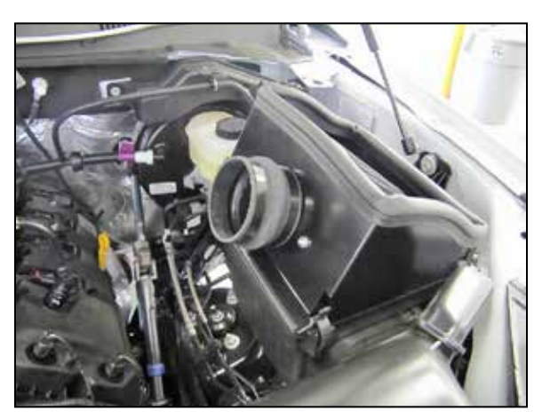
12. Install the provided coupling hump hose (08699) onto the filter adapter and secure with the provided hose clamp.