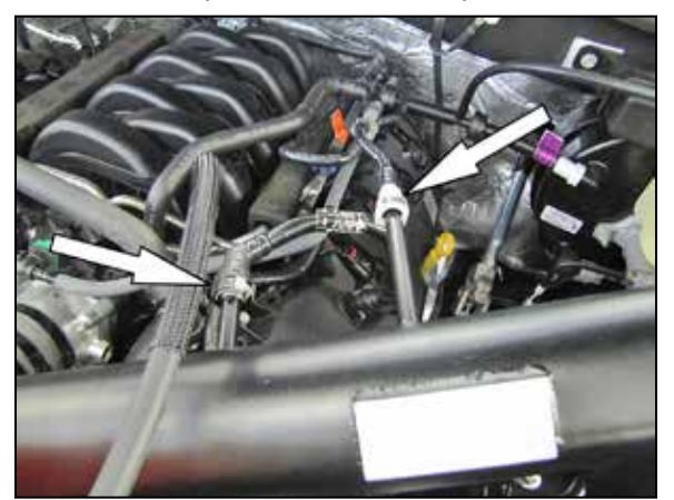
15. Connect the factory EVAP and Crank case vent lines to the fittings on the K8 N<sup>®</sup> intoke tube

14. Install the K&N<sup>®</sup> intake into the coupling hose at the filter adapter and then into the hose at the throttle body, adjust the tube for best fit and then secure with the provided hose clamps.