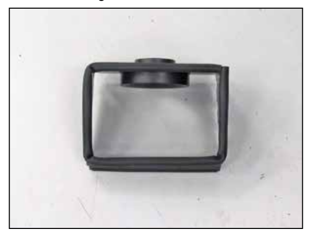
9. Install the provided large edge trim onto the top of the heat shield as shown.

NOTE: It will be necessary to trim the edge trim.