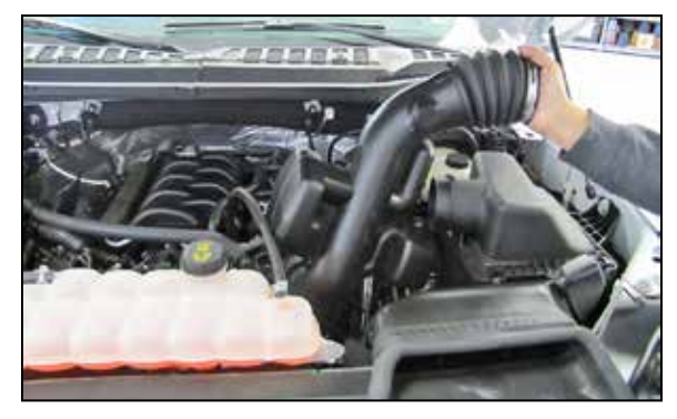
4. Unhook the coolant line from the intake tube and then remove the intake tube from the vehicle. NOTE: K&N Engineering, Inc., recommends that customers do not discard factory air intake.

3. Loosen the hose clamps at the throttle body and filter inlet that secure the factory intake tube.