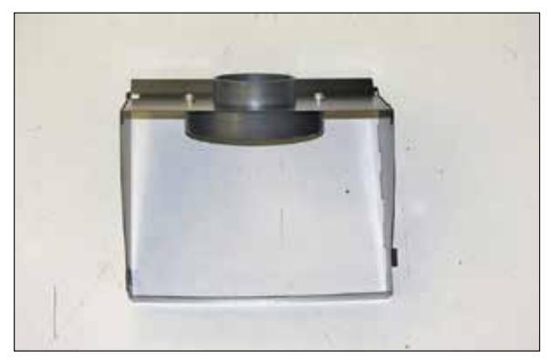
6. Install the filter adapter into the K&N<sup>®</sup> heat shield and secure with provided hardware.

5. Release the two clips securing the upper air filter housing and then remove the upper filter housing and stock air filter.