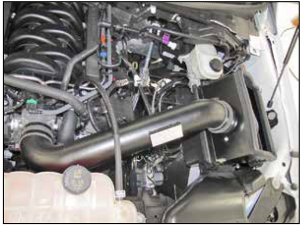
16. Reconnect the vehicle's negative battery cable. Double check to make sure everything is tight and properly positioned before starting the vehicle.

17. The C.A.R.B. exemption sticker, (attached), must be visible under the hood so that an emissions inspector can see it when the vehicle is required to be tested for emissions. California requires testing every two years, other states may vary.