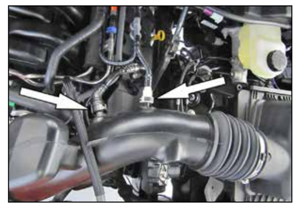
2. Disconnect the EVAP vent connection and crank case vent connection.

3. Loosen the hose clamps at the throttle body and filter inlet that secure the factory intake tube.