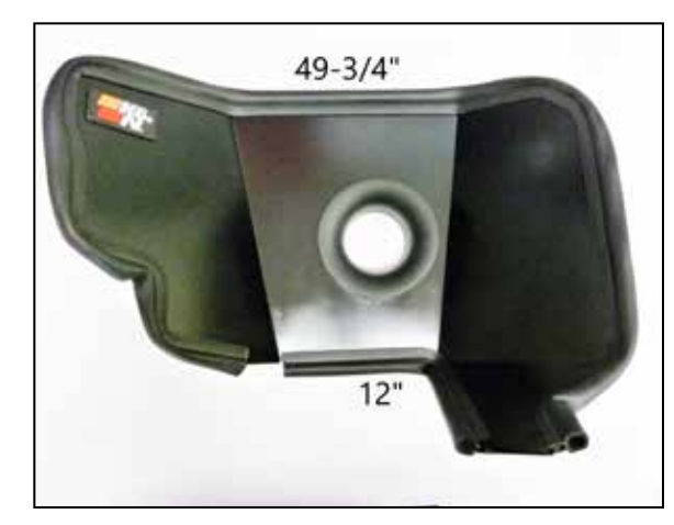
12. Cut the 66"L edge trim to lengths of 12" and 49.75", install the edge trim onto the driver side heat shield as shown.