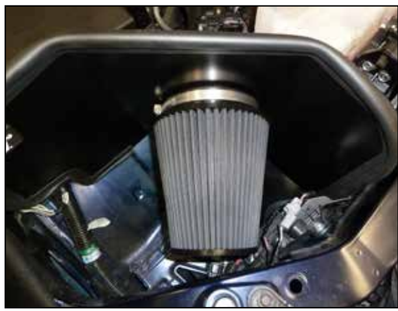
24. Install the K&N air filters onto the filter adapters and secure with the provided hose clamp.