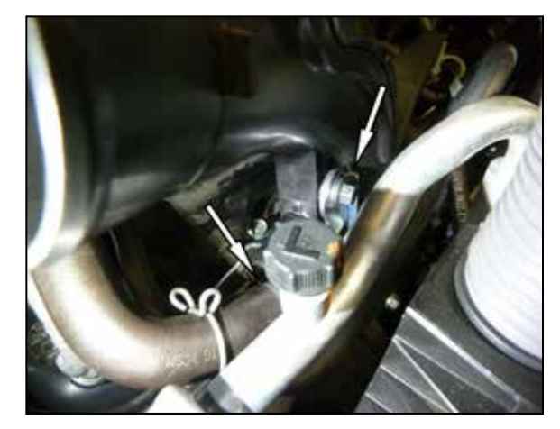
6. Disconnect the PCV hose from the driver side lower intake tube, Remove the intake tube mounting bolt then loosen the hose clamp securing the intake tube to the turbo inlet and remove the tube from the vehicle.