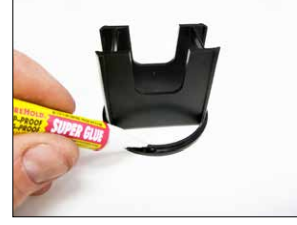
17. Apply four drops of the provided super glue to the air straighteners as shown.