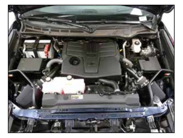
25. Reconnect the vehicle's negative battery cable. Double check to make sure everything is tight and properly positioned before starting the vehicle.

26. It will be necessary for all K&N<sup>®</sup> high flow intake systems to be checked periodically for realignment, clearance and tightening of all connections. Failure to follow the above instructions or proper maintenance may void warranty.