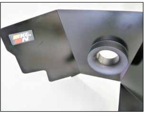
10. Install the filter adapters and K&N badges onto the heat shields using the provided hardware.