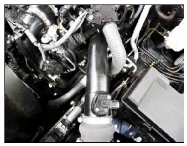
19. Install the driver side intake tube into the couplers, adjust the tube for best fit and then provided hose clamp cure with the