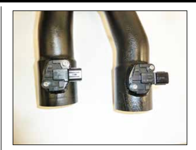
16. Remove the mass air sensors from the factory housings and install them into the K&N intake tubes using the provided hardware.