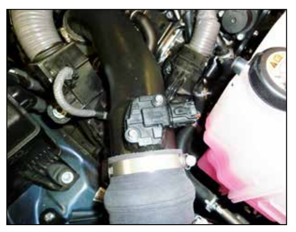
23. Reconnect the mass air sensor electrical connections.

15. Install the provided hump couplers onto the filter adapters and secure with the provided hose clamp.