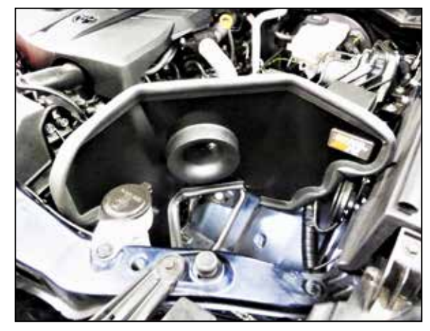
13. Install the driver side heat shield assembly and secure with the provided hardware.