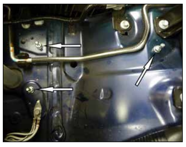
8. Remove the three air filter housing mounting studs from both the left and right sides.