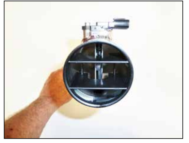
18. Install the air straighteners into the K&N intake tubes so that the blades are aligned as shown in relation to the mass air sensor.