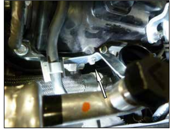
7. Remove the bolt that secures the driver side intake tube mounting bracket and then remove the bracket from the vehicle.