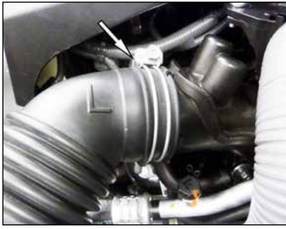
4. Loosen the hose clamps that secure the factory upper intake tubes to the turbo inlet manifolds and then remove the upper housings, intake tubes and filters.