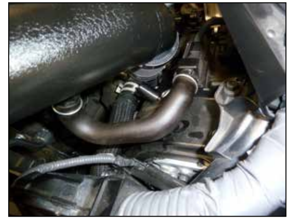
22. Connect the passenger side PCV hose to the fitting installed into the intake tube and secure with the factory spring clamp.