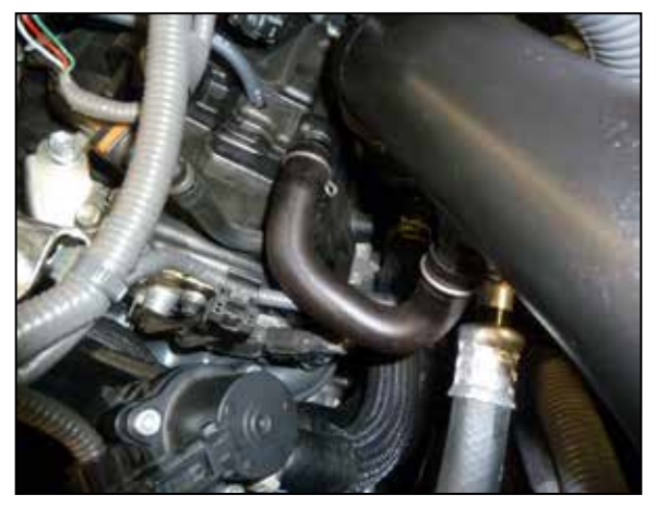
21. Connect the driver side PCV hose to the fitting installed into the intake tube and secure with the factory spring clamp.