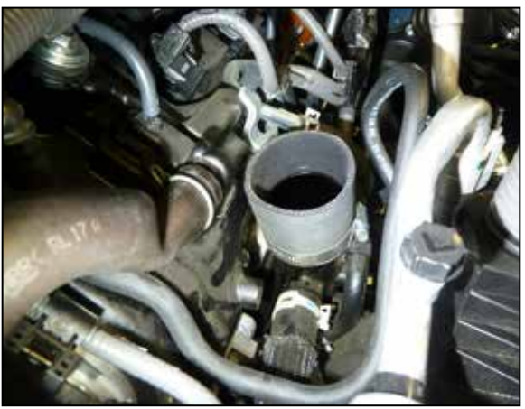
9. Install the provided couplers onto the turbo inlets and secure with the provided hose clamps.