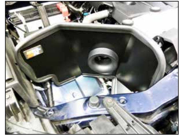
14. Install the passenger side heat shield assembly and secure with the provided hardware.