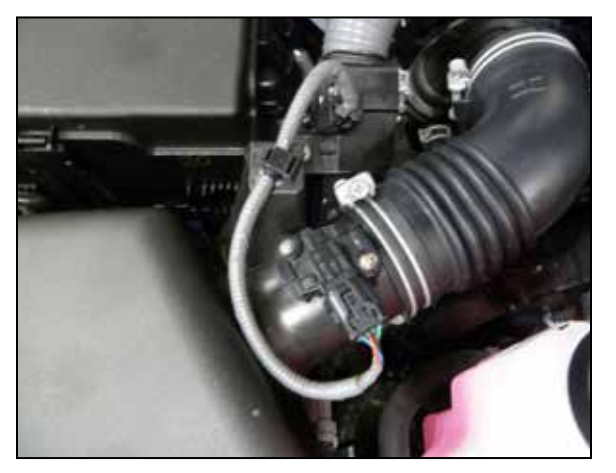
2. Disconnect the passenger and driver side mass air sensor electrical connection and unhook the harness's mounting clips.

NOTE: Disconnecting the negative battery cable erases pre-programmed electronic memories. Write down all memory settings before disconnecting the negative battery cable. Some radios will require an anti-theft code to be entered after the battery is reconnected. The anti-theft code is typically supplied with your owner's manual. In the event your vehicles anti-theft code cannot be recovered, contact an authorized dealership to obtain your vehicles anti-theft code.