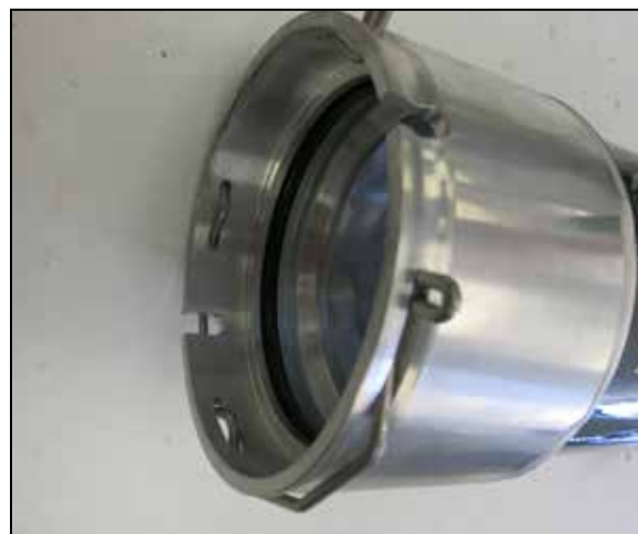
13. Install the O-ring and retaining clip into the K&N upper charge tube coupler. NOTE: Pay close attention to the direction of the lip seal position in the factory coupler and install it in the same direction into the K&N coupler.