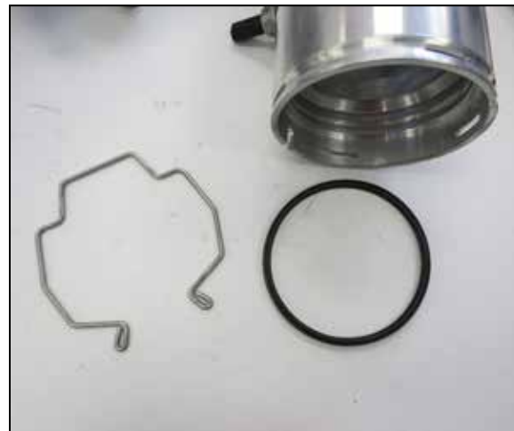
12. Remove the O-ring and retaining clip from the factory charge tube engine inlet coupler.