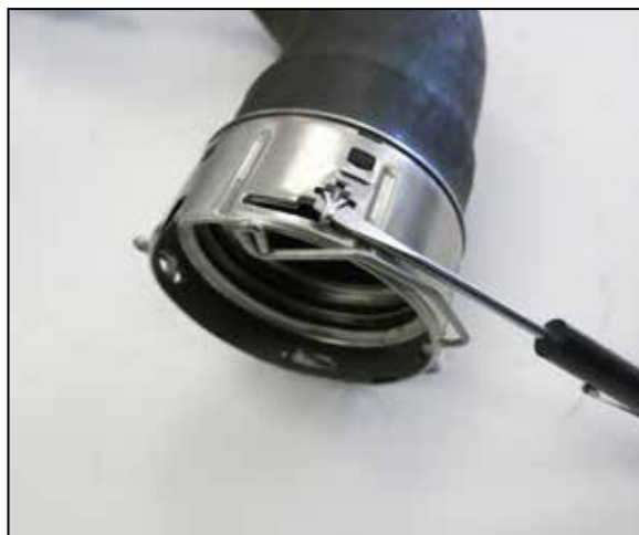
7. Release the tabs that retain the locking clip onto the factory intercooler coupler and then remove the clip from the coupler.