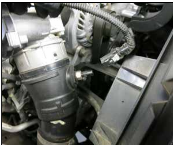
4. Disconnect the charge tube inlet temperature sensor electrical connection.