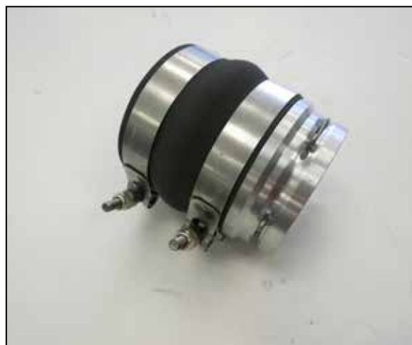
9. Install the provided hump coupler onto the intercooler coupler and secure with the provided clamp.