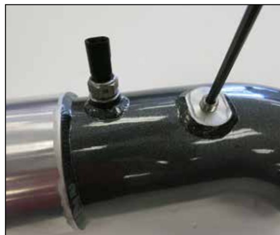
11. Install the 1/8 pipe plug into the accessory port.