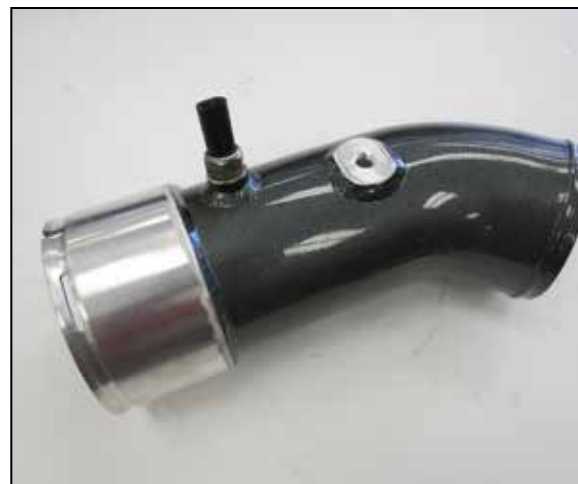
10. Remove the temperature sensor from the factory charge tube and install into the K&N upper charge tube.