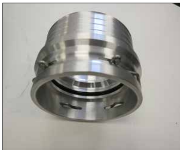
8. Install the locking clip onto the K&N intercooler coupler.