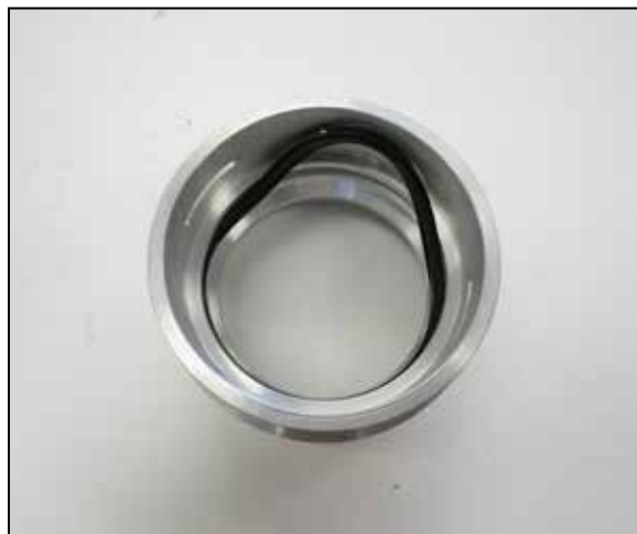
6. Remove the O-ring from the factory intercooler coupler and install it into the K&N coupler. NOTE: Pay close attention to the direction of the lip seal position in the factory coupler and install it in the same direction into the K&N coupler.