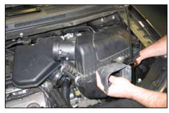
6. Remove the airbox from the vehicle. NOTE: Be sure to unhook the mass air sensor wiring harness from the airbox.