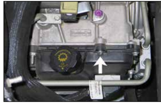
9. Remove the transmission pan bolt shown. NOTE: This bolt will be reused in the next step.

NOTE: These bolts will be reused in a later step.