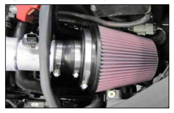
24. Install the filter assembly onto the intake tube and secure with the provided hose clamp.

NOTE: Drycharger® air filter wrap; part # RF-1042DK is available to purchase separately. To learn more about Drycharger® filter wraps or look up color availability please visit http://www.knfilters.com®.