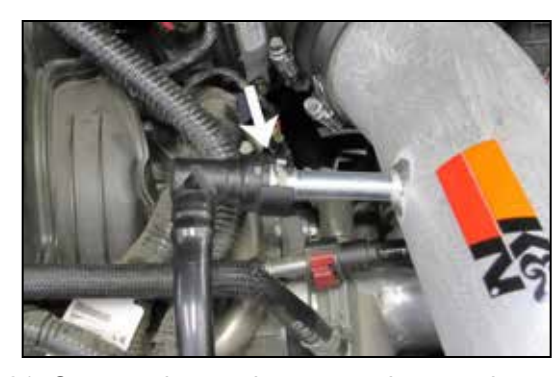
21. Connect the crankcase vent hose to the quick connect fitting on the K&N® intake tube as shown.