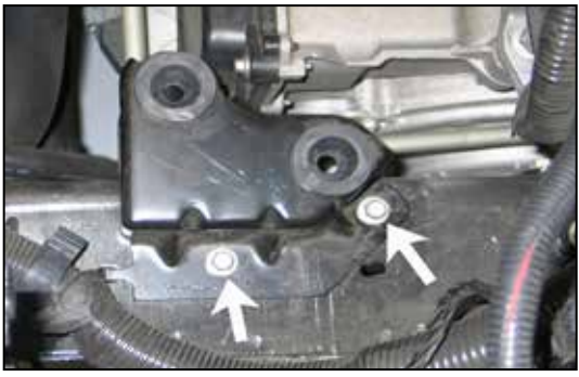
8. Remove the two bolts which secure the airbox mounting bracket to the inner fender.

NOTE: K&N Engineering, Inc., recommends that customers do not discard factory air intake.