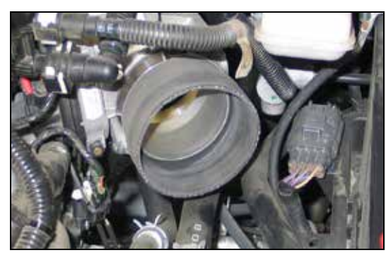
15. Install the silicone hose (084091) onto the throttle body and secure with the provided hose clamp

NOTE: On 2007 and 2008 model year vehicles, secure the wiring harness to the "L" bracket installed during step #12.