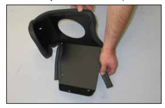
11. Install the provided edge trim onto the heat shield as shown.