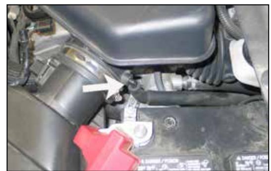
3. Disconnect the EVAP hose shown from the intake tube.