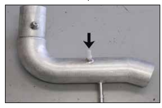
18. Install the provided 1/4npt fitting into the K&N<sup>®</sup> intake tube as shown.

NOTE: Plastic NPT fittings are easy to cross thread. Install the vent fitting "hand" tight, then turn it two complete turns with a wrench.