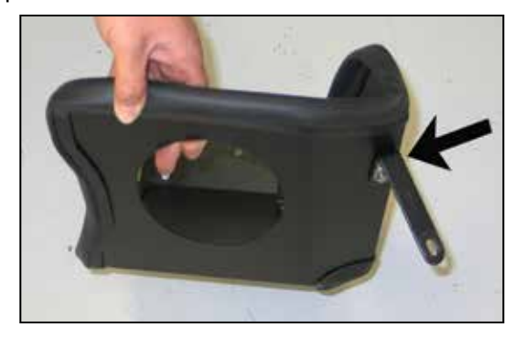
13. Install the provided "L" bracket (070094) onto the heat shield using the provided hardware as shown.