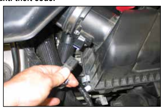
2. Release the red locking tab and then disconnect the mass air sensor electrical connection.

NOTE: Disconnecting the negative battery cable erases pre-programmed electronic memories. Write down all memory settings before disconnecting the negative battery cable. Some radios will require an anti-theft code to be entered after the battery is reconnected. The anti-theft code is typically supplied with your owner's manual. In the event your vehicles' anti-theft code cannot be recovered, contact an authorized dealership to obtain your vehicles anti-theft code.