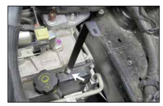
10. Install the intake tube mounting bracket (070095) onto the transmission pan and secure with the factory bolt removed in step #9.