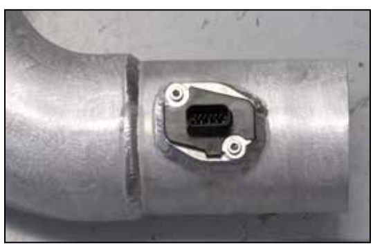
17. Install the mass air sensor into the K&N® intake tube and secure with the provided screws.