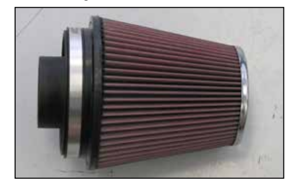
22. Install the filter adapter into the K&N® air filter and secure with the provided hose clamp.