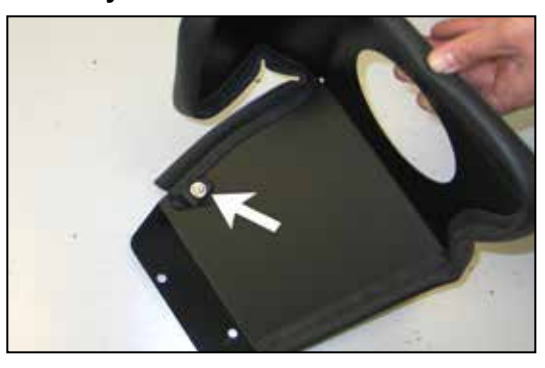
12. On 2007 and 2008 model vehicles, install the "L" bracket (070066) onto the heat shield using the provided hardware as shown.