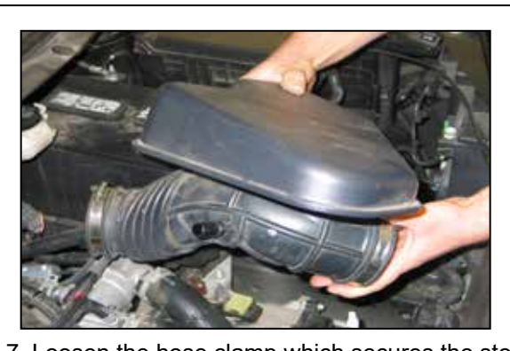
7. Loosen the hose clamp which secures the stock intake tube to the throttle body and then remove the intake tube from the vehicle.

NOTE: K&N Engineering, Inc., recommends that customers do not discard factory air intake.