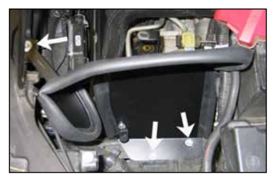
14. Install the heat shield into position on the inner fender and secure with the factory airbox mounting bracket bolts removed in step #8. Secure the heat shield mounting bracket to the airbox mounting bracket location on the core support using the factory bolt removed in step #5.

NOTE: On 2007 and 2008 model year vehicles, secure the wiring harness to the "L" bracket installed during step #12.