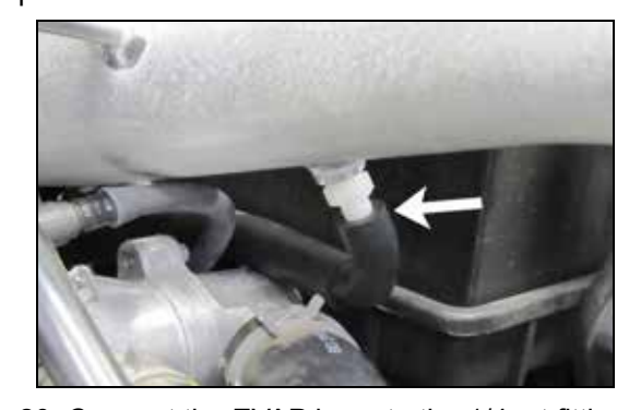
20. Connect the EVAP hose to the 1/4npt fitting as shown.