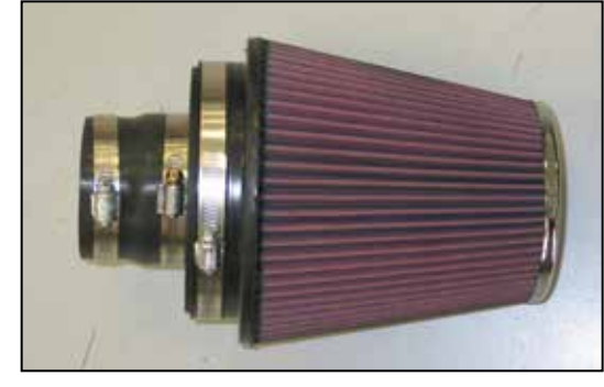
23. Install the silicone (08051) hose onto the filter adapter and secure with the provided hose clamp.