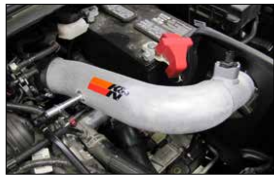
19. Install the K&N® intake tube into the silicone hose at the throttle body and align with the mounting bracket installed in step #10. Secure the intake tube with hose clamp and hardware provided.

NOTE: Plastic NPT fittings are easy to cross thread. Install the vent fitting "hand" tight, then turn it two complete turns with a wrench.