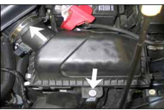
5. Loosen the hose clamp which secures the intake hose to the airbox. Remove the airbox mounting bolt shown.