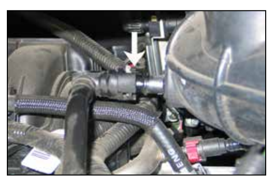
4. Rotate the locking tap and then disconnect the crankcase vent hose from the stock intake tube.