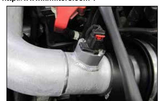
25. Using the provided mass air sensor extension harness, reconnect the mass air sensor electrical connection.

NOTE: Drycharger® air filter wrap; part # RF-1042DK is available to purchase separately. To learn more about Drycharger® filter wraps or look up color availability please visit http://www.knfilters.com®.