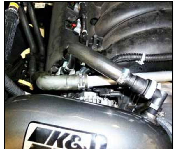
19. Connect the CCV hose assembly to the valve cover and intake tube fittings.