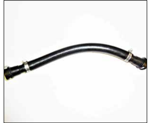
18. Assemble the CCV hose with the fittings, hose and clamps provided.