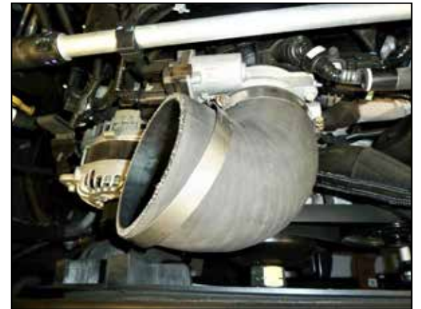
15. Install the angled coupler onto the throttle body but do not tighten the hose clamp at this time.