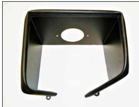
12. Install the provided edge trim onto the heat shield as shown. Some trimming of the edge trim will be necessary.