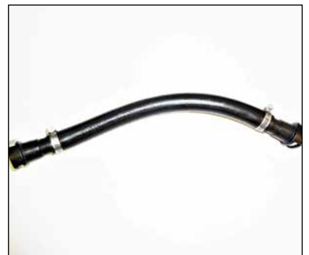
18. Assemble the CCV hose with the fittings, hose and clamps provided.