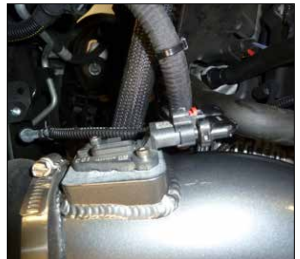
20. Reconnect the mass air sensor electrical connection.