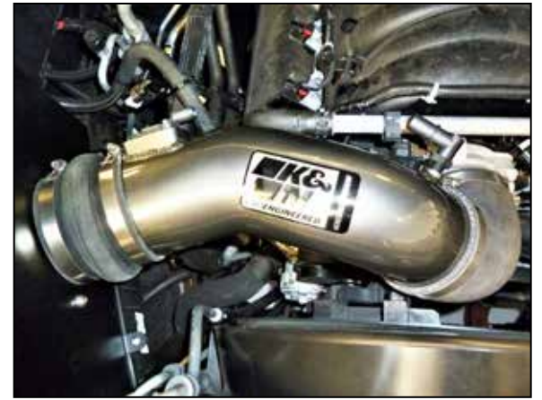
17. Install the intake tube into the couplers, adjust the coupler and tube for best fit and then secure with the provided hose clamps.