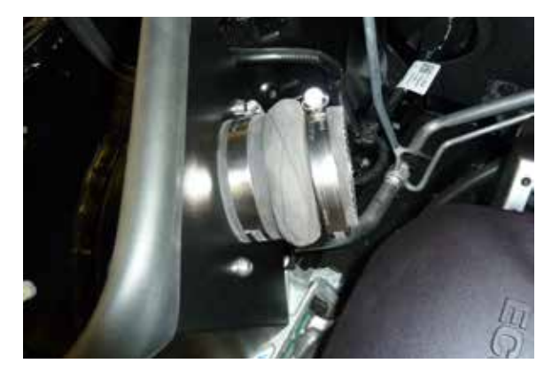
7. Install the provided hump coupler onto the filter adapter and secure with the provided hose clamp.