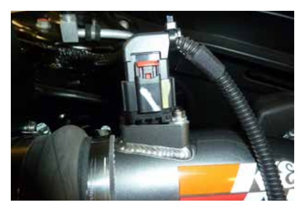
12. Reconnect the mass air sensor electrical connection.