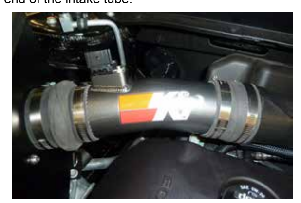
11. Install the intake tube into the hump coupler and then into the straight coupler, adjust the tube for best fit and then secure with the provided hose clamp.