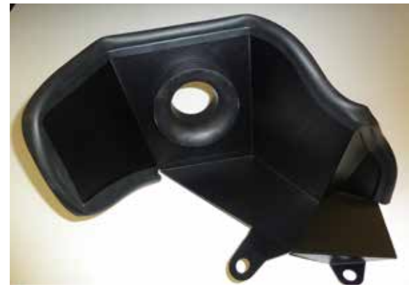
4.Install the edge trim onto the heat shield as shown. NOTE: Some trimming of the edge trim may necessary.