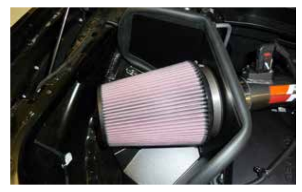
13. Install the K&N air filter onto the intake tube and secure with the provided hose clamp.