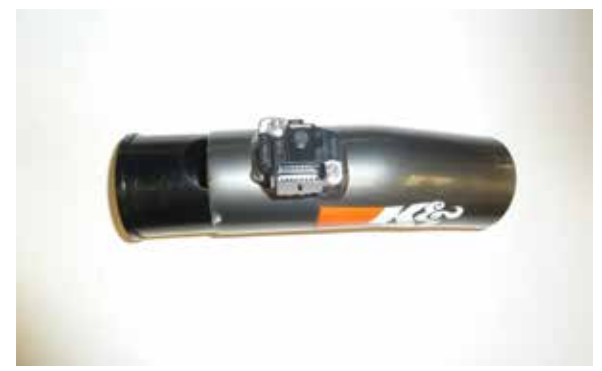
10. Install the maf sleeve into the K&N intake tube so the lip on the end of the sleeve stops against the end of the intake tube.