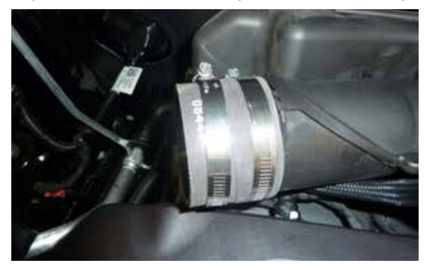
8. Install the provided straight coupler onto the intake plenum and secure with the provided hose clamp.