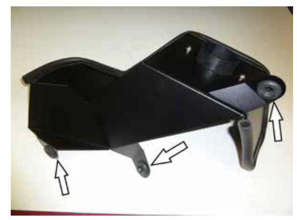
5. Remove the three factory mounting grommets from the factory air filter housing and install them into the K&N heat shield as shown.