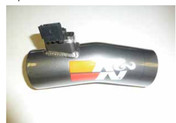
9. Remove the mass air sensor from the factory housing and install it into the K&N intake tube using the provided hardware.