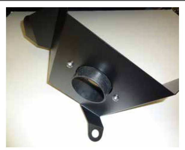
3. Install the radius filter adapter into the heat shield and secure with the provided hardware.

2.Disconnect the mass air sensor electrical connection and loosen the hose clamp that secures the intake hose to the plenum. Pull straight up and remove the complete air filter housing assembly from the vehicle. NOTE: K&N Engineering, Inc., recommends that customers do not discard factory air intake