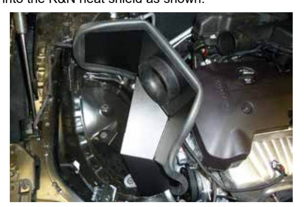
6. Install the heat shield assembly onto the mounting studs as shown.