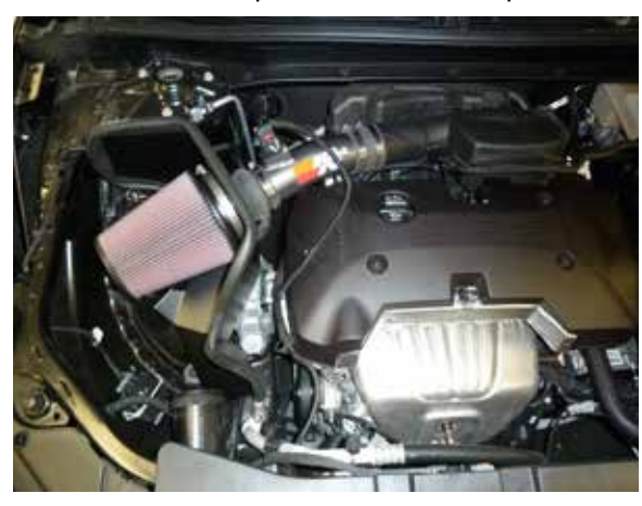
14. Reconnect the vehicle's negative battery cable. Double check to make sure everything is tight and properly positioned before starting the vehicle.