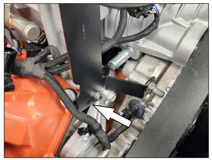
6. Plug wire harness holder in hole on the bracket.