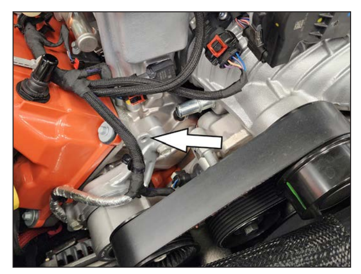
4. Remove factory wire harness holder by gently pulling towards the front of the vehicle.