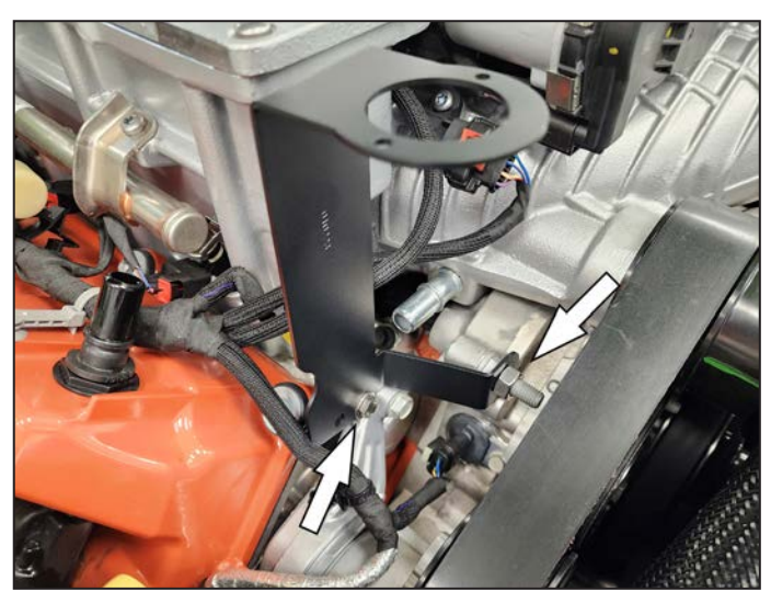
5. Mount the bracket by using the existing M10 below intake manifold connection using supplied nut. Use 1/4-20 hex head bolt, washer and nut through middle hole where wire harness holder was as shown.