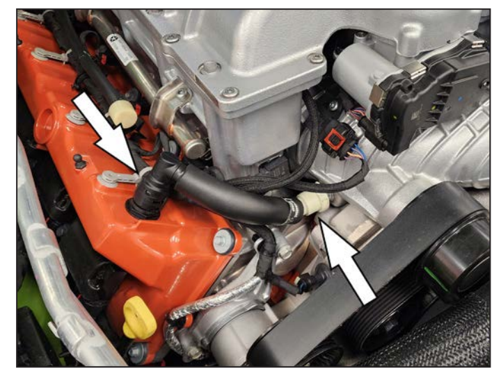
3. Remove factory PCV line by pulling tabs and removing it from the PCV valve and intake manifold