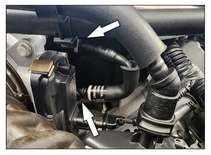
2. Remove factory PCV line by depressing grey button and removing it from the PCV valve and intake manifold.

1. Verify you have all the parts included in the kit.