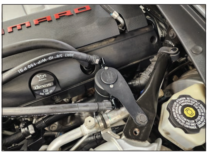
4. Mount the bracket by removing strut brace bolt closest to the firewall (shown in Figure), then mount the bracket using the existing bolt. NOTE: Vehicles equipped with a strut bar will need to uninstall prior to mounting the oil separator.