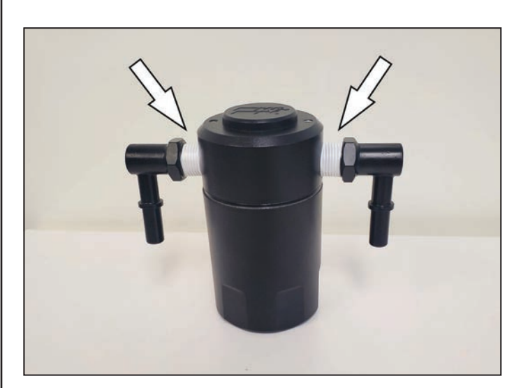
3. Assemble the quick disconnect fittings to the top of the air/oil separator. It is required to use Teflon tape on the fittings to ensure a proper seal. NOTE: DO NOT over-tighten fittings in top of oil separator. Mount the canister to the bracket using the two button head screws and lock washers.