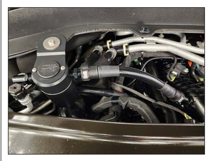
5. Install hoses on to oil separator as shown. Mount the long hose going to the PCV valve. Mount the short hose to the intake manifold. NOTE: Lightly coat the O-Ring with oil to insert easily.

6. We recommend to check the oil separator every 10,000 miles or 12 months (sooner if vehicle is driven in harsher conditions such as towing or off-road).