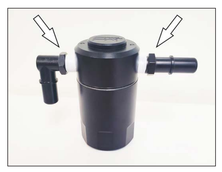
3. Assemble the quick disconnect fittings to the top of the air/oil separator as shown. Mount the straight quick disconnect on the driver side and the 90 degree on the passenger side. It is required to use Teflon tape on the fittings to ensure a proper seal. NOTE: DO NOT over-tighten fittings in top of oil separator. Mount the canister to the bracket using the two button head screws and lock washers.