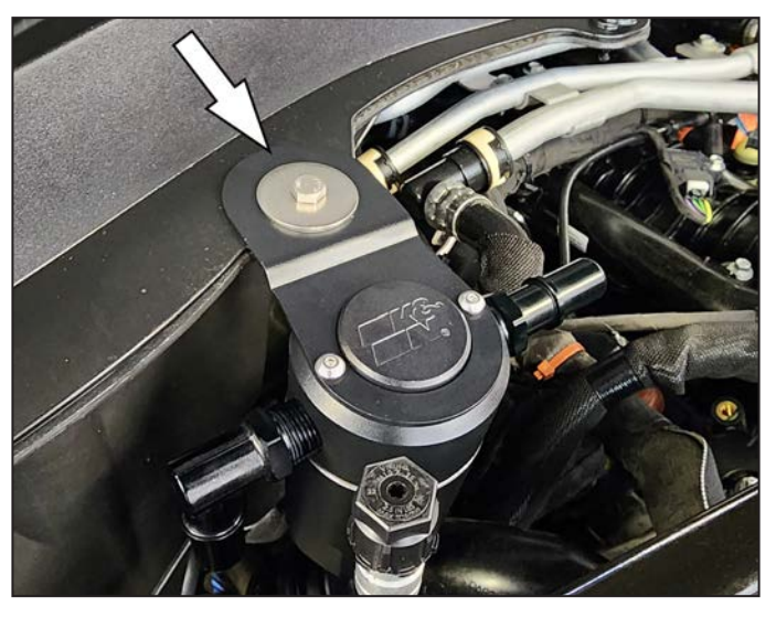
4. Mount the to the top of the cowling using M6 bolt, large flat washer and nut as shown.