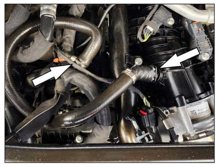
2. Remove factory PCV line by pulling tabs and removing it from the PCV valve and intake manifold

1. Verify you have all the parts included in the kit.