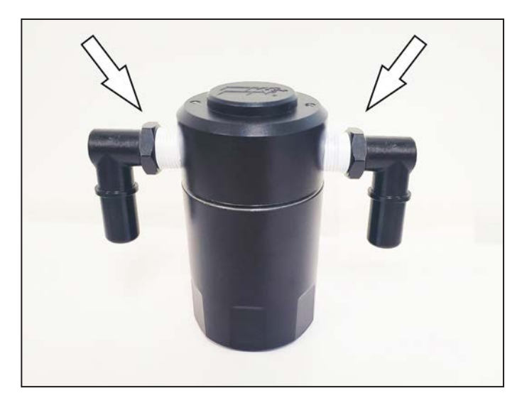
3. Assemble the quick disconnect fittings to the top of the air/oil separator as shown. It is required to use Teflon tape on the fittings to ensure a proper seal. NOTE: DO NOT over-tighten fittings in top of oil separator.