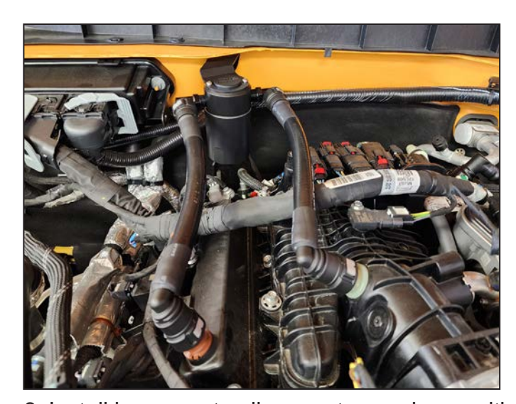
6. Install hoses on to oil separator as shown with K&N logo facing the front of the vehicle. Mount the hose on passenger side to valve cover PCV connection. Mount the hose on the driver side to the intake manifold. NOTE: Lightly coat the O-Ring with oil to insert easily.

5. Mount the canister to the bracket using the two button head screws and lock washers.