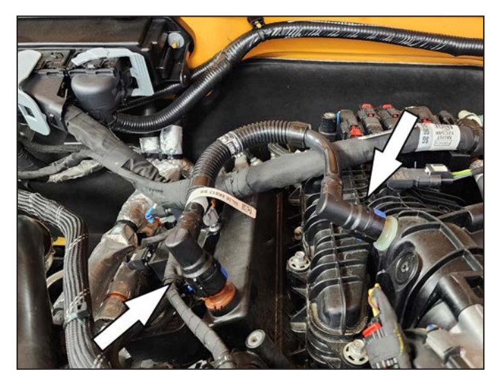
2. Remove factory PCV line by pulling tabs and removing it from the PCV valve and intake manifold

1. Verify you have all the parts included in the kit.