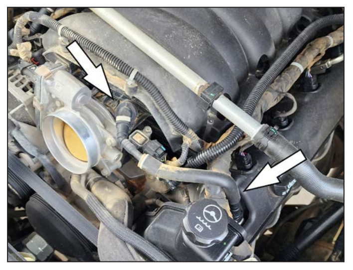
2. Remove factory PCV line by depressing grey button and removing it from the PCV valve and intake manifold

1. Verify you have all the parts included in the kit.