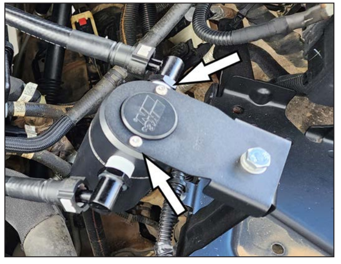
5. Mount the canister to the bracket using the two button head screws and lock washers