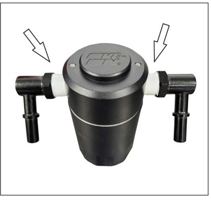
3. Assemble the quick disconnect fittings to the top of the air/oil separator. It is required to use Teflon tape on the fittings to ensure a proper seal. NOTE: DO NOT over-tighten fittings in top of oil separator