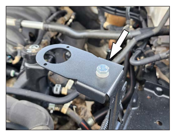
4. Mount the bracket on auxiliary battery tray mount using supplied M8 nut, lock washer and flat washer (shown in Figure)