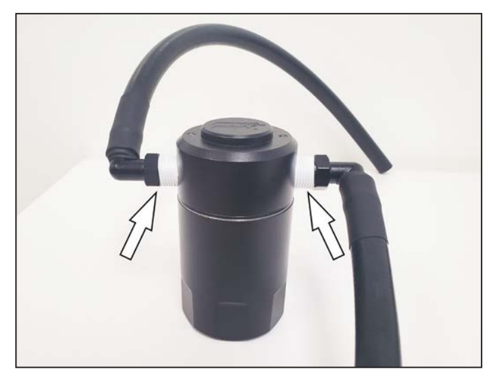
3. Assemble the quick disconnect fittings to the top of the air/oil separator as shown. It is required to use Teflon tape on the fittings to ensure a proper seal. NOTE: DO NOT over-tighten fittings in top of oil separator.