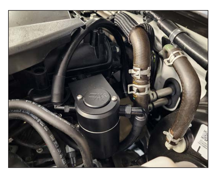
5. Mount the canister to the bracket using the two button head screws and lock washers. Mount the hose on passenger side to the rear of the engine using the stock hose clamp. Mount the hose on driver side to the intake manifold using the stock hose clamp.

NOTE: Lightly coat the O-Ring with oil to insert easily.