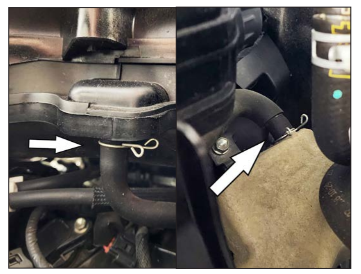
2. Remove factory PCV line at the manifold and rear of the engine by pinching clamp and moving away from end of the tubing.

1. Verify you have all the parts included in the kit.