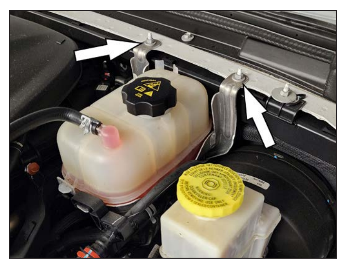
4. Remove nuts from coolant reservoir and pull up and off studs for additional clearance routing the hoses