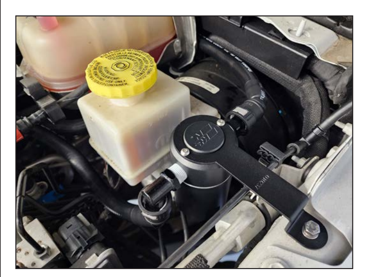
8. Install the bracket using the supplied 10mm bolt, lock washer and flat washer in the empty threaded hole on the fender shown. Mount the long hose from the valve cover to the straight fitting of the canister. Mount the short hose from the intake manifold to the 90 degree connection on the canister. NOTE: Lightly coat the O-Ring with oil to insert easily

7. Connect the short hose to the intake manifold and route under the brake fluid reservoir