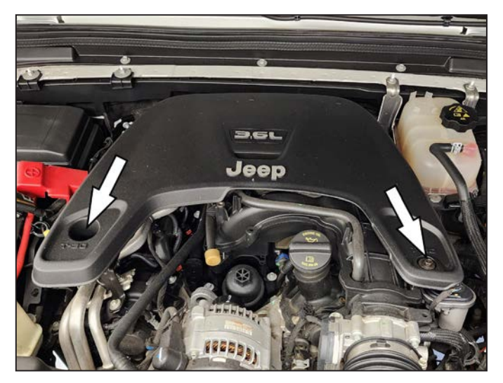
2. Remove engine cover by removing the two 10mm bolts

1. Verify you have all the parts included in the kit.