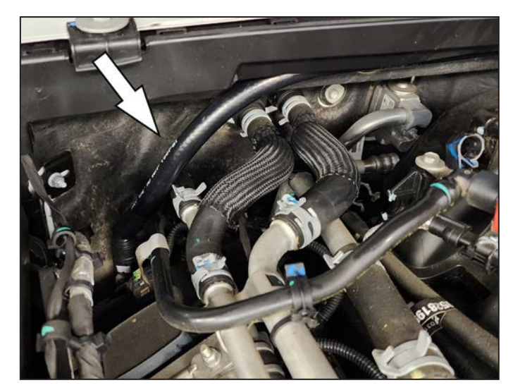
6. Route the long hose along the back of the firewall behind the coolant reservoir. Connect to the valve cover and remount the coolant reservoir

7. Connect the short hose to the intake manifold and route under the brake fluid reservoir