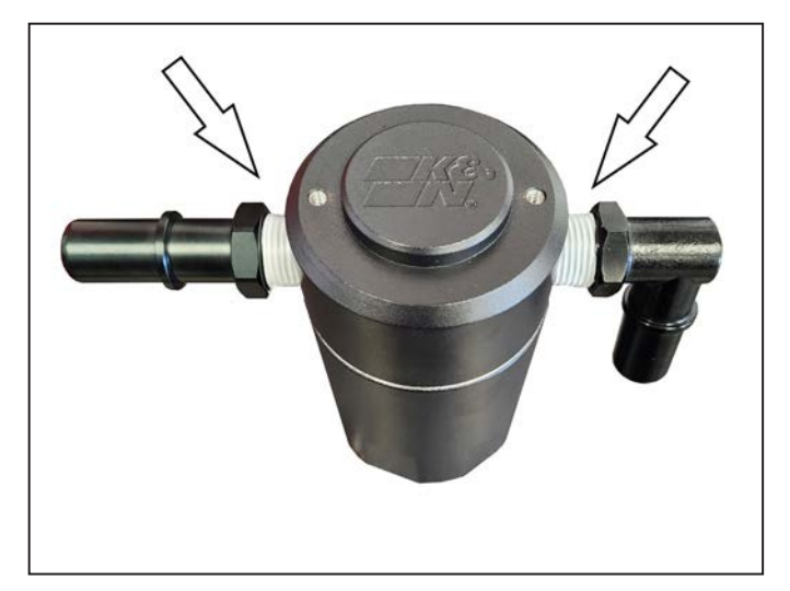
5. Assemble the quick disconnect fittings to the top of the air/oil separator as shown. It is required to use Teflon tape on the fittings to ensure a proper seal. NOTE: DO NOT over-tighten fittings in top of oil separator