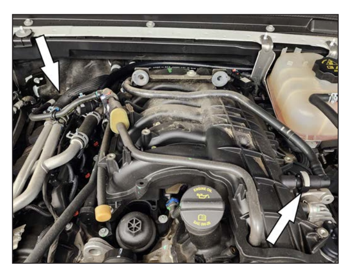
3. Remove factory PCV line by depressing the button and removing it from the PCV valve and intake manifold